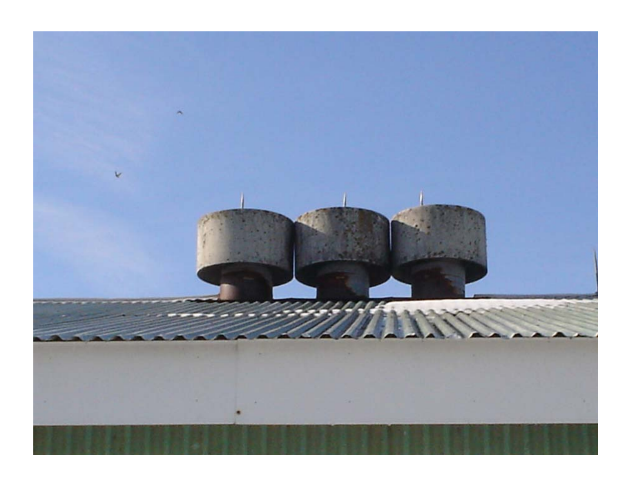
HA # 18 – Assumed asbestos containing transite roof vent covers