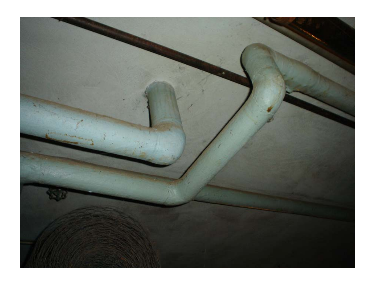
HA #9 – Asbestos containing domestic water supply pipe joint and hanger insulation