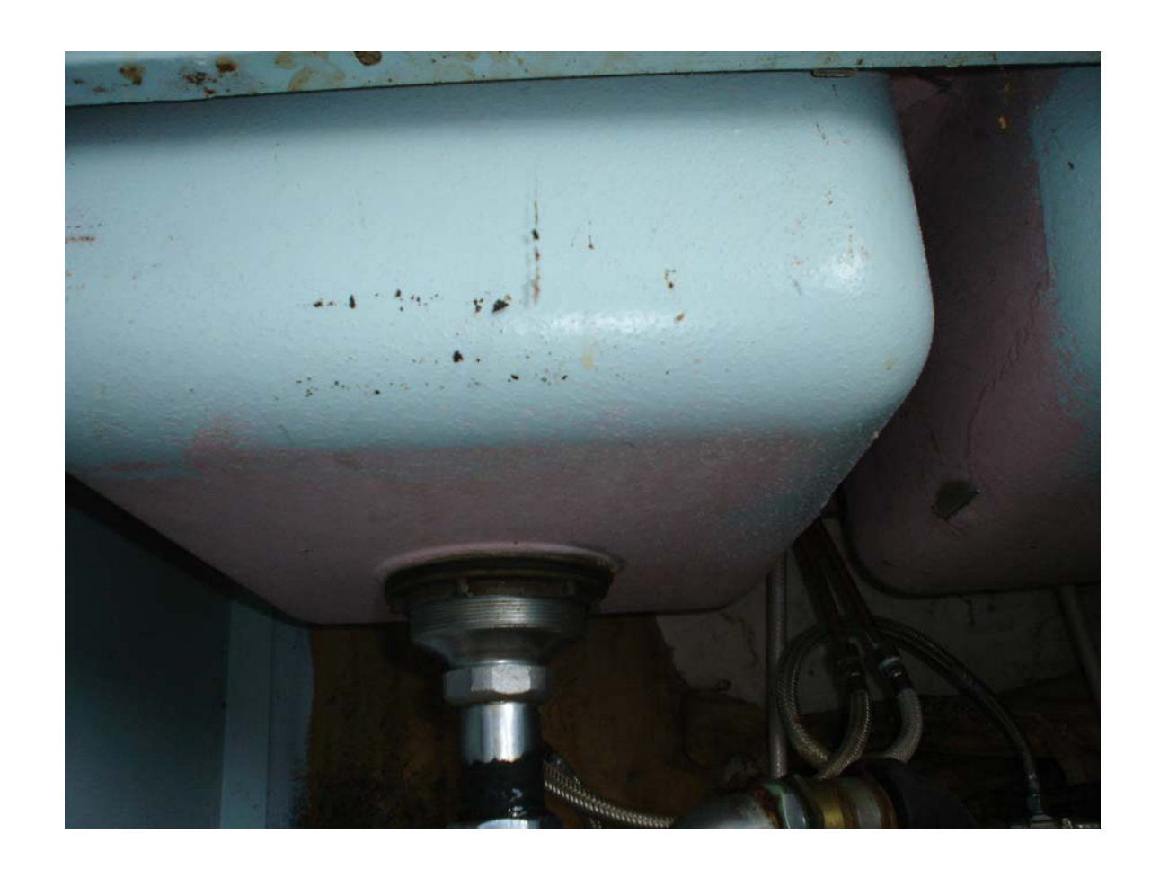
HA #14 – Non asbestos containing pink sink undercoating insulation