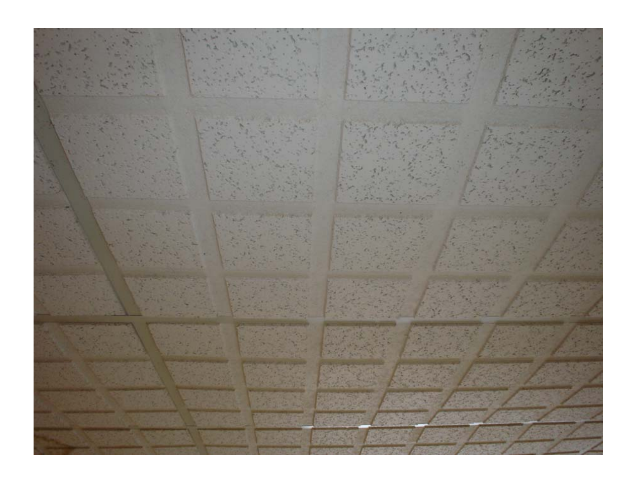
HA # 4 – Non asbestos containing 2' x 4' lay-in white ceiling tile with raised 4" x 4" squares with pin holes and fissures