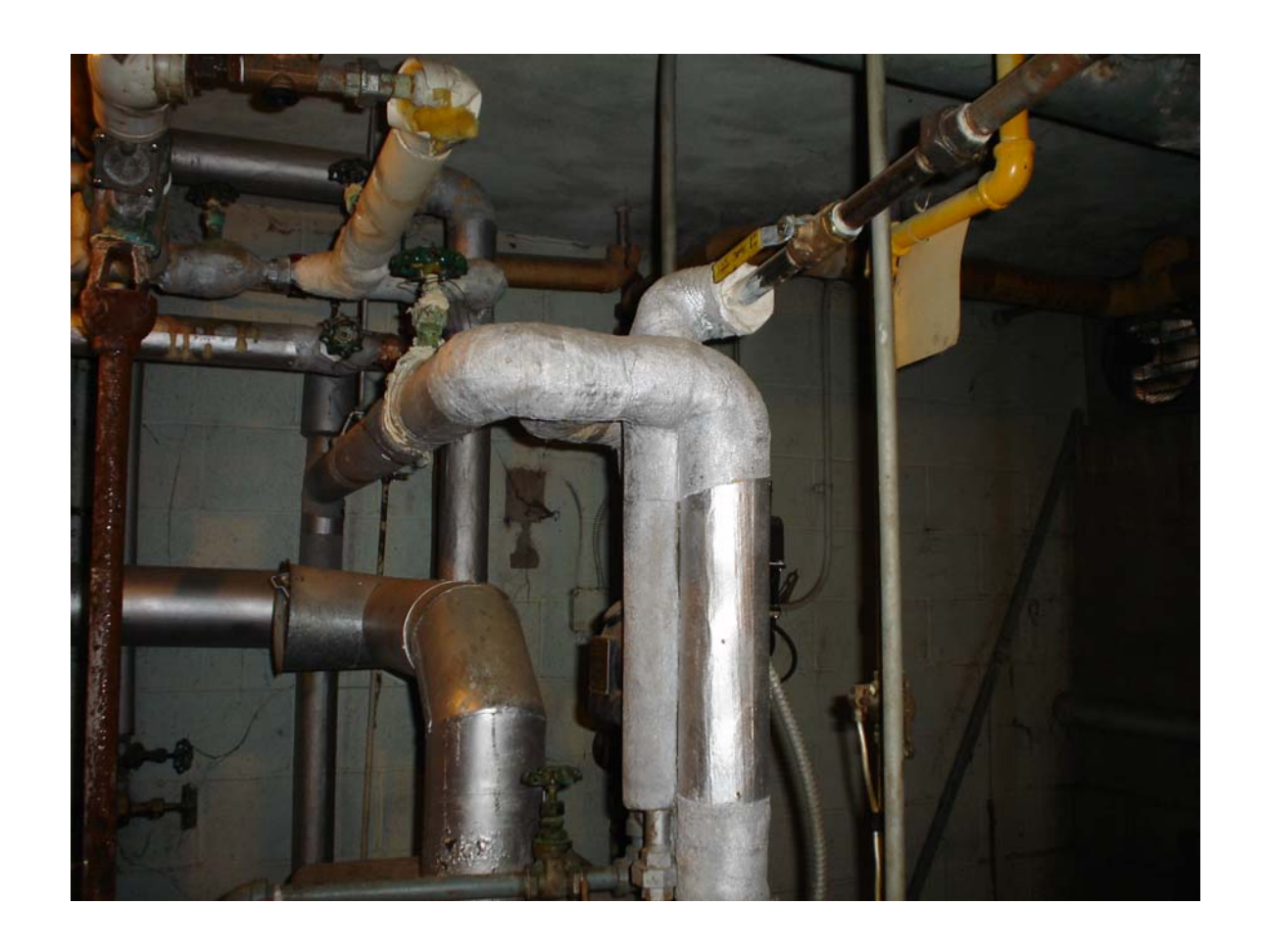
HA #8 – Asbestos containing steam/condensate supply and return pipe joint and hanger insulation