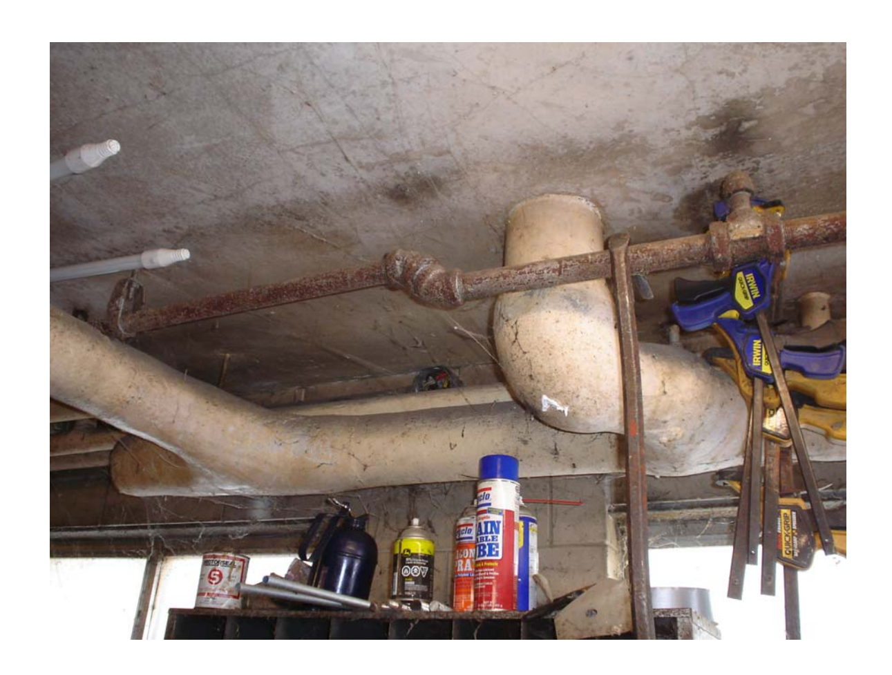
HA #11 – Asbestos containing drain line pipe joint and hanger insulation