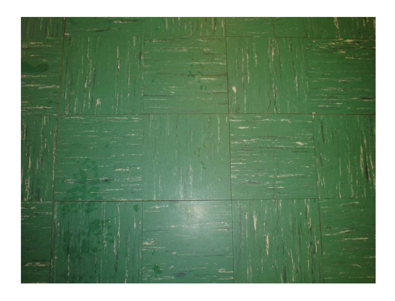
HA #1 – Non asbestos containing 9" x 9" green floor tile with white and black streaks and associated mastic