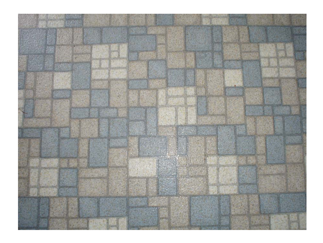
HA # 15 – Non asbestos containing multi-colored square pattern linoleum and associated mastic