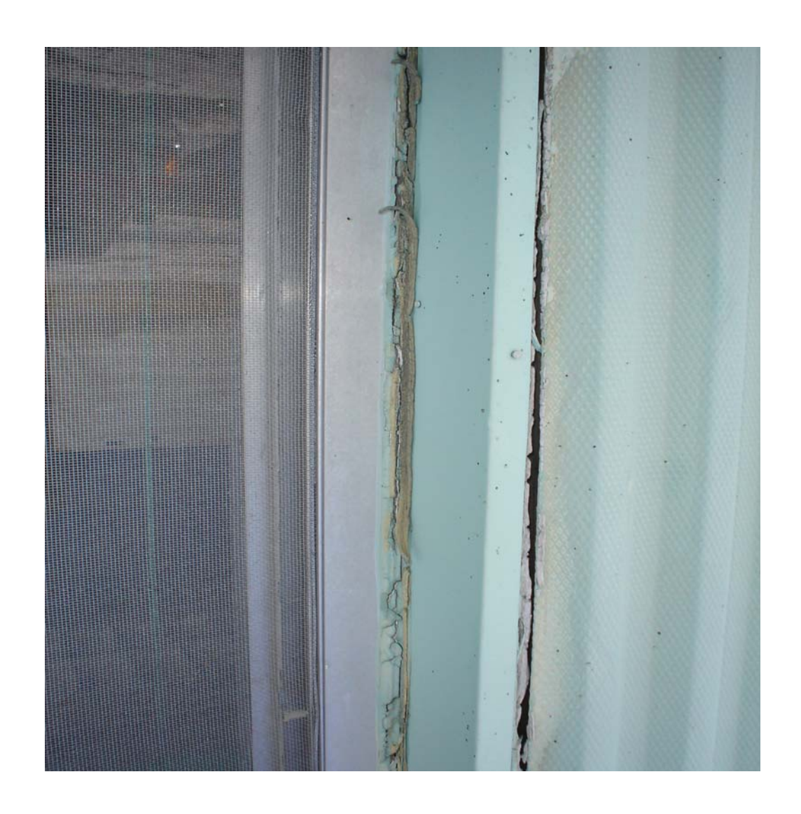
HA # 17 – Asbestos containing window and door frame caulk compound