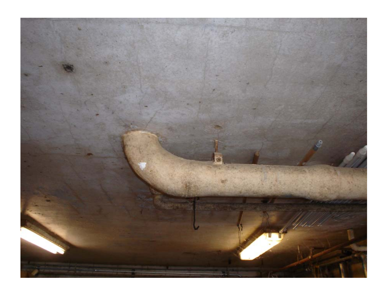
HA #7 – Non asbestos containing canvas wrap on fiberglass pipe straight insulation