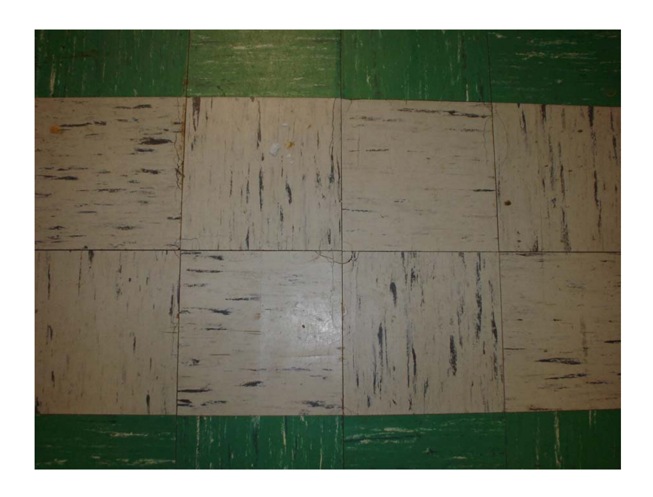
HA #2 – Non asbestos containing 9" x 9" white floor tile with black streaks and associated mastic