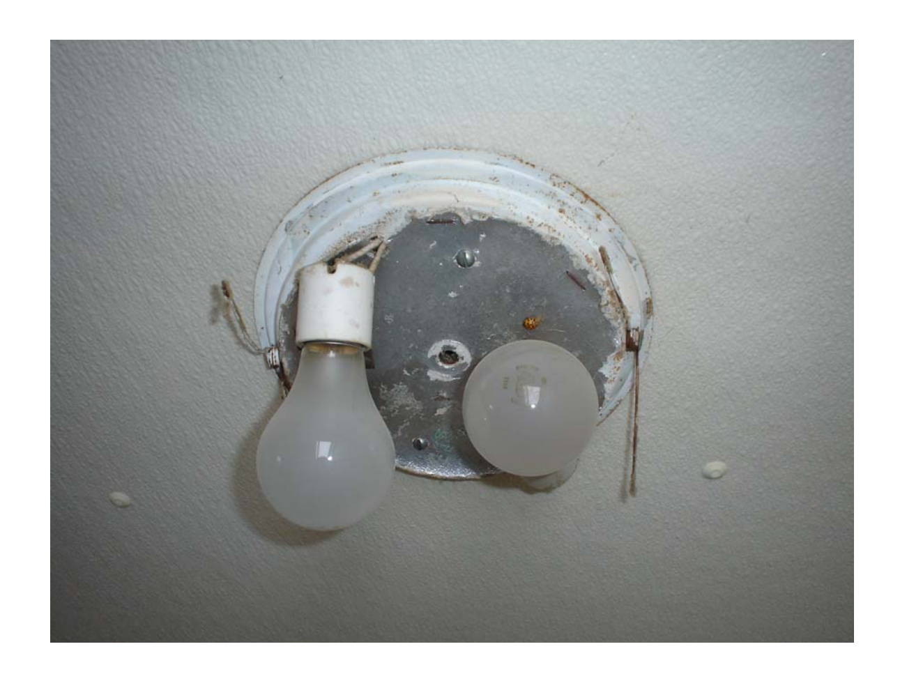
HA #6 – Asbestos containing light heat shield insulation