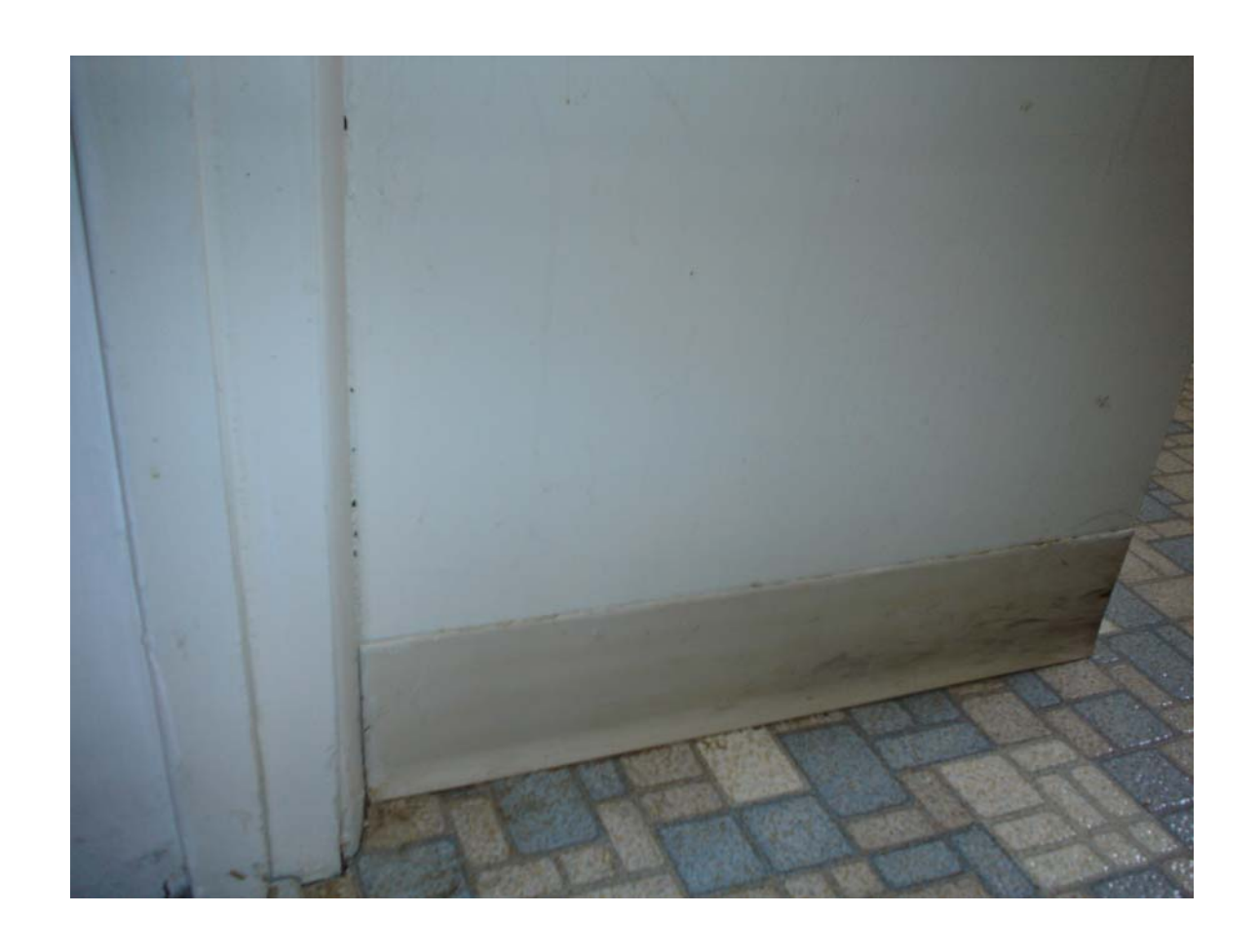
HA # 16 – Non asbestos containing 4" white cove molding and associated mastic