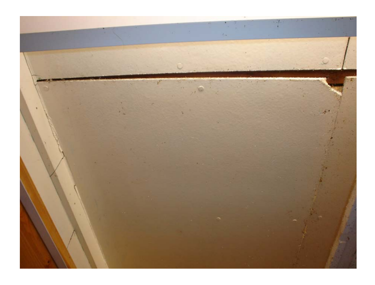
HA #3 – Asbestos containing transite wall and ceiling panels