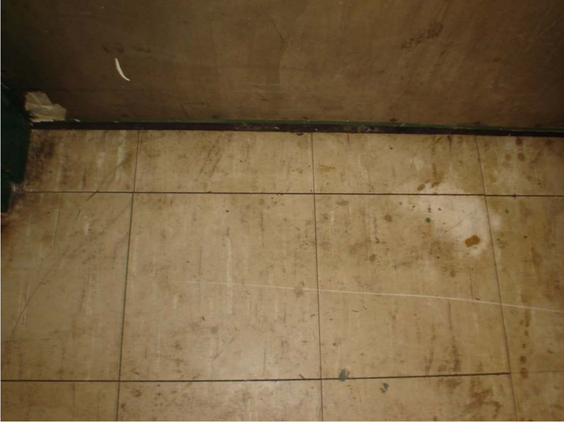
Non asbestos-containing 12" x 12" tan floor tile with cream and rust streaks and associated mastic

For more information contact MSU Environmental Health and Safety – (517) 353-8956