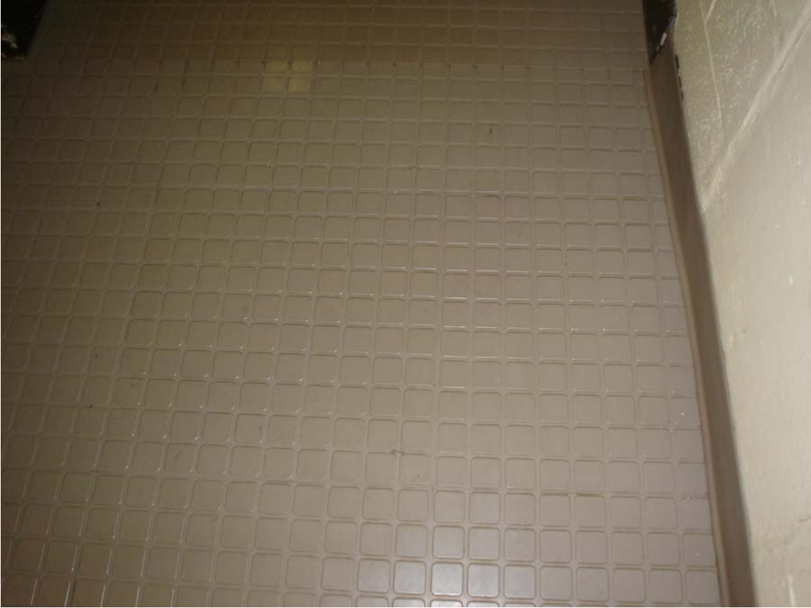
Non asbestos-containing tan linoleum with small squares and associated mastic

For more information contact MSU Environmental Health and Safety – (517) 353-8956