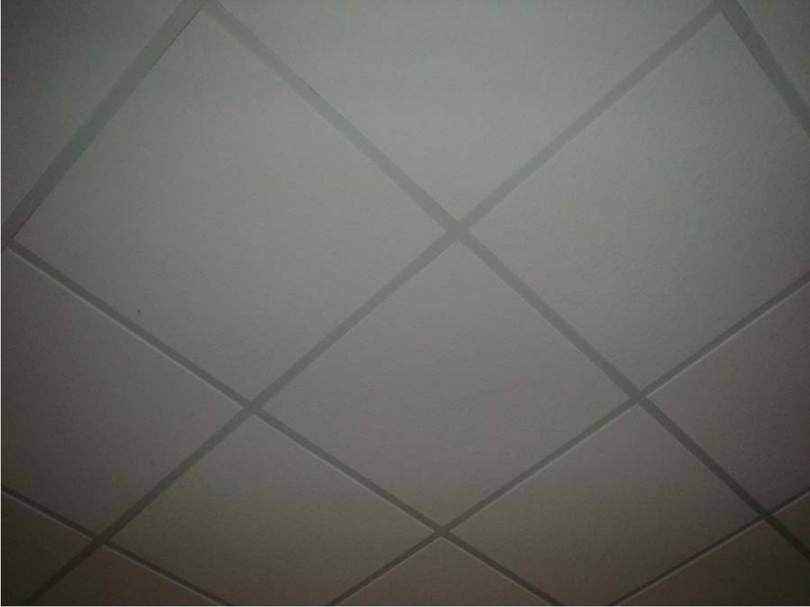
Non asbestos-containing 2' x 2' white drop-in ceiling tile with light texture

For more information contact MSU Environmental Health and Safety – (517) 353-8956