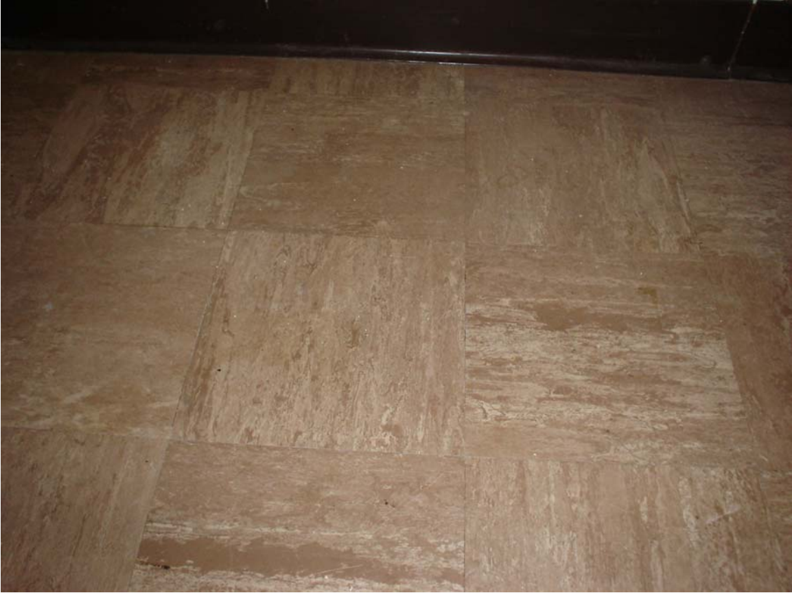
Asbestos-containing 9" x 9" tan floor tile with swirl pattern and associated mastic

For more information contact MSU Environmental Health and Safety – (517) 353-8956