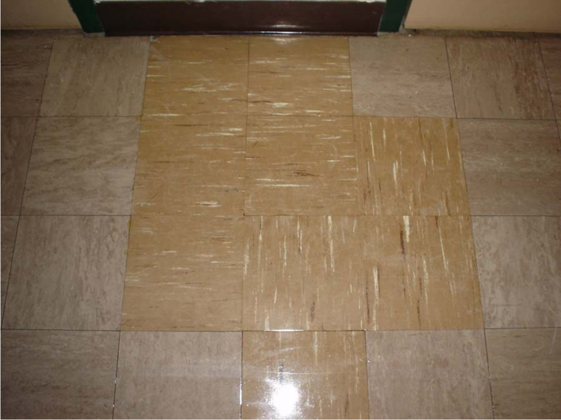
Non asbestos-containing 9" x 9" tan floor tile with cream and rust streaks and associated mastic

For more information contact MSU Environmental Health and Safety – (517) 353-8956