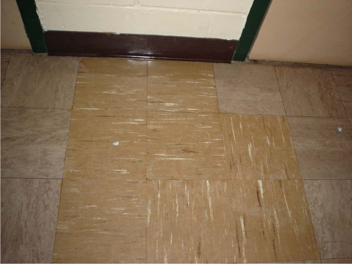
Non asbestos-containing 9" x 9" tan floor tile with cream and rust streaks and associated mastic

For more information contact MSU Environmental Health and Safety – (517) 353-8956