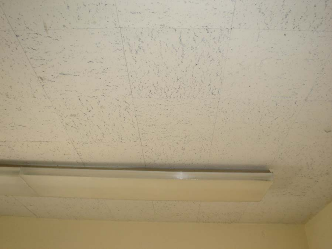
Non asbestos-containing 12" x 12" white ceiling tile with fissures and associated glue pods

For more information contact MSU Environmental Health and Safety – (517) 353-8956