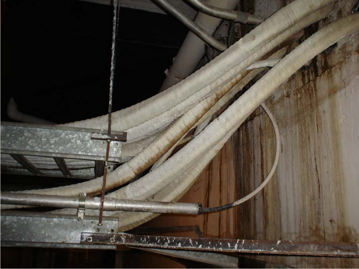
Asbestos-containing electrical insulation cloth

For more information contact MSU Environmental Health and Safety – (517) 353-8956