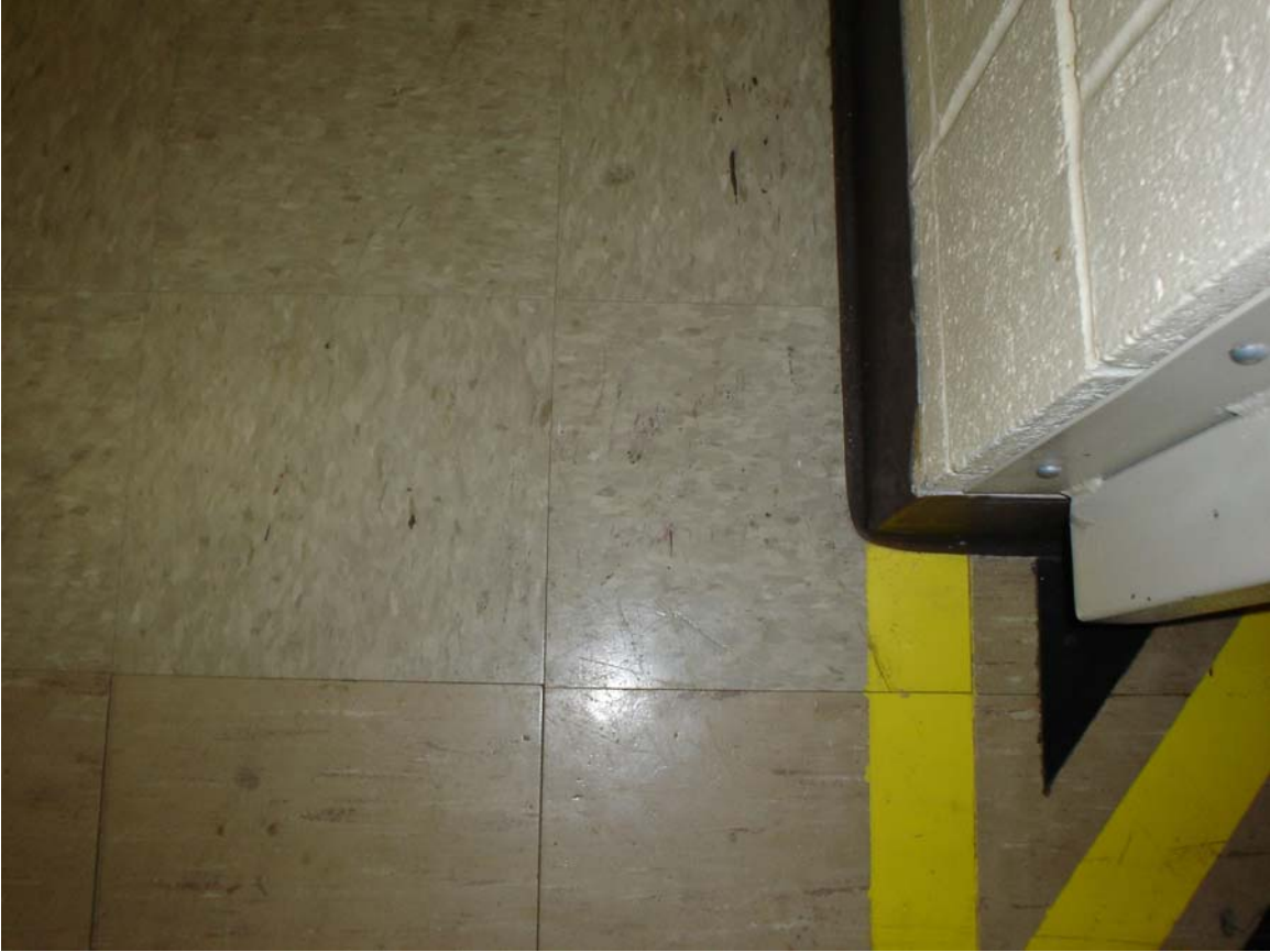
Non asbestos-containing 12" x 12" cream floor tile with marble pattern and associated mastic

For more information contact MSU Environmental Health and Safety – (517) 353-8956