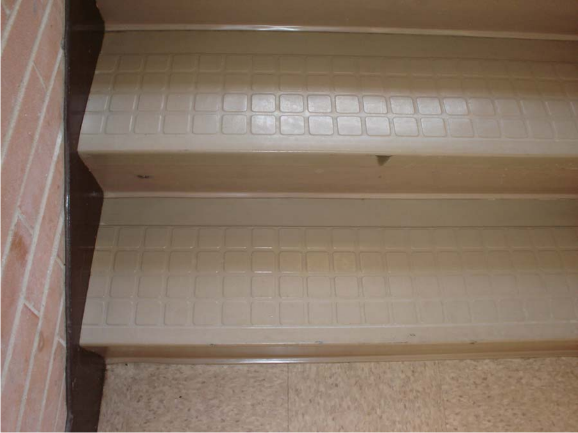
Non asbestos-containing tan vinyl stair tread with small square pattern and associated mastic

For more information contact MSU Environmental Health and Safety – (517) 353-8956