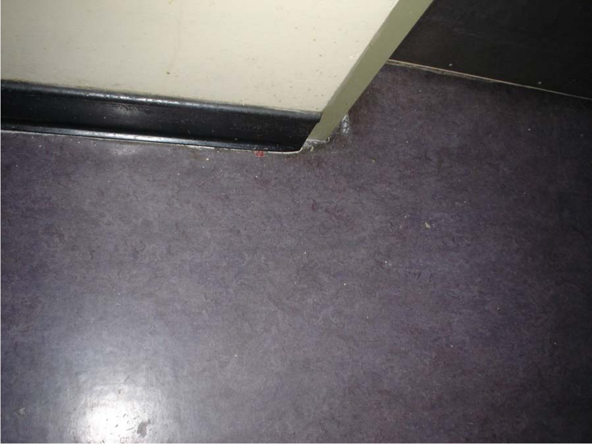
Non asbestos-containing purple linoleum flooring and associated mastic

For more information contact MSU Environmental Health and Safety – (517) 353-8956