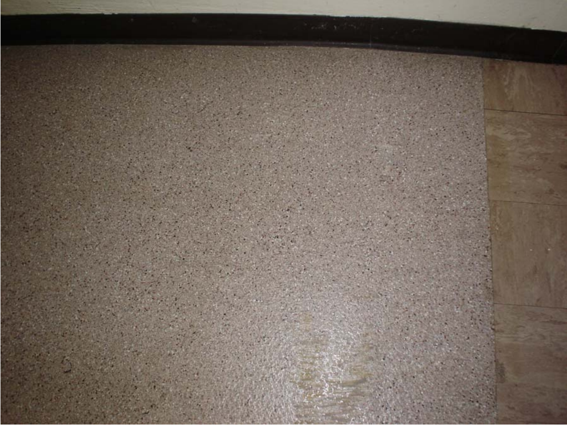
Non asbestos-containing beige multi-colored flooring material and associated mastic

For more information contact MSU Environmental Health and Safety – (517) 353-8956