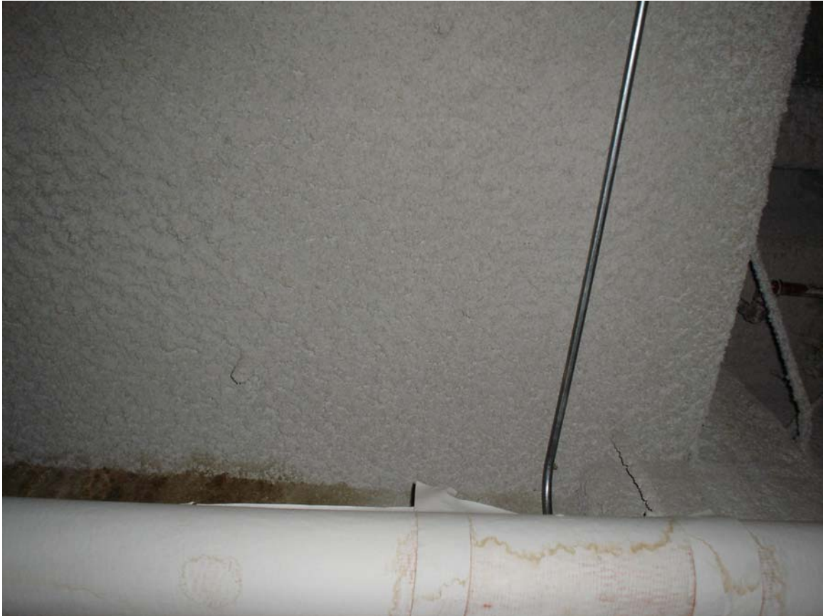
Non asbestos-containing spray-on fireproofing

For more information contact MSU Environmental Health and Safety – (517) 353-8956