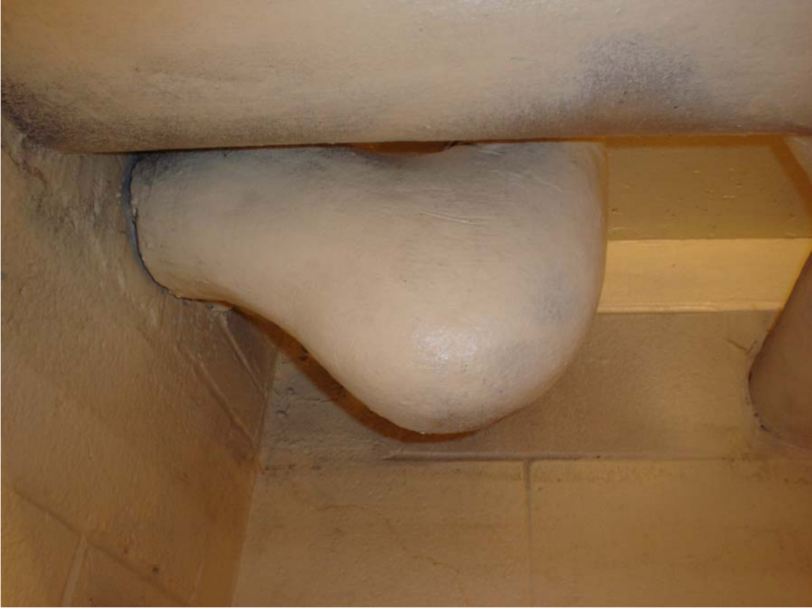
Asbestos-containing drain pipe joint and hanger insulation

For more information contact MSU Environmental Health and Safety – (517) 353-8956