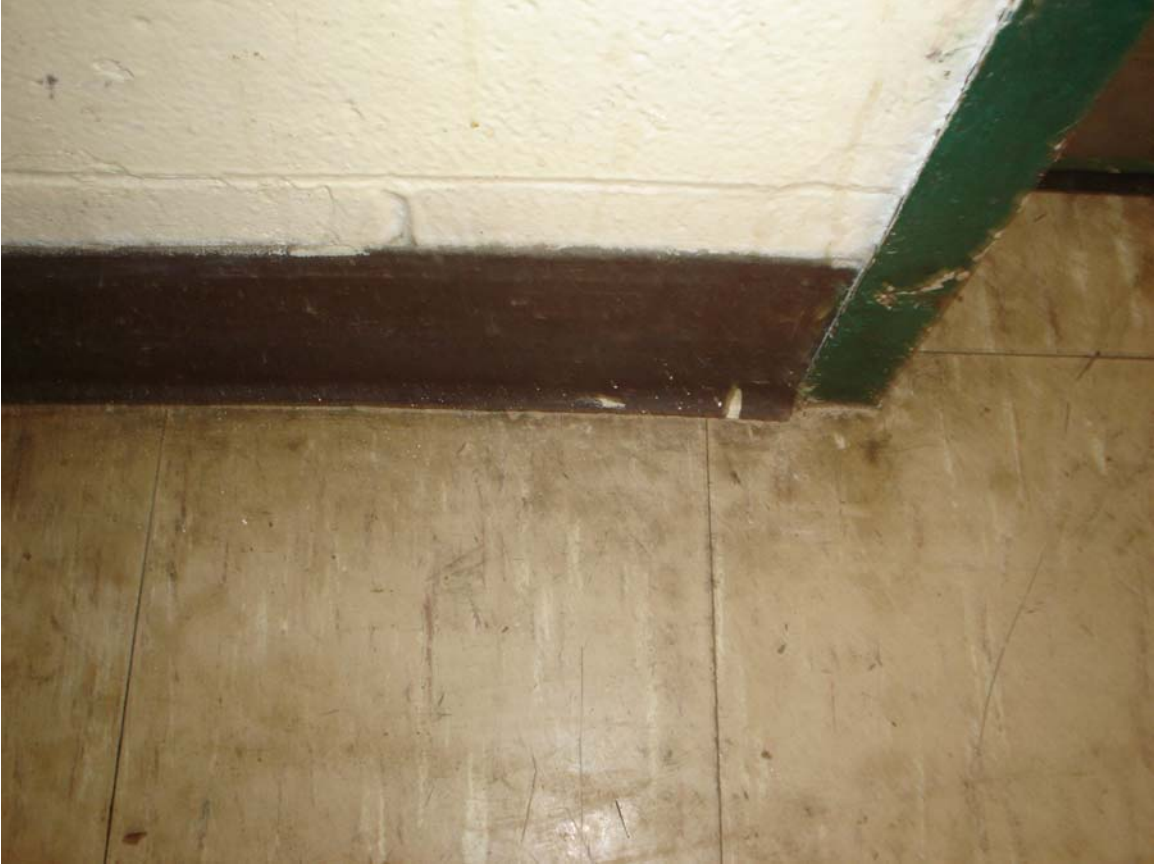
Non asbestos-containing 6" brown cove molding and associated mastic

For more information contact MSU Environmental Health and Safety – (517) 353-8956