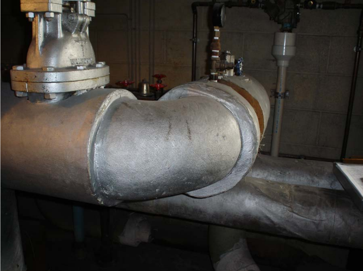
Asbestos-containing steam/condensate supply and return pipe joint and hanger insulation and Non asbestos-containing canvas wrap on fiberglass pipe straight insulation

For more information contact MSU Environmental Health and Safety – (517) 353-8956