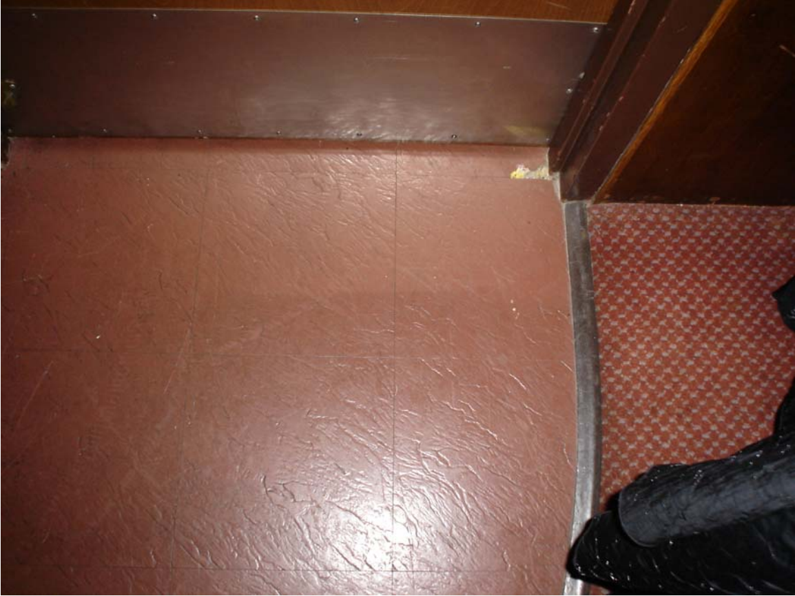
Non asbestos-containing 12" x 12" brown floor tile with ripple effect and associated mastic

For more information contact MSU Environmental Health and Safety – (517) 353-8956