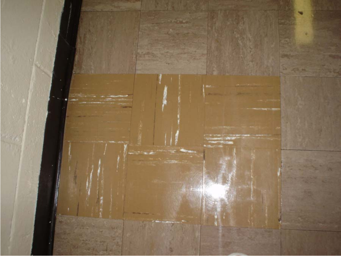
Non asbestos-containing 9” x 9” mustard floor tile with cream and rust streaks and associated mastic

For more information contact MSU Environmental Health and Safety – (517) 353-8956