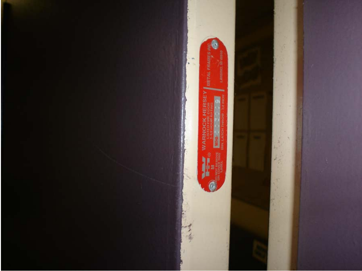
Assumed asbestos-containing fire door and frame

For more information contact MSU Environmental Health and Safety – (517) 353-8956