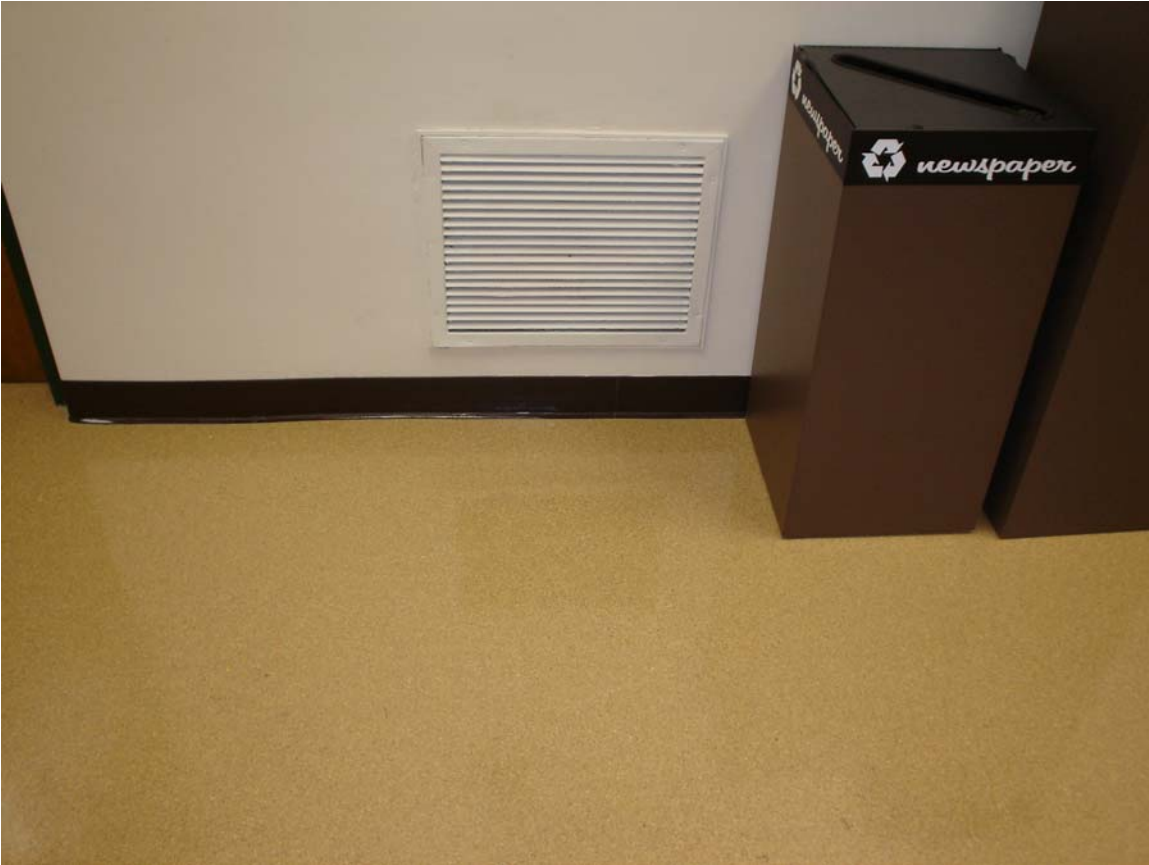
Non asbestos-containing 4" brown cove molding and associated mastic

For more information contact MSU Environmental Health and Safety – (517) 353-8956