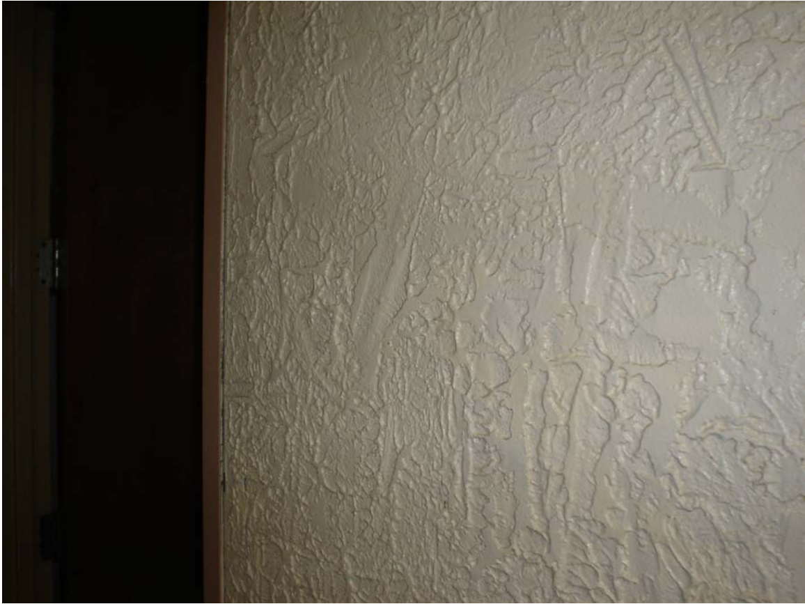
Non asbestos-containing textured plaster

For more information contact MSU Environmental Health and Safety – (517) 353-8956