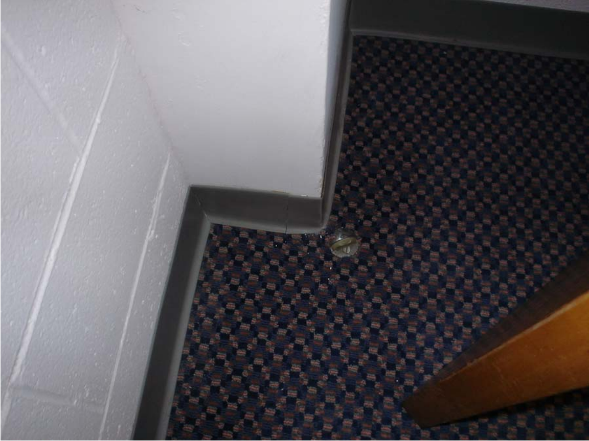
Non asbestos-containing 4" gray cove molding and associated mastic

For more information contact MSU Environmental Health and Safety – (517) 353-8956