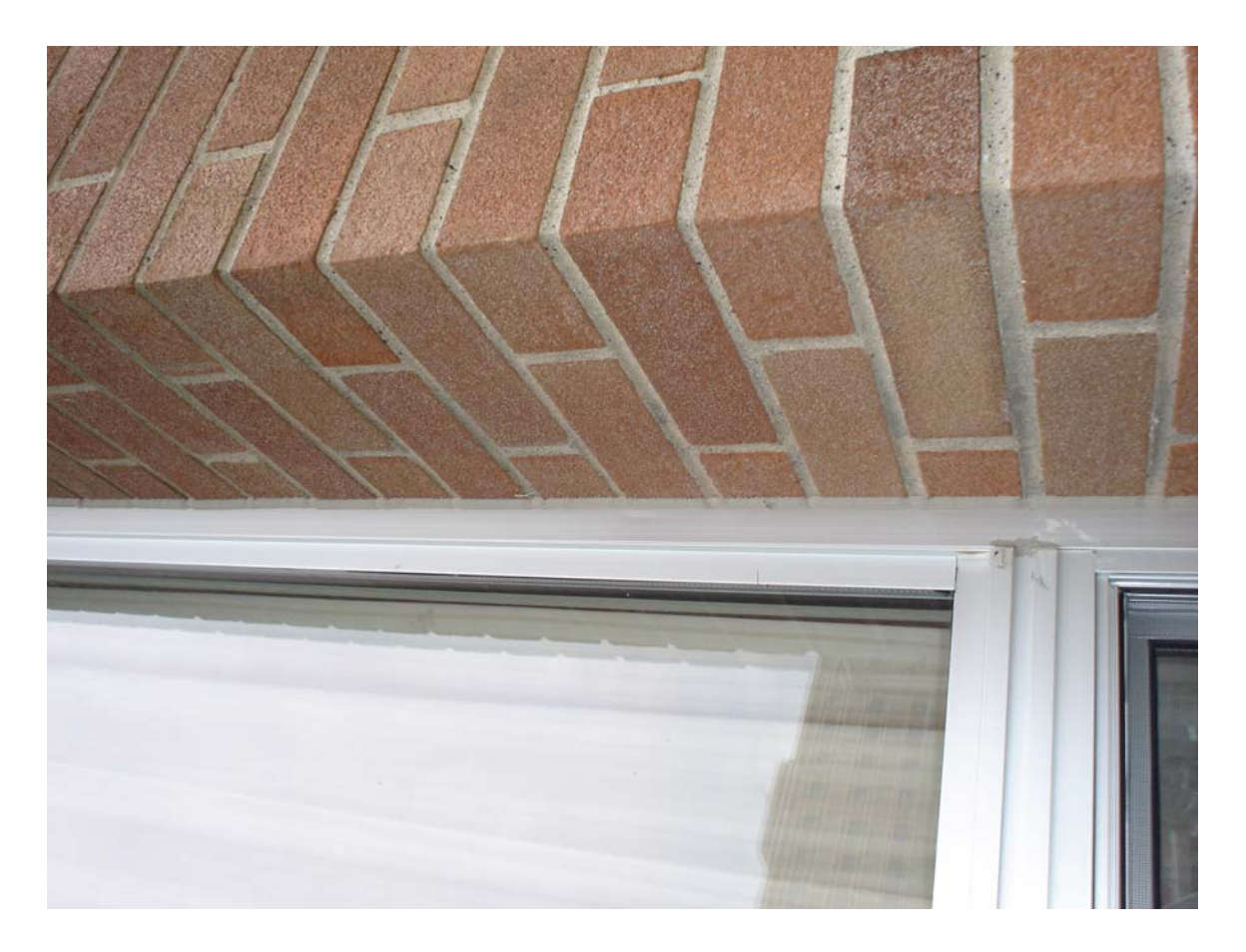
Photo 12 – Assumed asbestos-containing window and door frame caulk compound