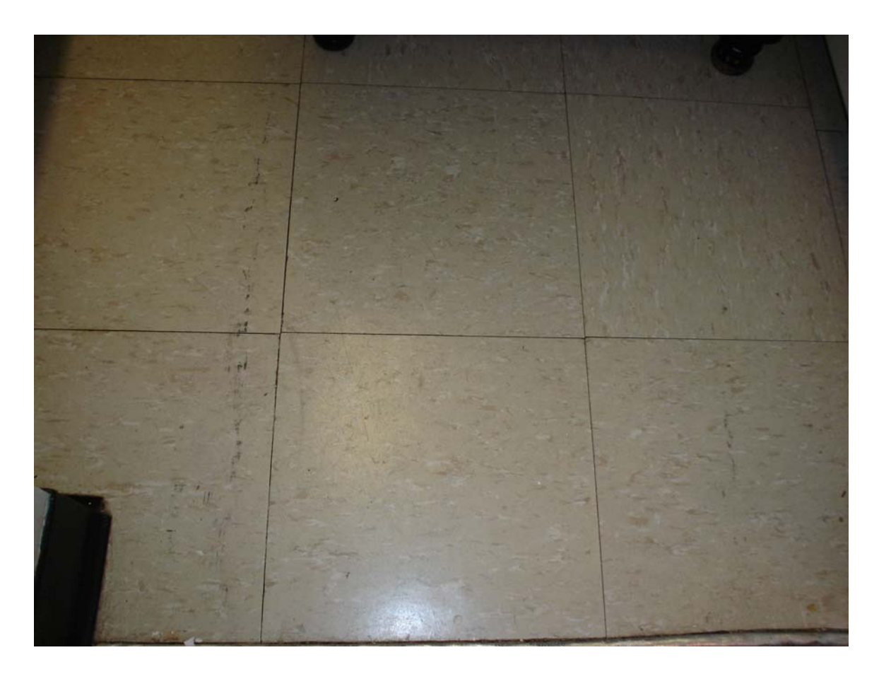
Photo 4 – Non asbestos-containing 12" x 12" cream floor tile with white and tan streaks and associated mastic