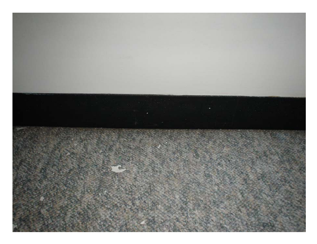
Photo 3 – Non asbestos-containing 4" black cove molding and associated mastic