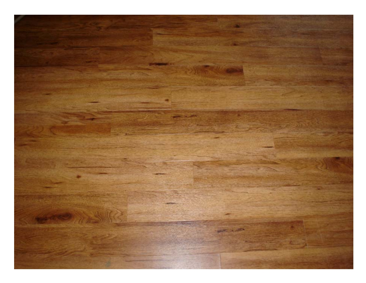
Photo 10 – Non asbestos-containing vinyl wood grain flooring and associated mastic