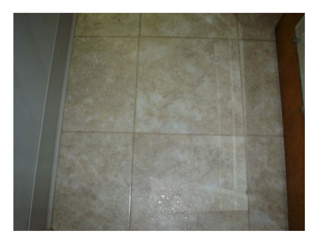
Photo 8 – Non asbestos-containing 12" x 12" tan linoleum with swirl pattern and associated mastic and Non asbestos-containing 4" cream cove molding and associated mastic