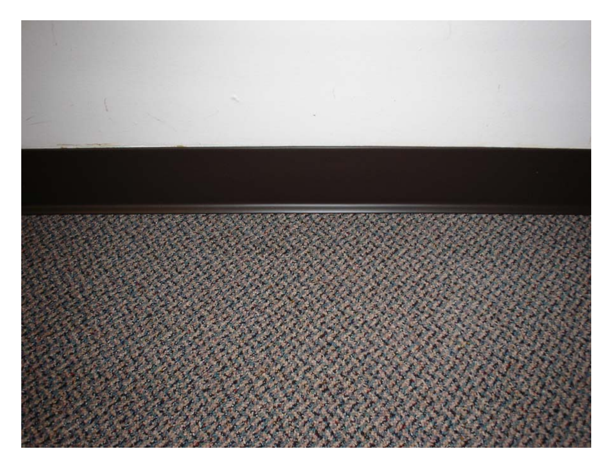
Photo 9 – Non asbestos-containing 4" brown cove molding and associated mastic