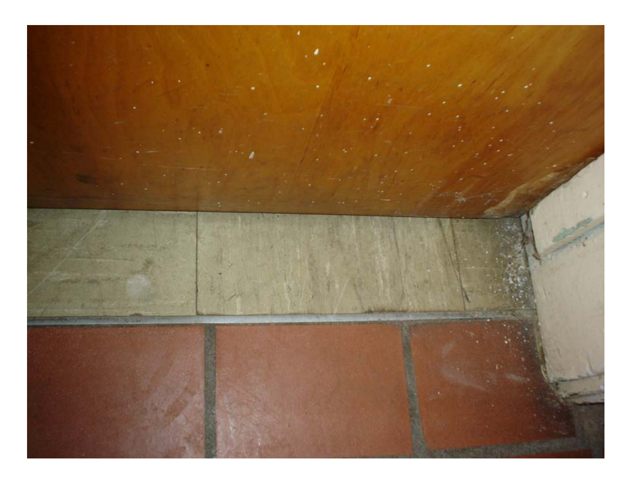
Photo 11 – Asbestos-containing 9" x 9" beige floor tile with cream and tan streaks and associated mastic