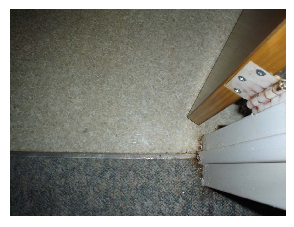
Photo 6 – Asbestos-containing cream linoleum with mosaic pattern and associated mastic