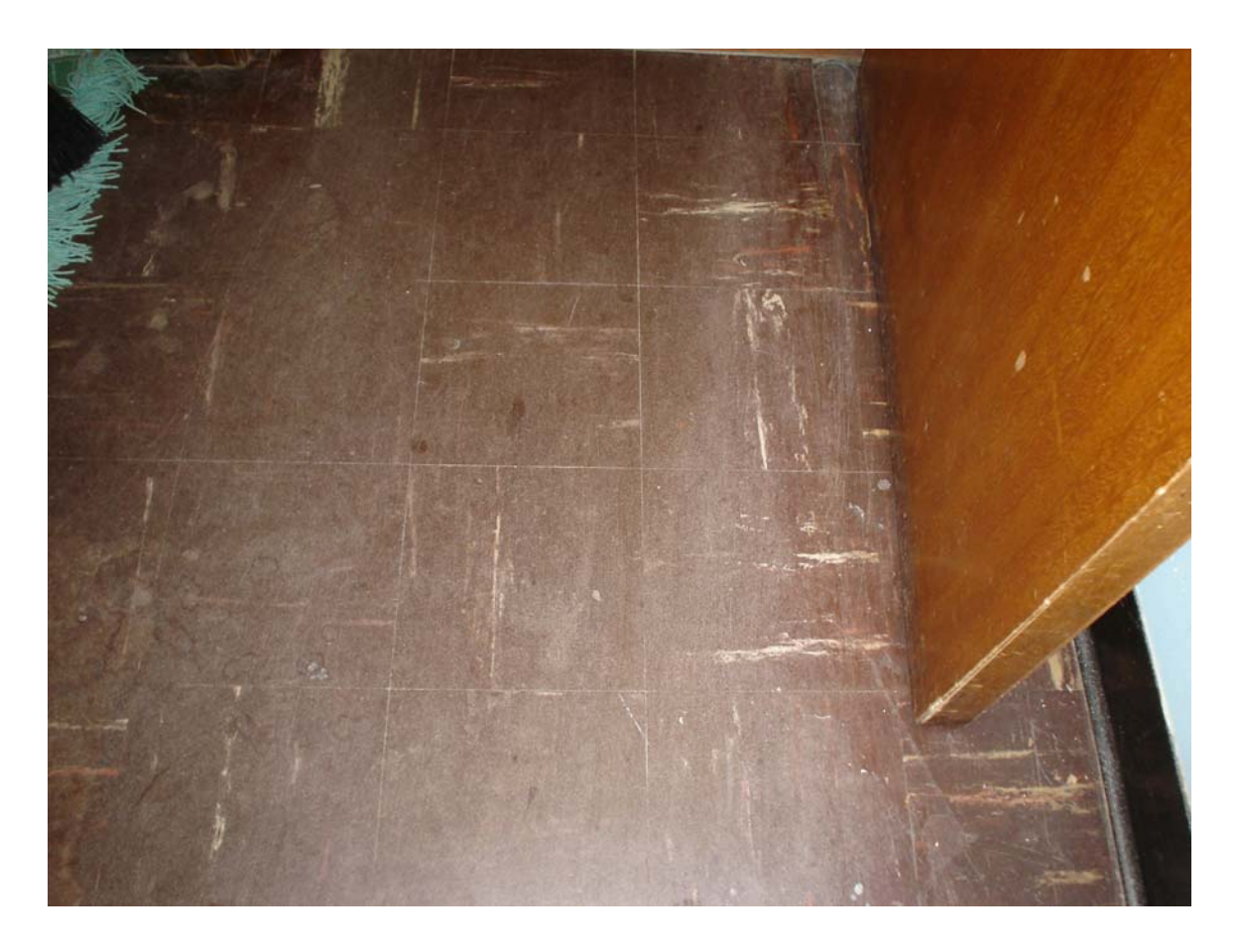
Photo 14 – Asbestos-containing 9" x 9" dark brown floor tile with cream and rust streaks and associated mastic