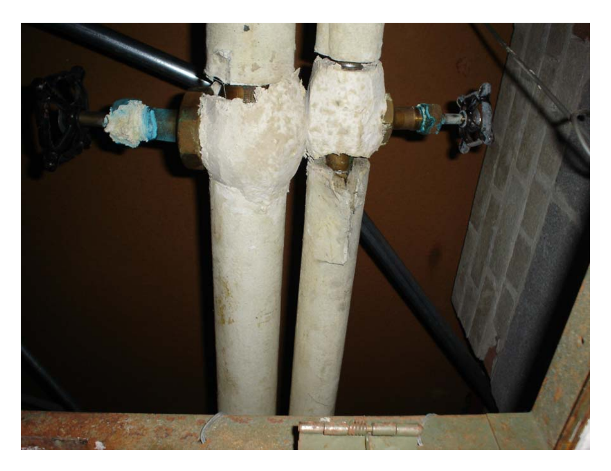
Photo 15 – Asbestos-containing steam/condensate supply and return pipe straight, pipe joint and hanger insulation