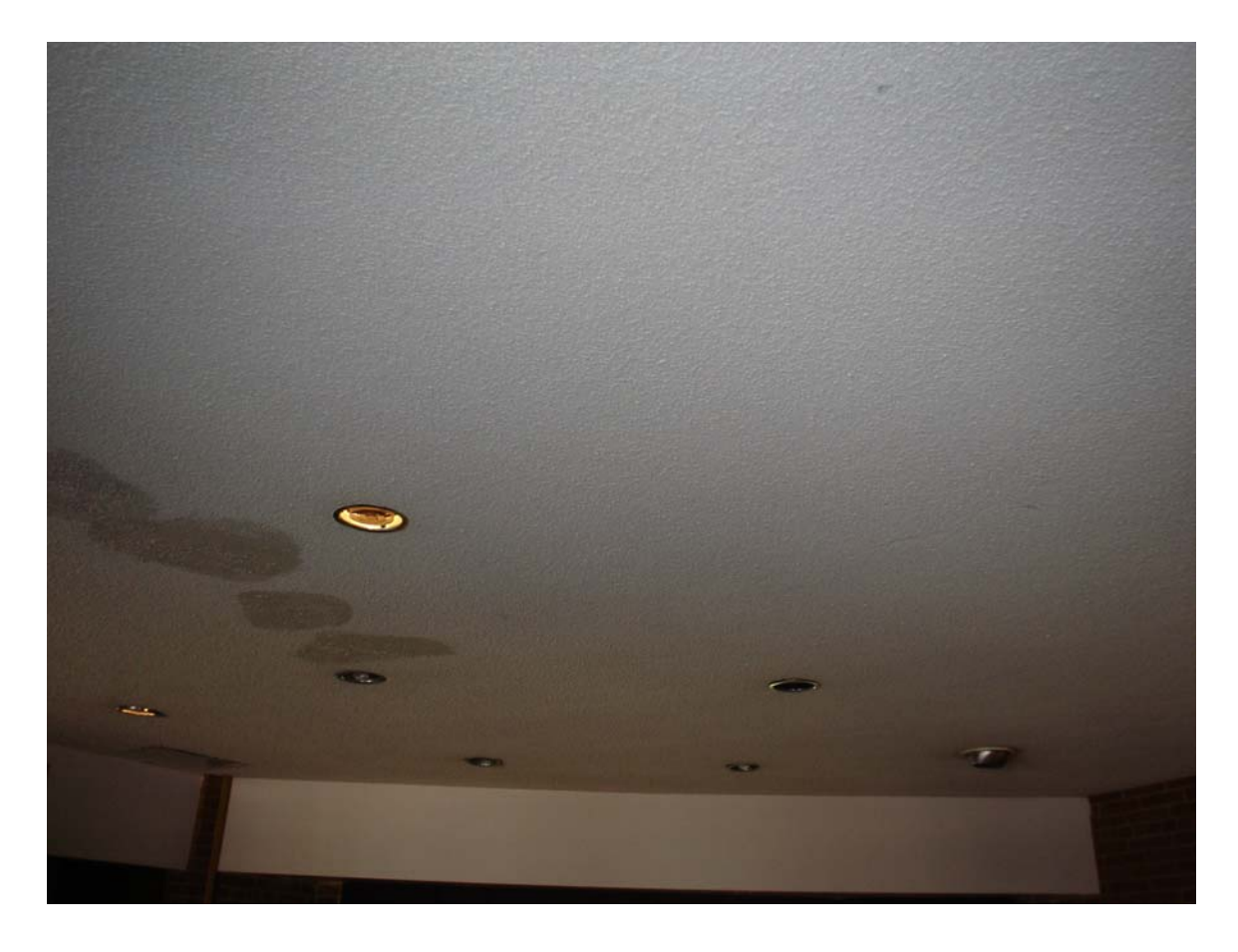
Photo 1 – Asbestos-containing spray-on acoustical ceiling plaster (popcorn)