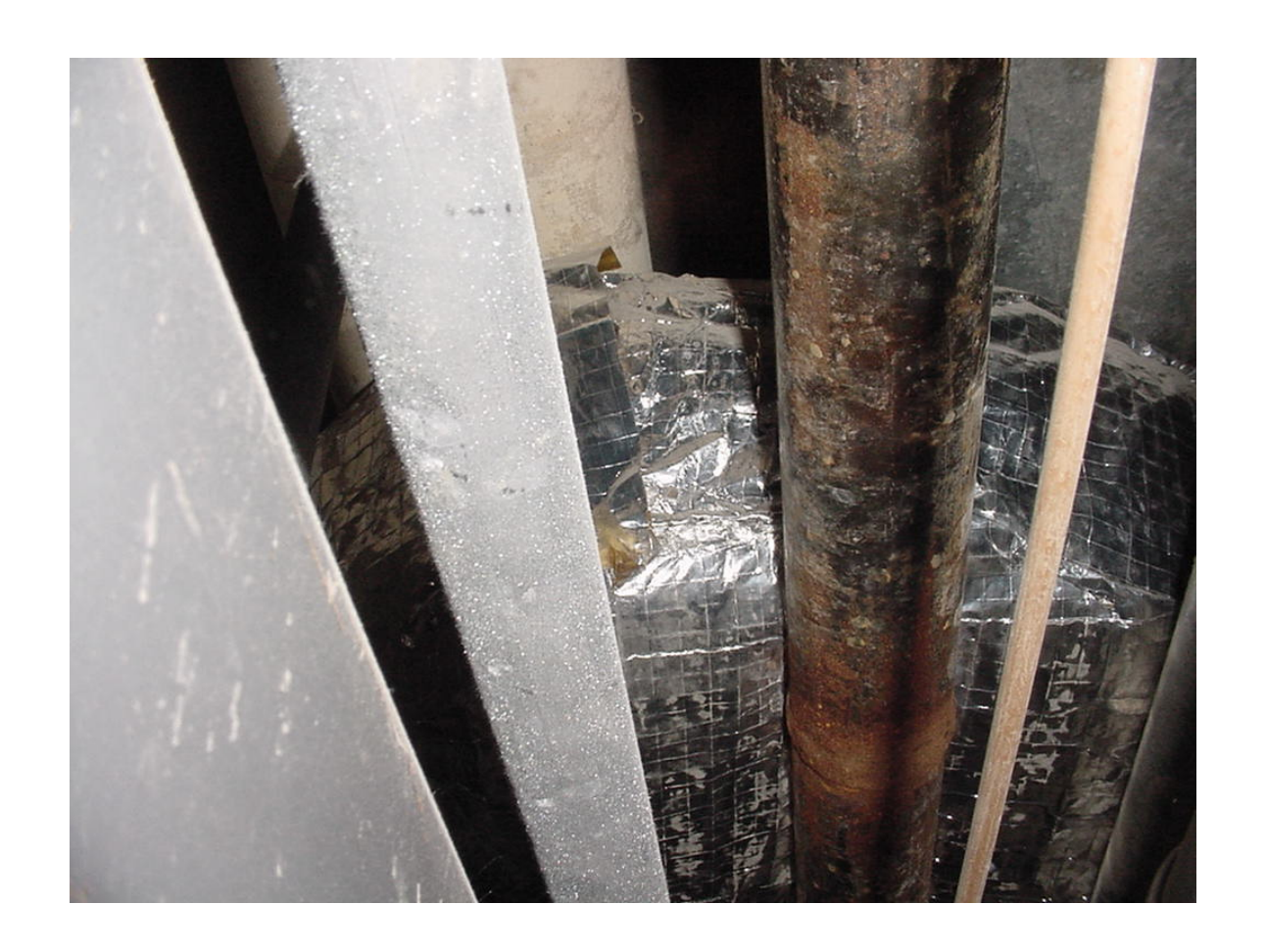
Basement pipe joint above duct