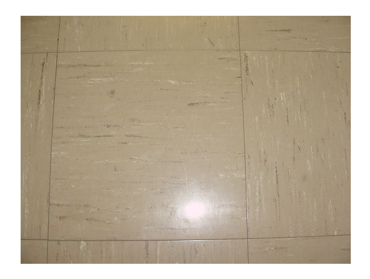
Room 223F – 12" x 12", brown floor tile