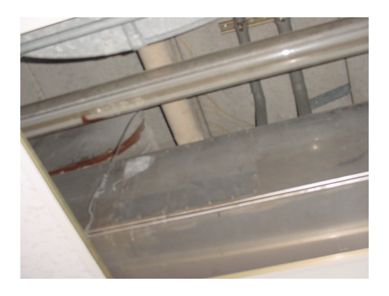
3<sup>rd</sup> floor, pipe joint insulation above ductwork