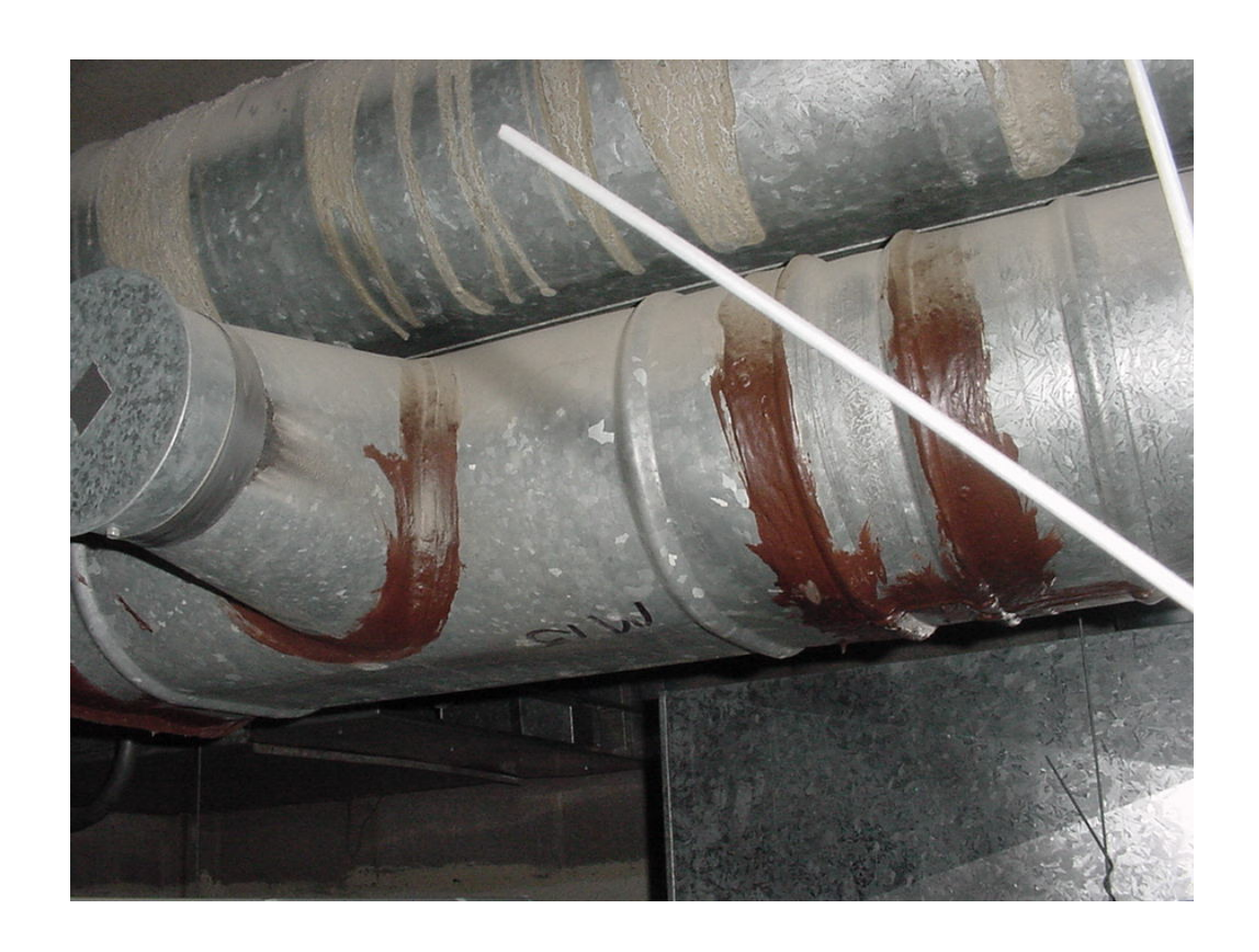
Room 101 – red/brown duct caulk