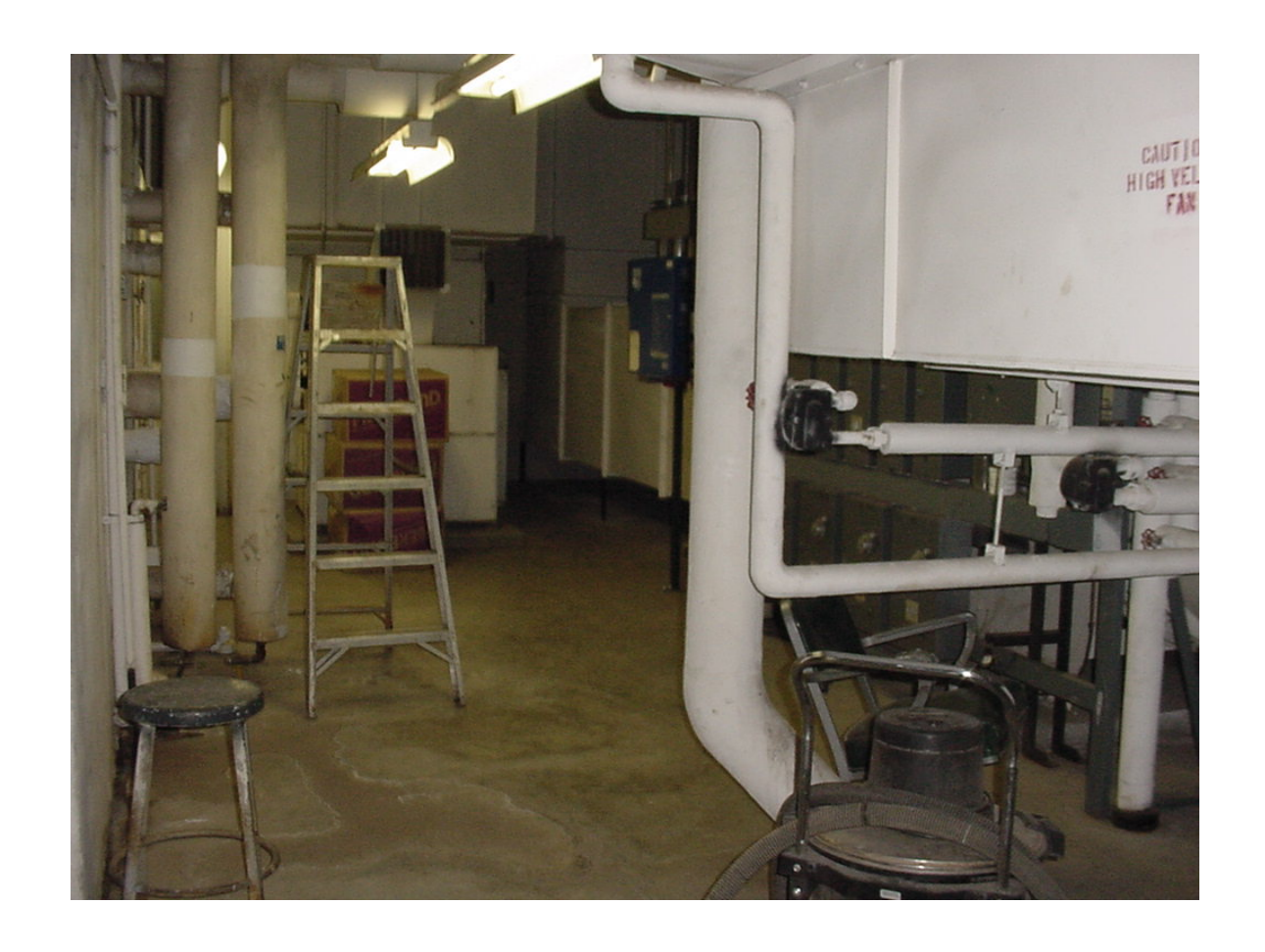
Mechanical Room 306 – thermal system insulation and duct wrap