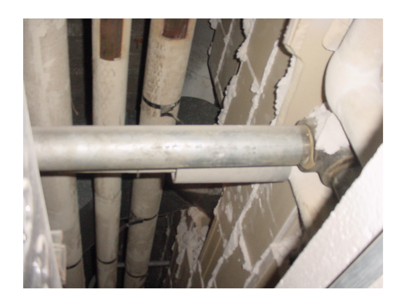
3<sup>rd</sup> Floor – Pipe joint in close proximity to ductwork