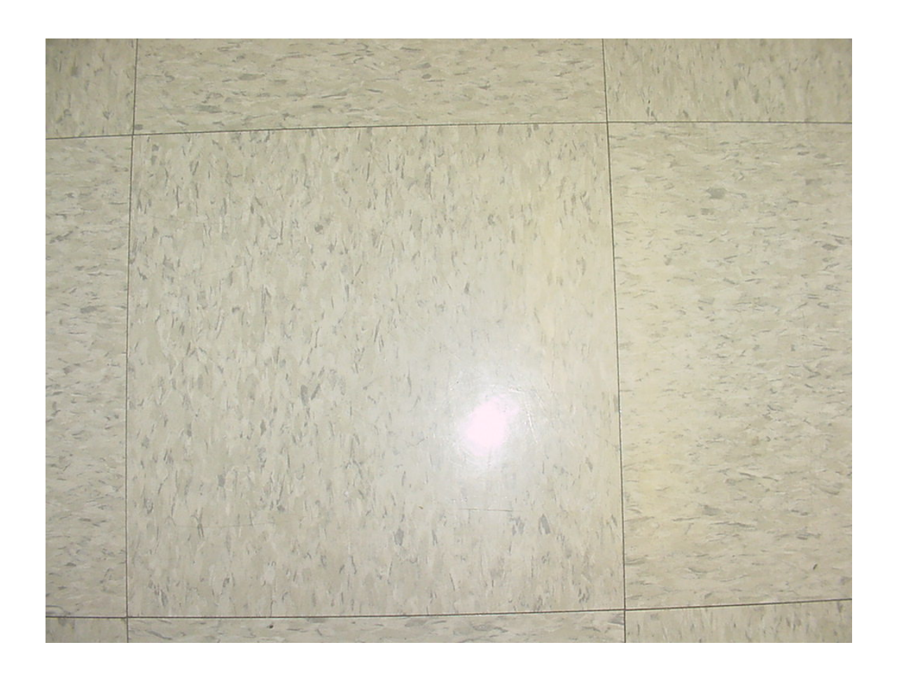
Room 223 - 12" x 12", white floor tile