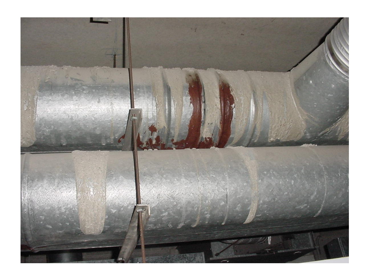
Room 101 - red/brown duct caulk