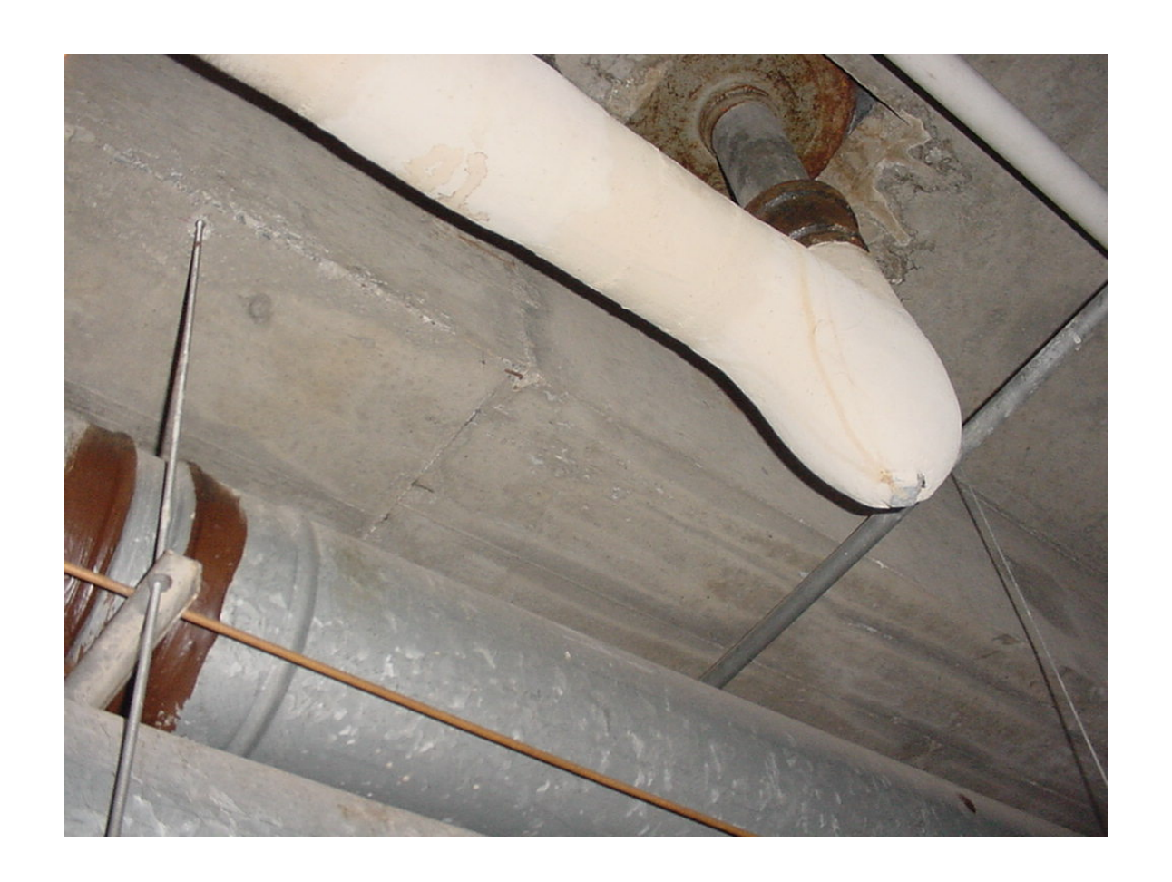
3<sup>rd</sup> floor, Room 310