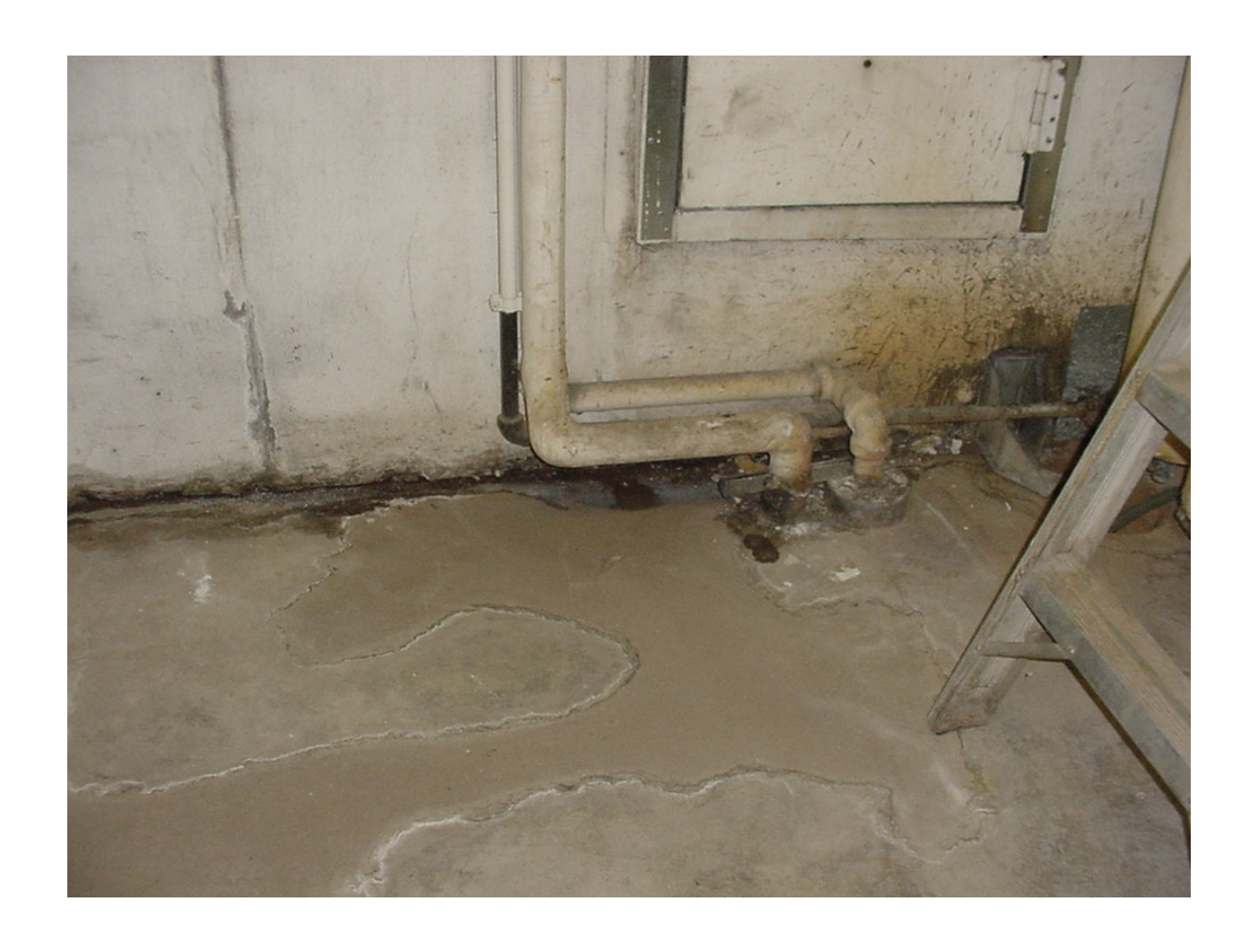
Mechanical\ Room\ 306-thermal\ system\ insulation