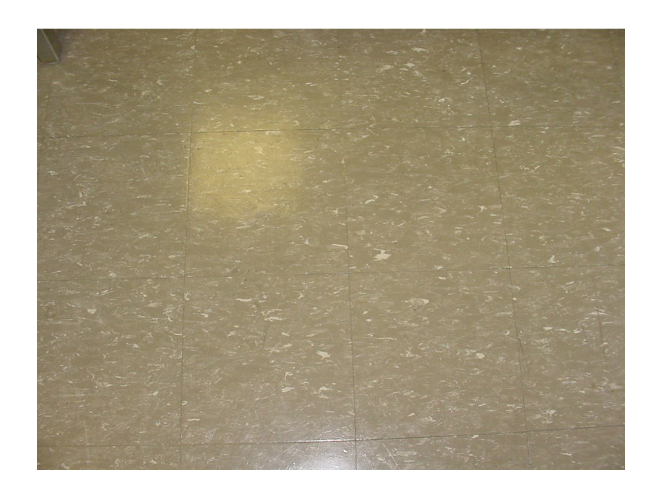
Room 125 – 9" x 9", light brown floor tile