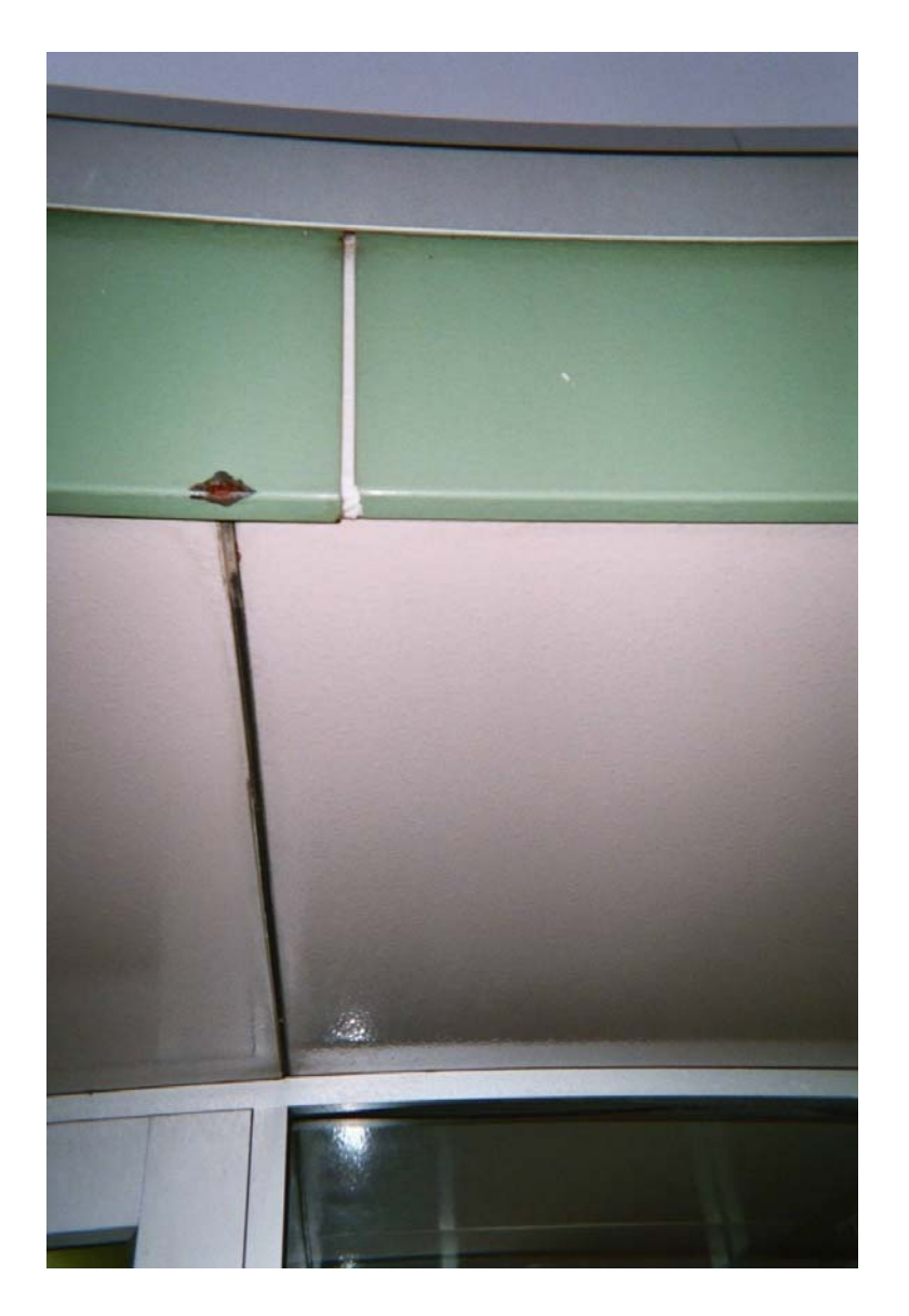
Photo 5 – Assumed asbestos-containing white and black exterior building caulk compound