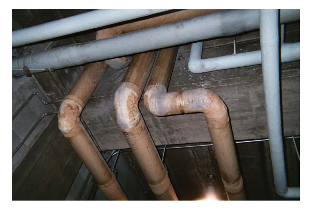
Photo 20 - Asbestos-containing domestic water pipe joint insulation