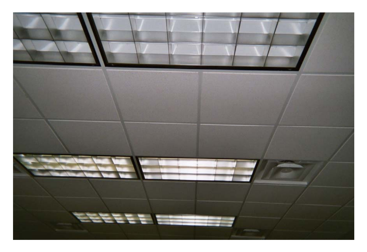
Photo 14 – Non asbestos-containing 2' x 2' white drop-in ceiling tile with pin holes and fissures