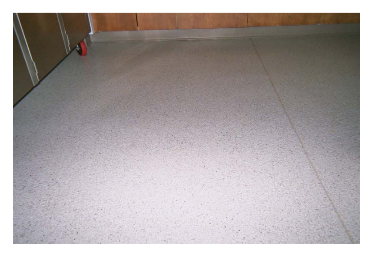
Photo 8 – Non asbestos-containing cream and vinyl flooring with tan specks and associated mastic