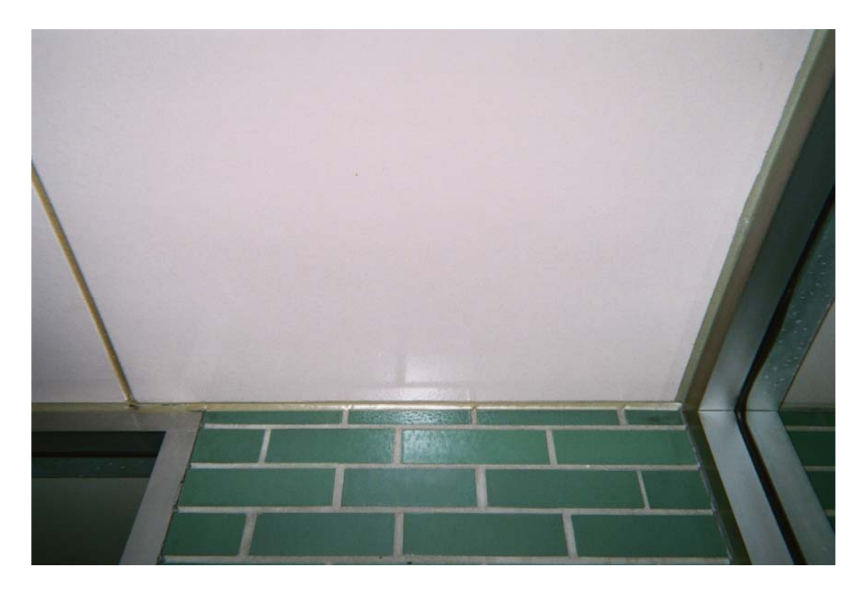
Photo 7 – Assumed asbestos-containing green building caulk compound