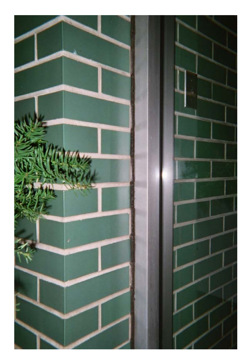
Photo 6 - Assumed asbestos-containing black building caulk compound