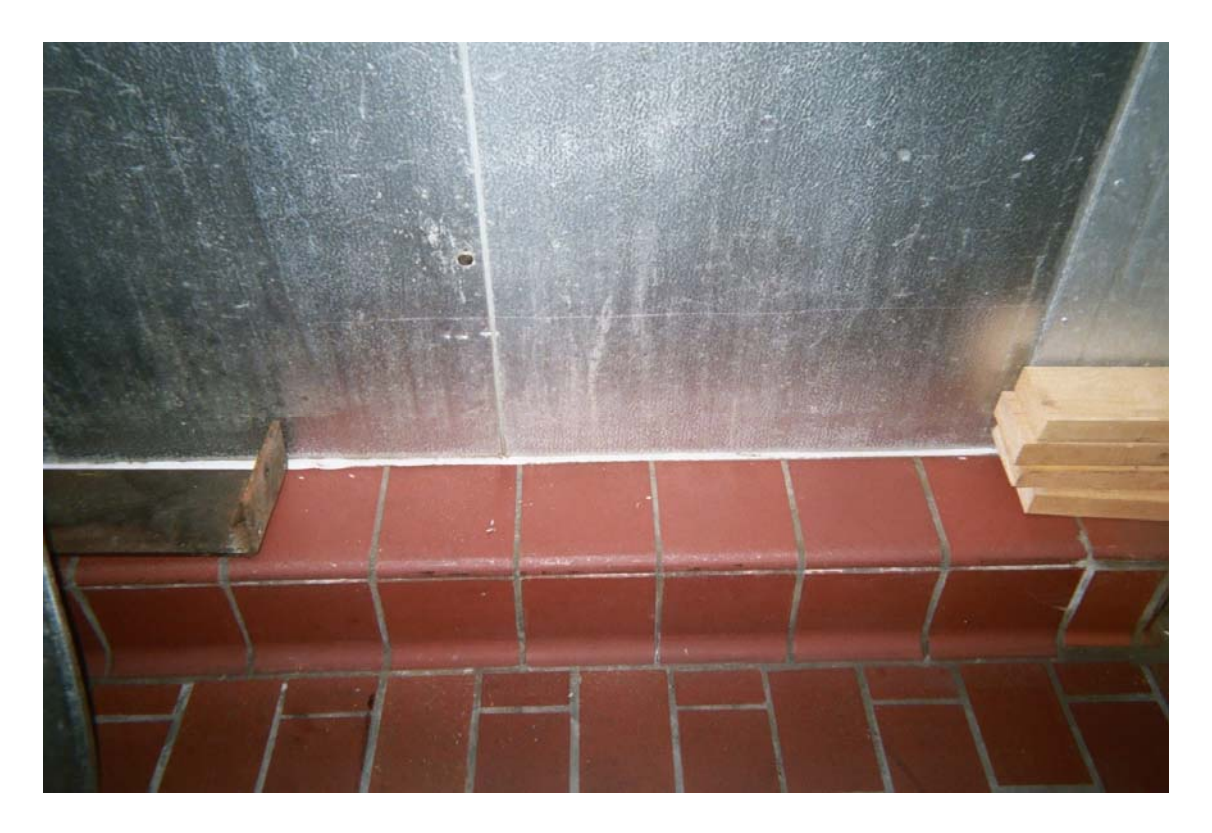
Photo 17 – Non asbestos-containing white refrigeration caulk compound