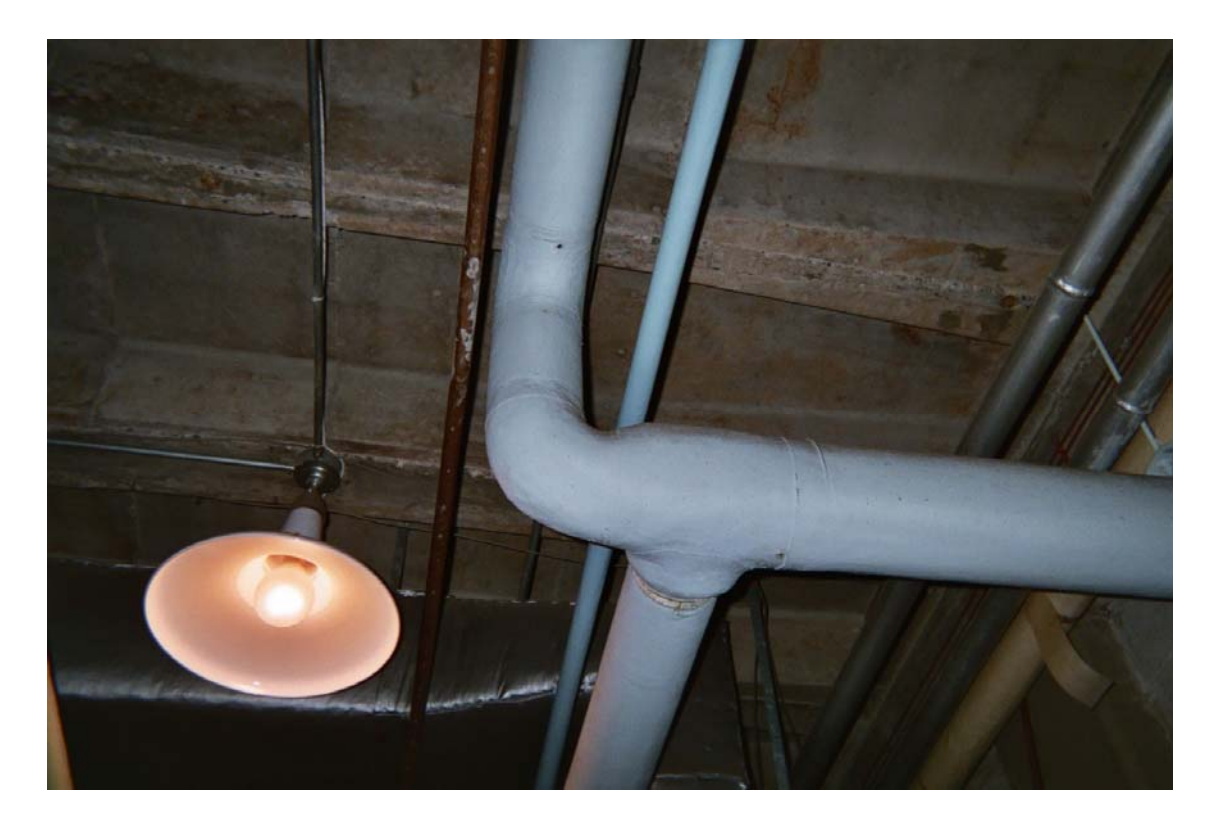
Photo 22 - Asbestos-containing domestic water pipe joint insulation