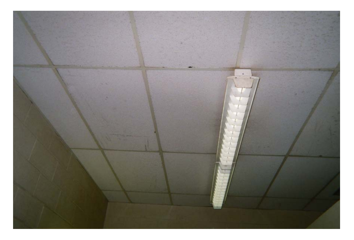
Photo 11 – Non asbestos-containing 2' x 4' white lay-in ceiling tile with pin holes and fissures