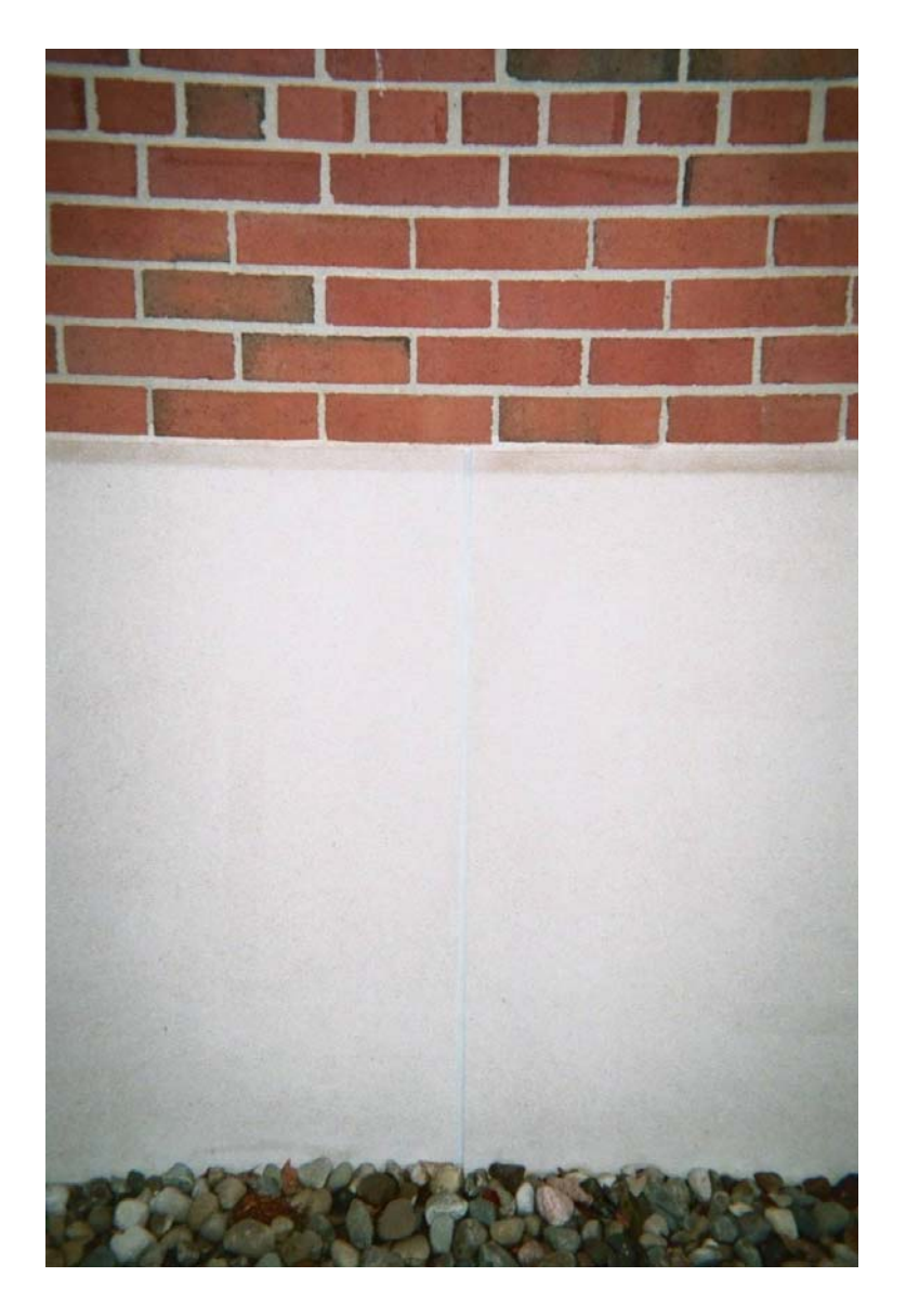
Photo 3 – Assumed asbestos-containing gray building caulk compound