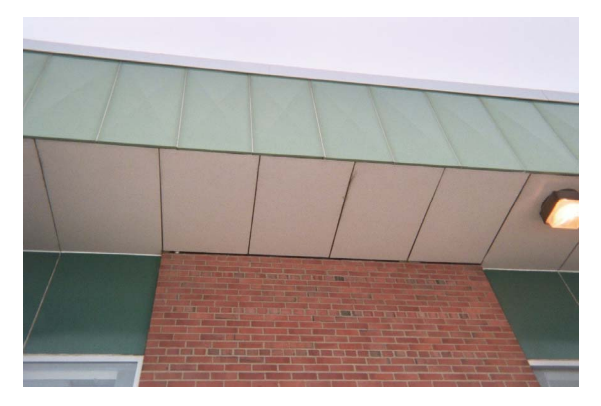
Photo 4 – Assumed asbestos-containing black building caulk compound