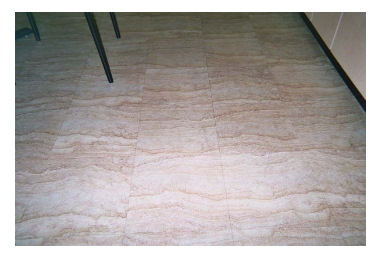
Photo 10 – Non asbestos-containing 12" x 12" cream floor tile with rust streaks and associated mastic