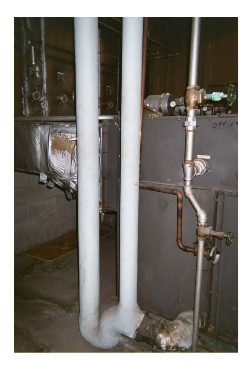
Photo 21 - Non asbestos-containing domestic water pipe straight insulation