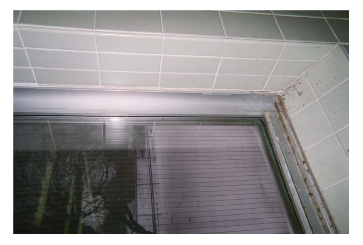
Photo 18 – Non asbestos-containing white interior window frame caulk compound