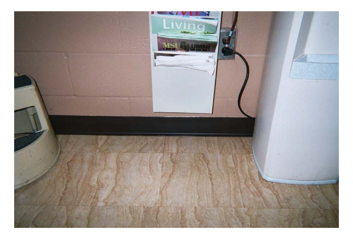
Photo 9 – Non asbestos-containing 4" black cove molding and associated mastic