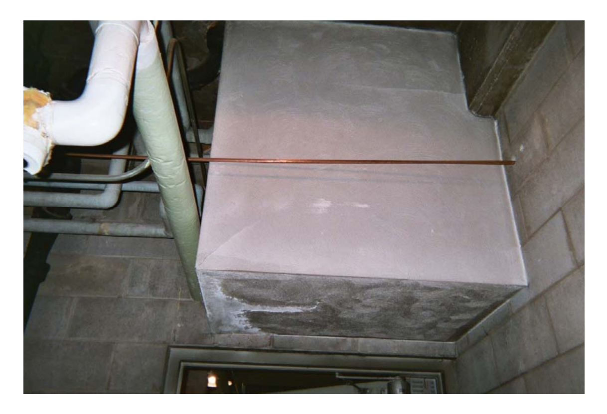
Photo 19 – Non asbestos-containing plaster over ventilation ductwork