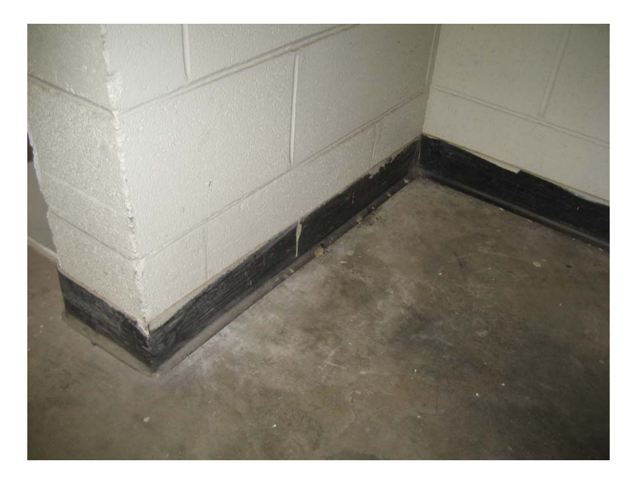
HA #3 – Non asbestos containing 4" black cove molding and associated mastic