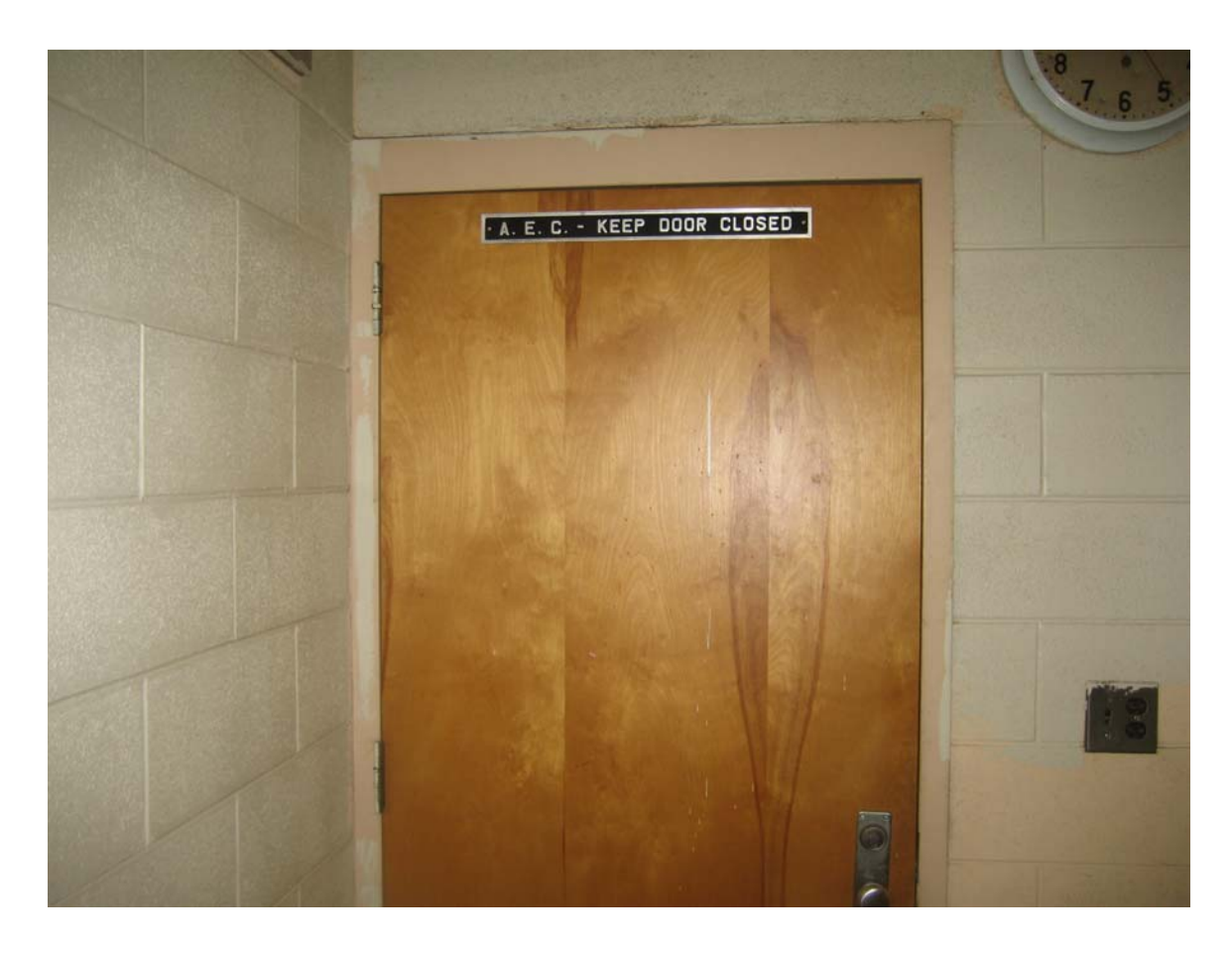
HA #9 – Assumed asbestos containing fire door and frame