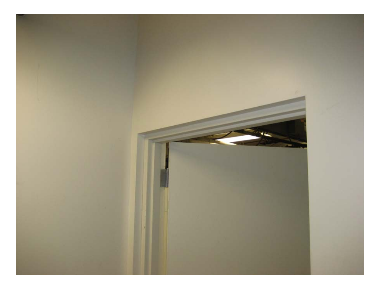
HA #12/13 – Newly installed drywall with drywall joint compound