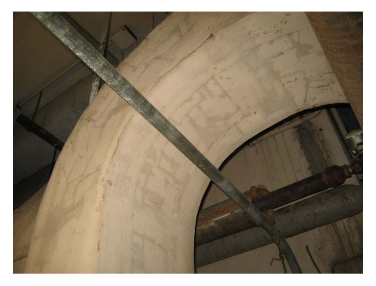
HA #19 – Non-asbestos containing Light brown paper duct wrap