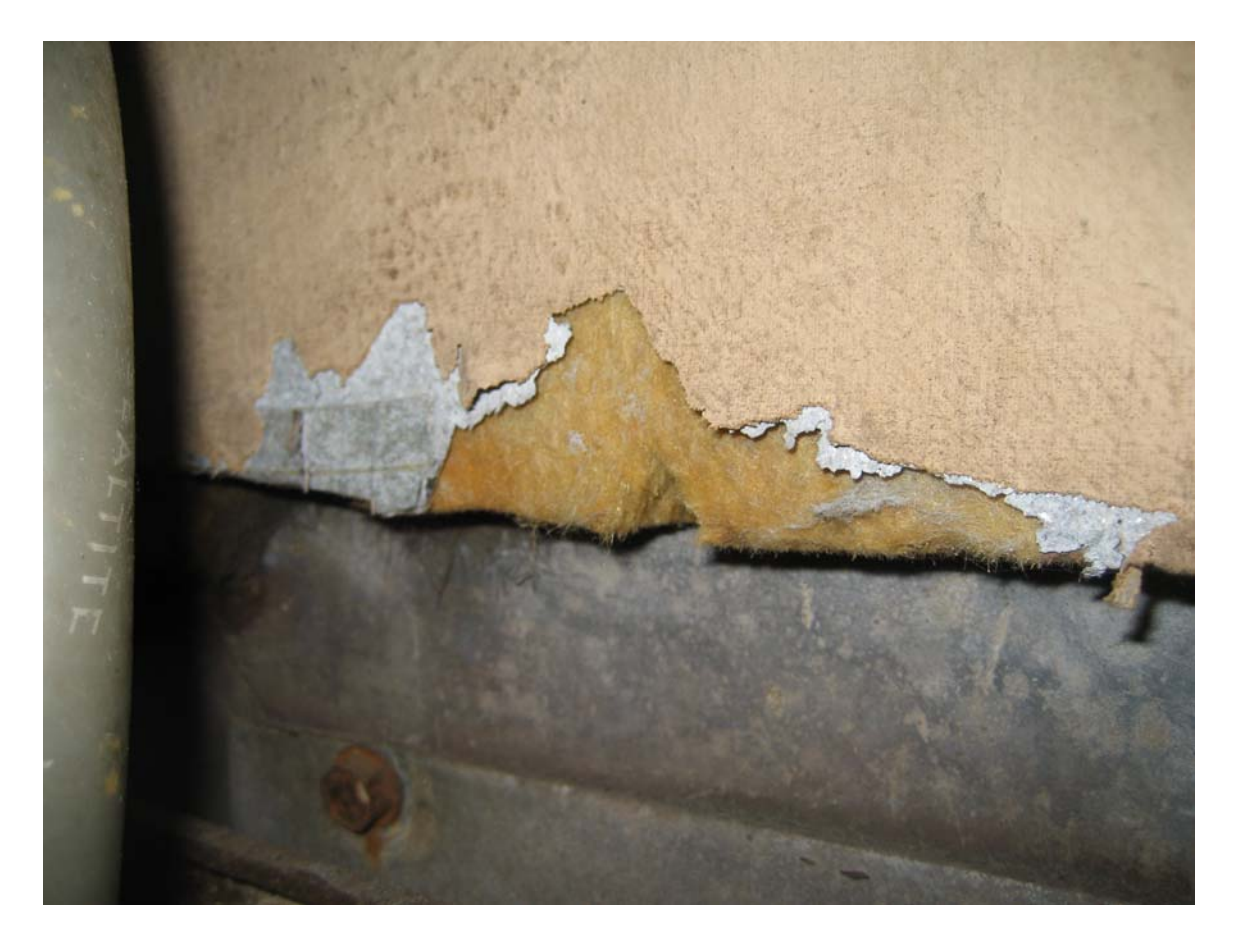
{ m HA~\#18-Non-asbestos} containing light brown canvas duct wrap on fiberglass