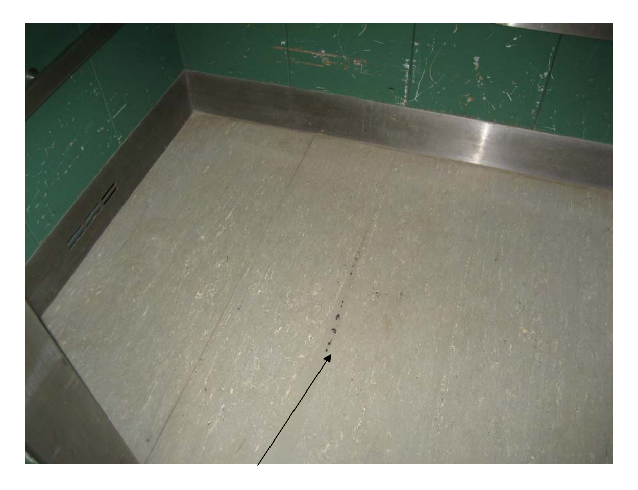
HA #15 – Assumed asbestos containing gray seamless floor covering