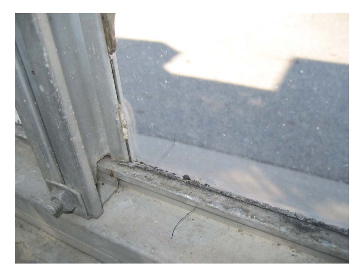
HA #8 – Asbestos containing glass wall panel glazing