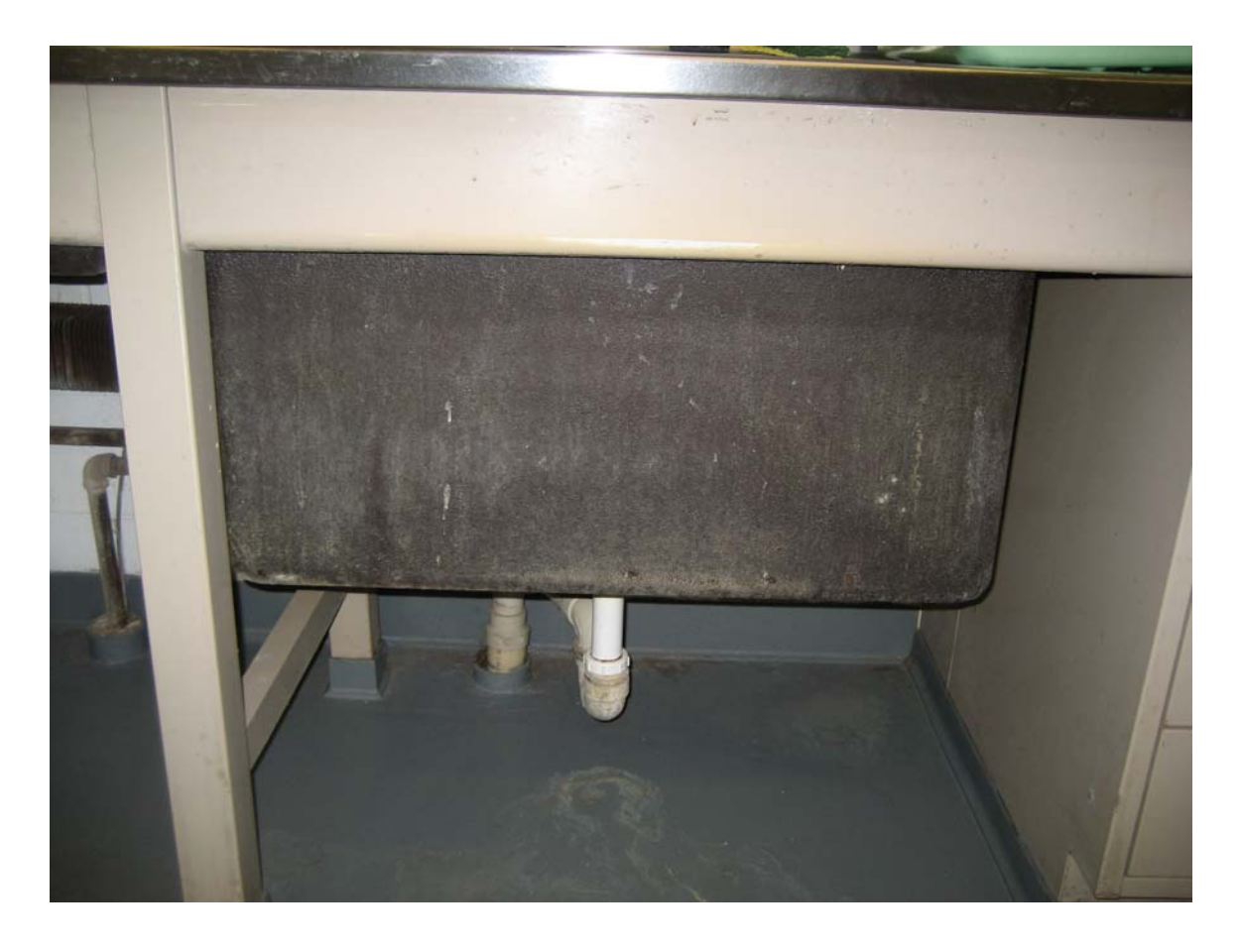
HA #21 – Asbestos containing black sink undercoating