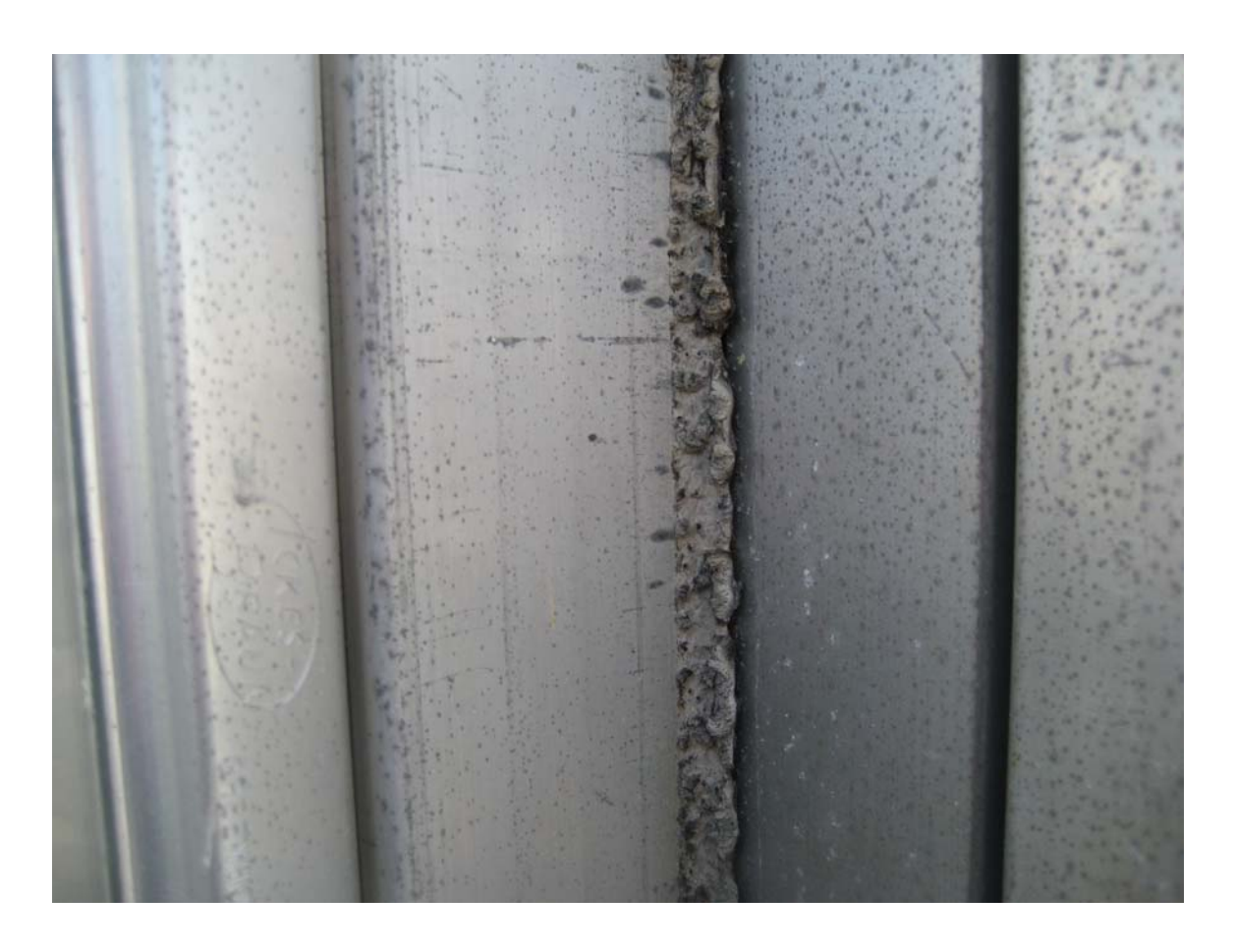
HA #7 – Asbestos containing gray exterior door caulk