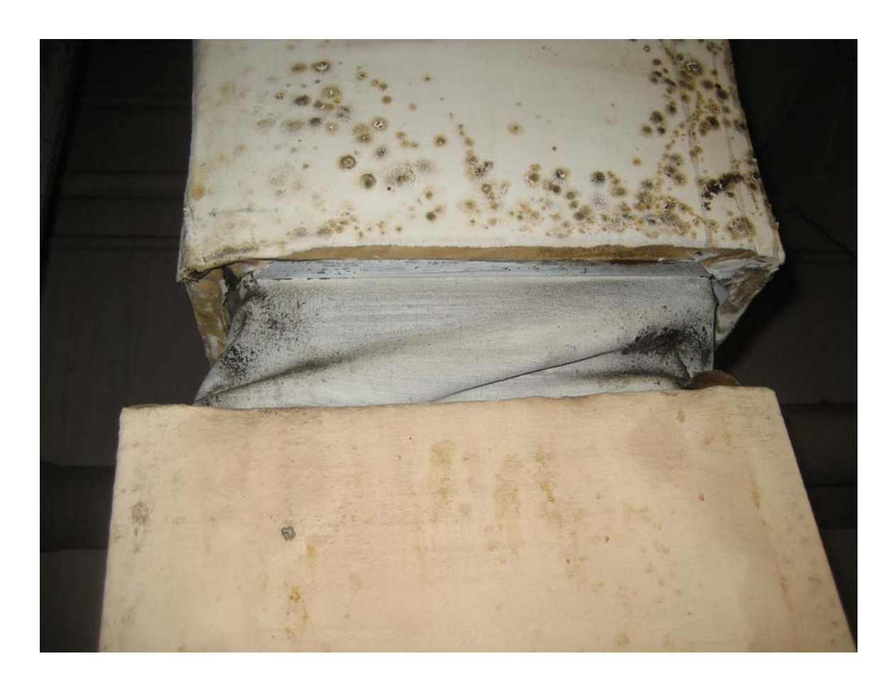
HA #16 – Assumed asbestos containing gray vibration collar