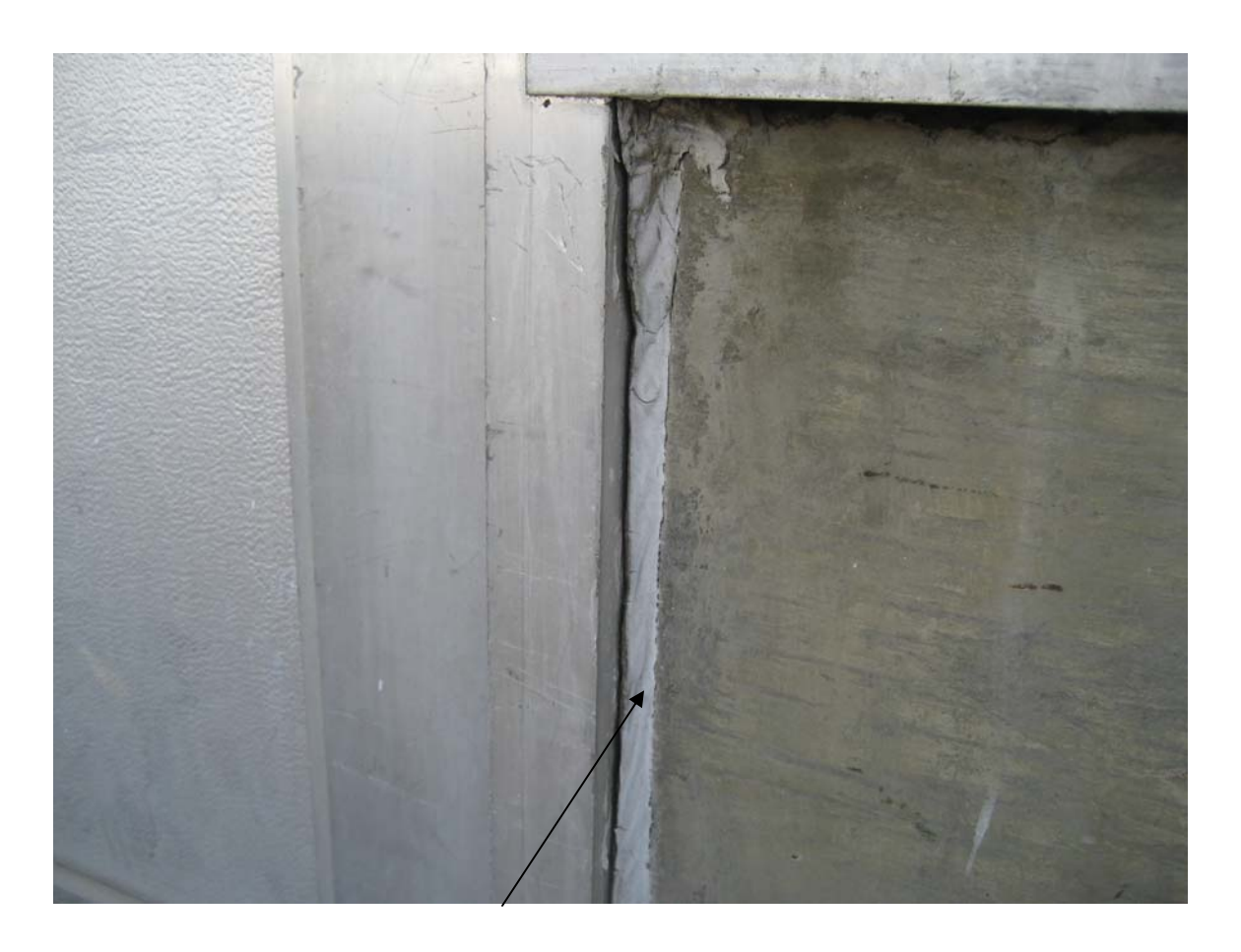
HA #6 – Asbestos containing gray caulk