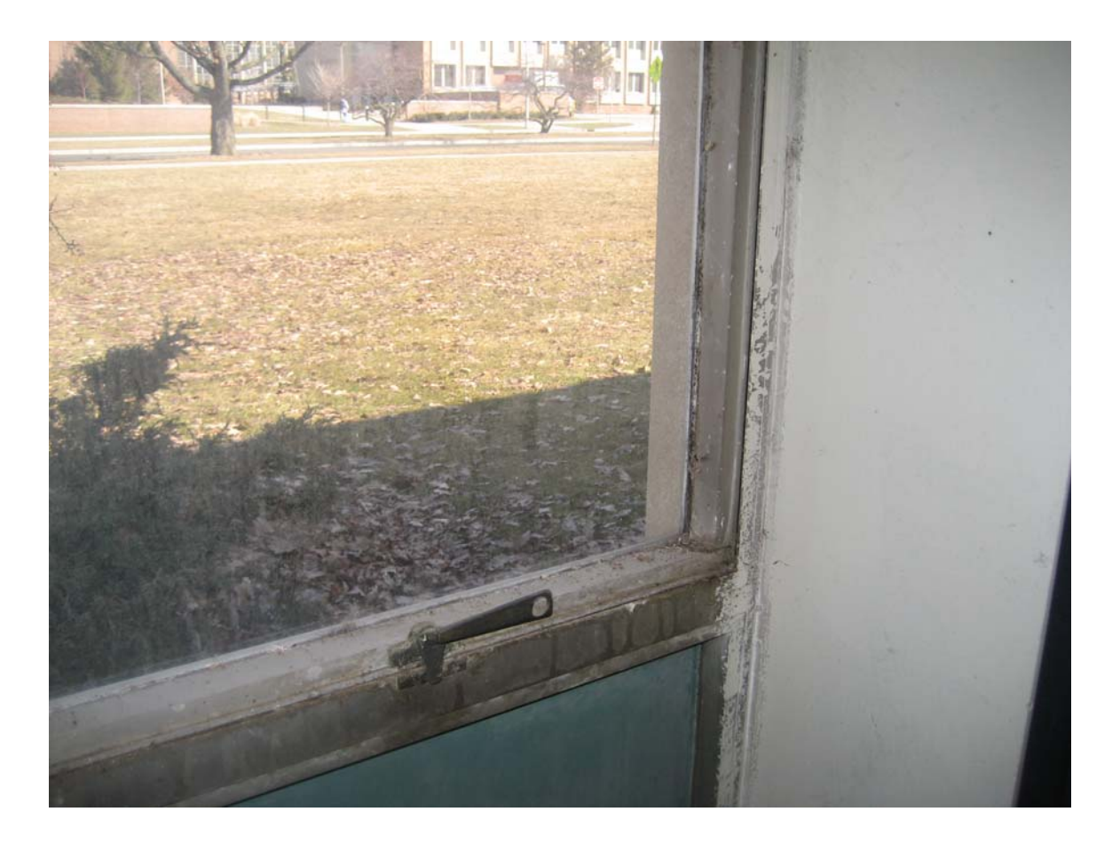
HA #11 – Asbestos containing window glazing, brick building windows