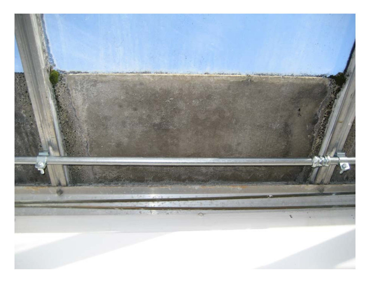
HA #2 – Assumed asbestos containing transite panels