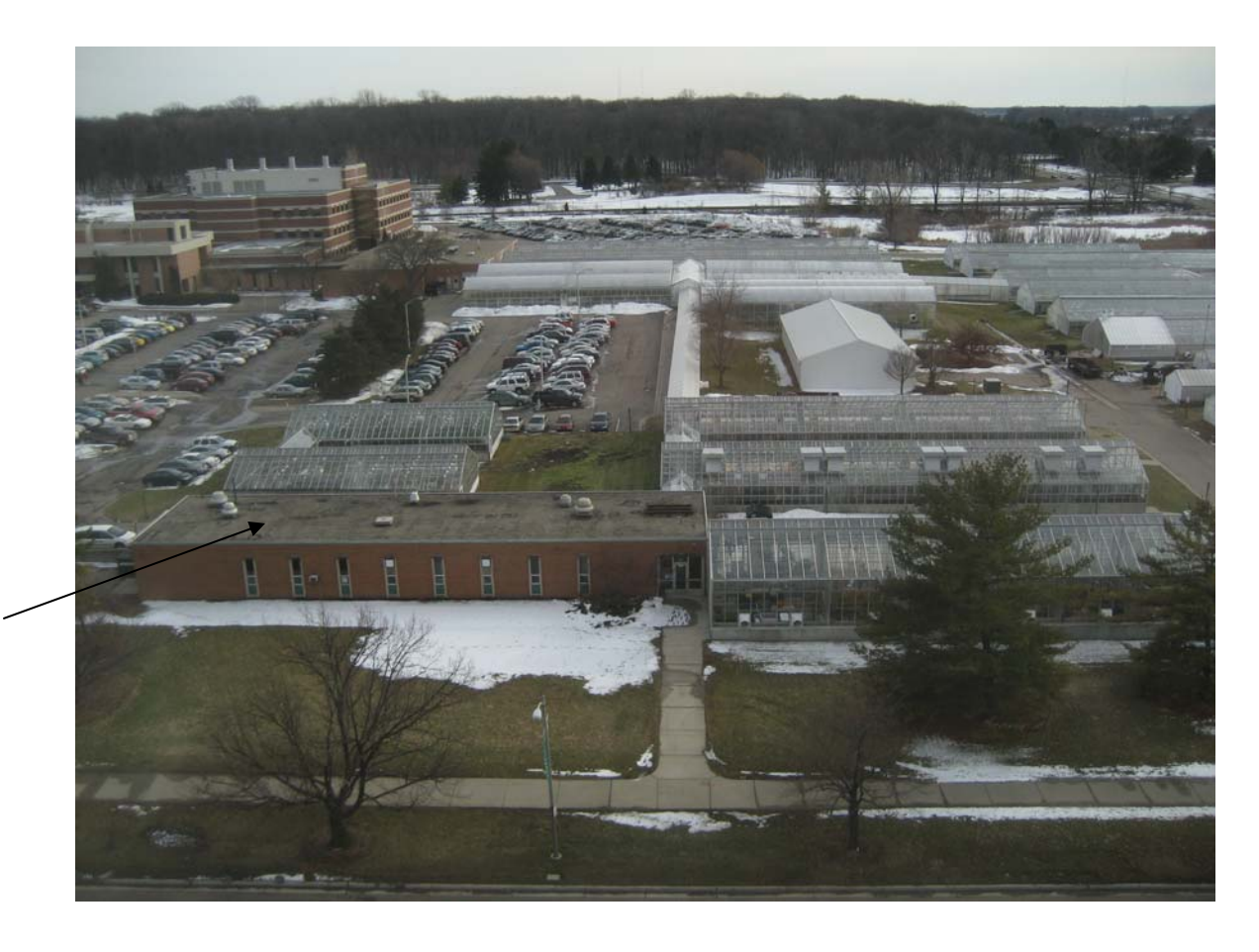
HA #5 – Assumed asbestos containing roofing materials and products