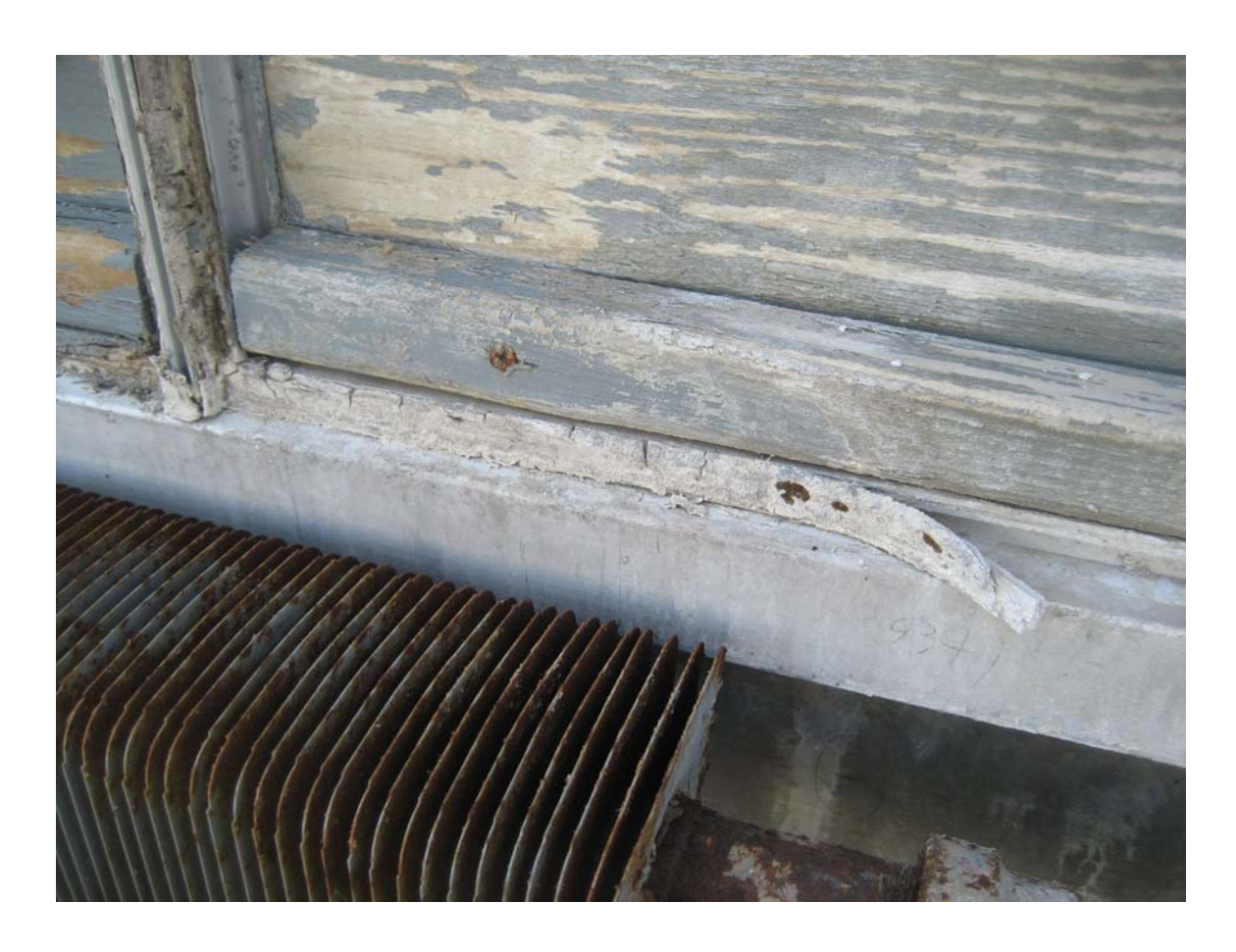
HA #4 – Asbestos containing white window glazing