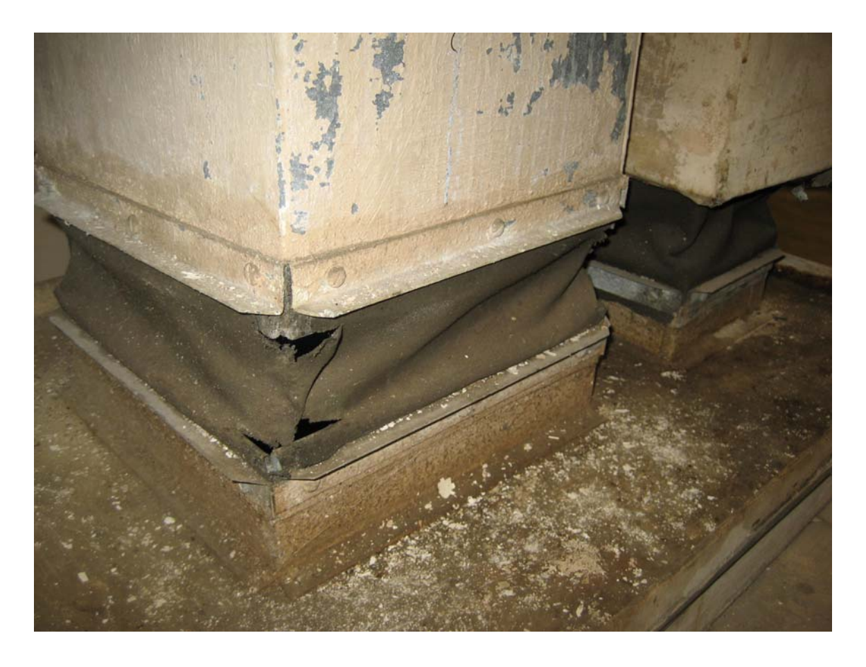
HA #17 – Non-asbestos containing dark brown vibration collar