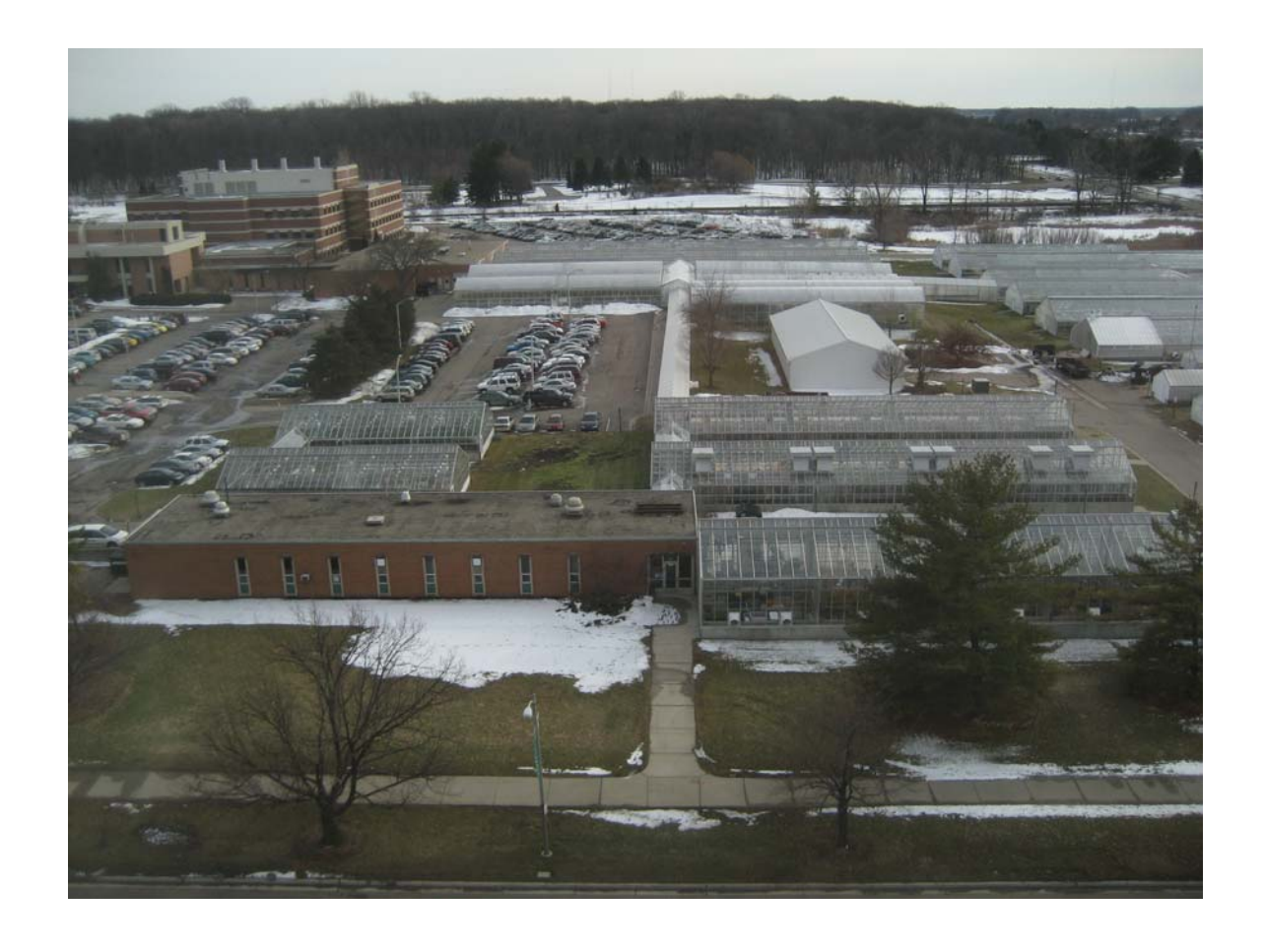
Plant Sciences Greenhouse – East Range (#98)