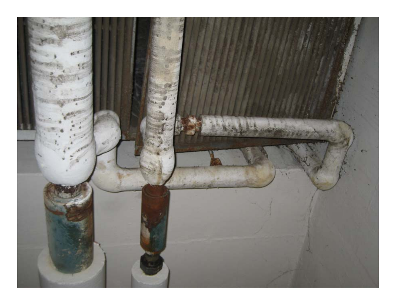
HA\ \#1-Assumed asbestos containing mud fitting and hanger insulation