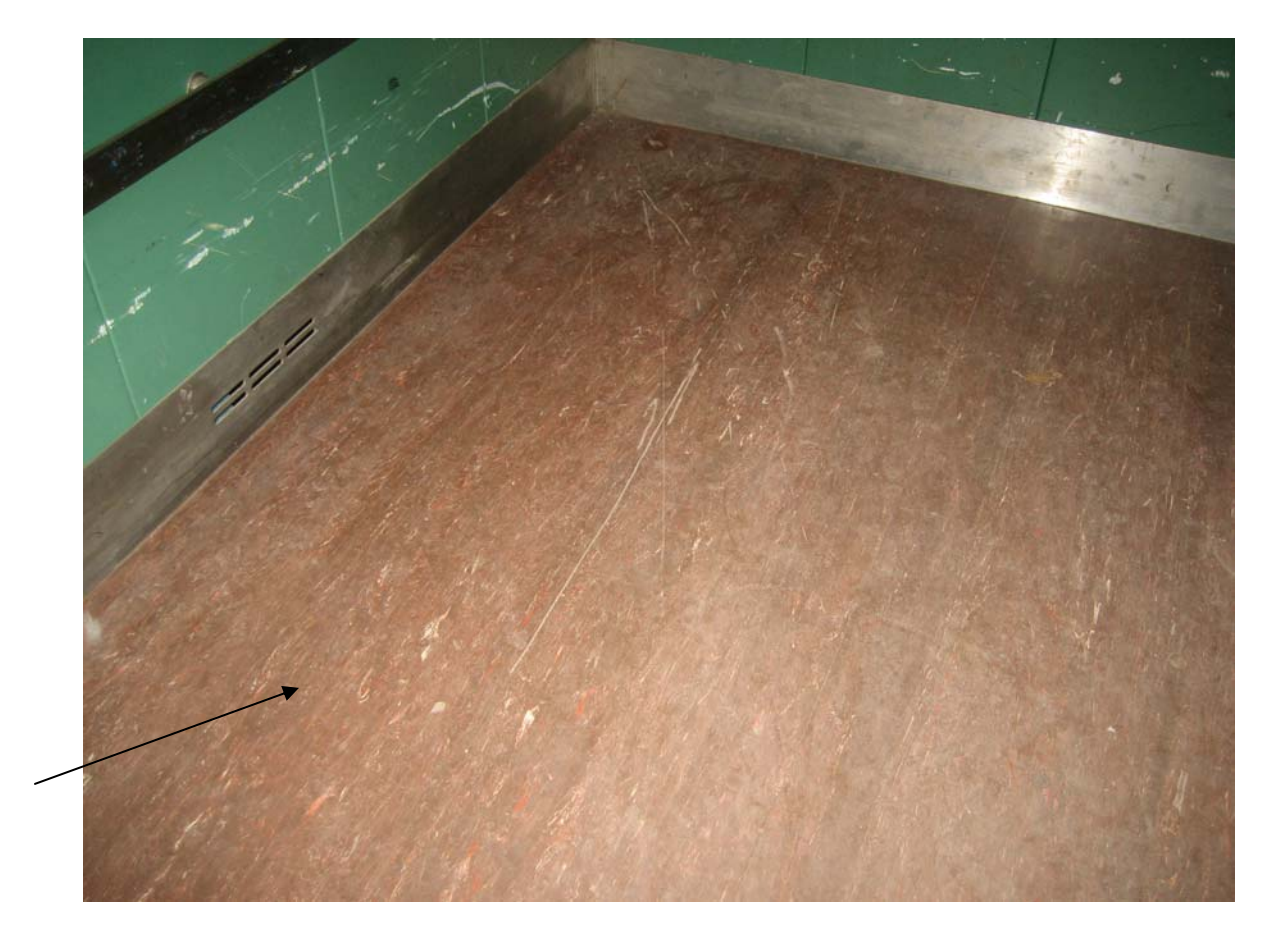
HA #14 – Assumed asbestos containing brown seamless floorcovering