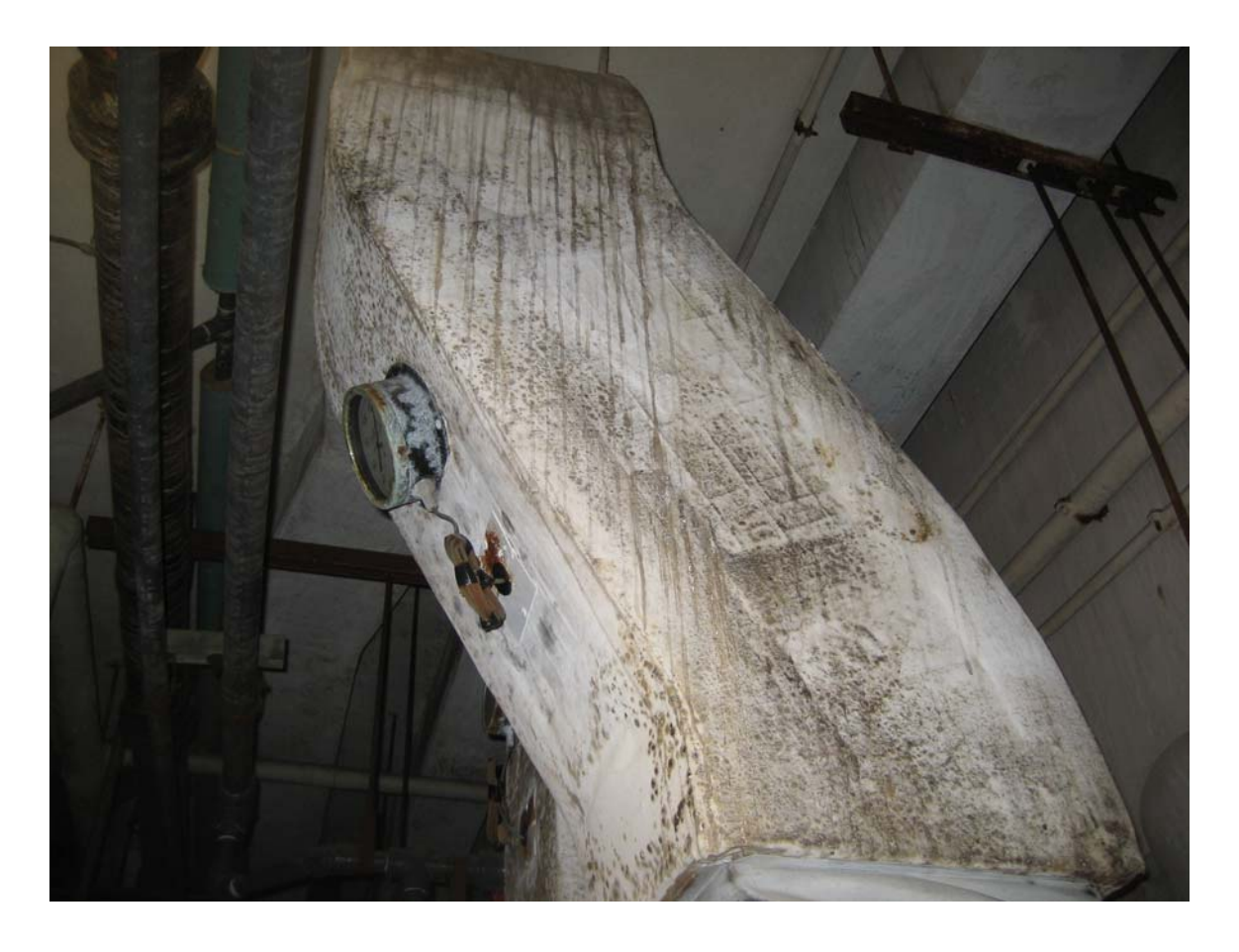
HA #20 - Non asbestos containing white moldy duct wrap