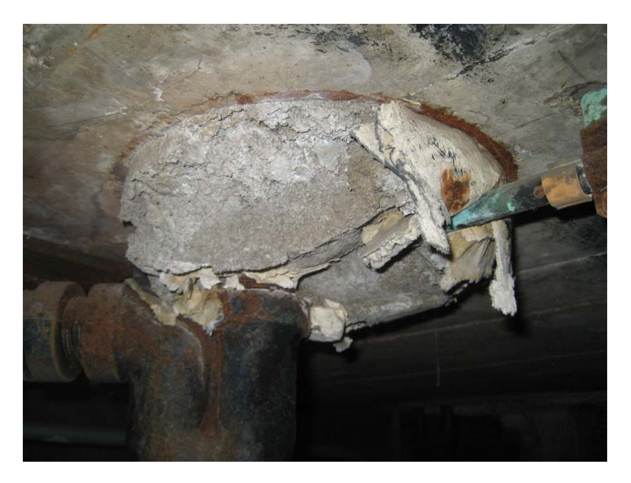
HA #6 – Non-asbestos containing corrugated material