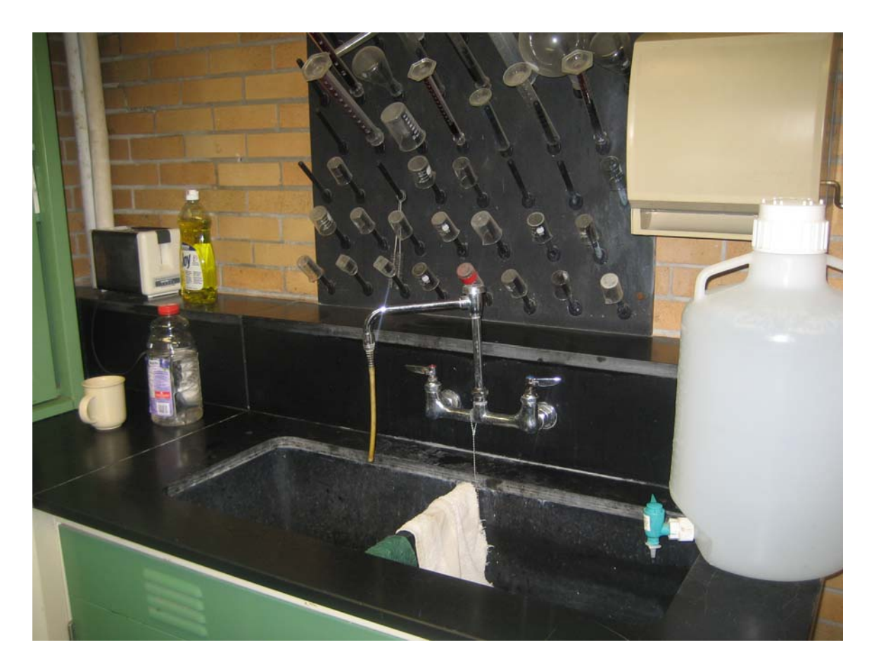
HA #1 – Assumed asbestos containing lab bench, sink, and drying rack