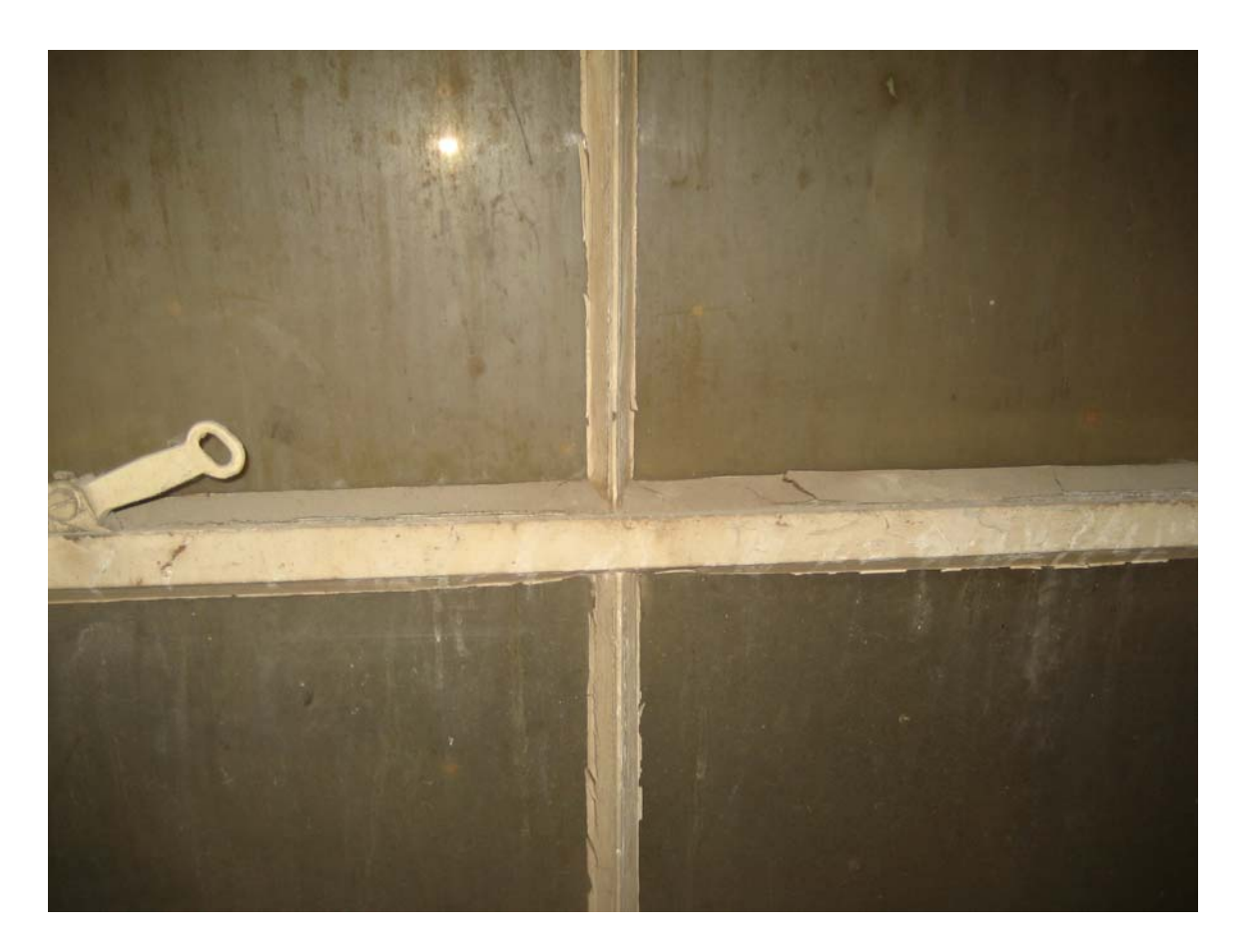
HA #4 – Asbestos containing brown window glazing