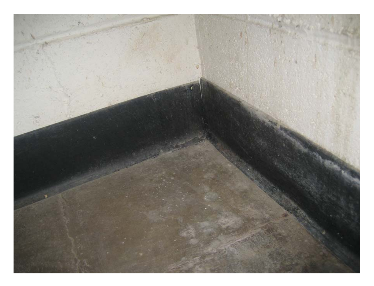
HA #2 – Non asbestos containing 4" black cove molding and associated mastic