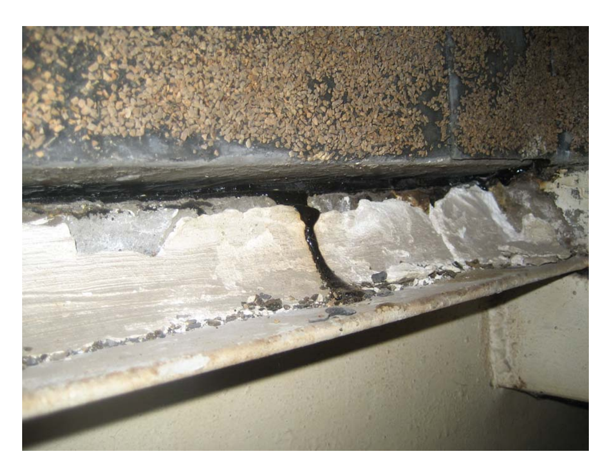
HA #8 – Non-asbestos containing white decking patch