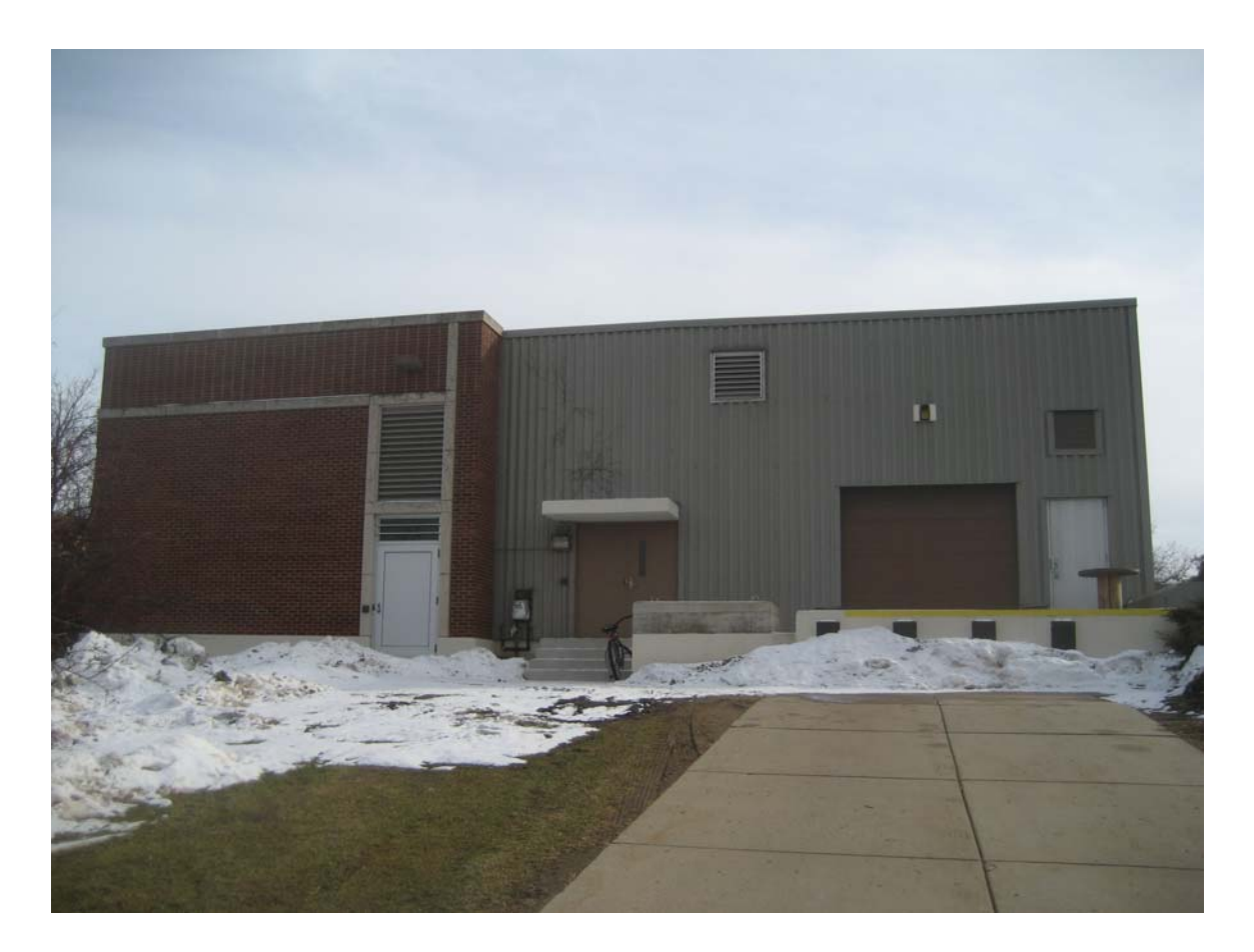
MSU Water Reservoir (#96)