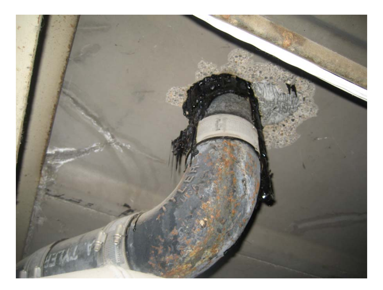
HA #5 – Asbestos containing black roof tar