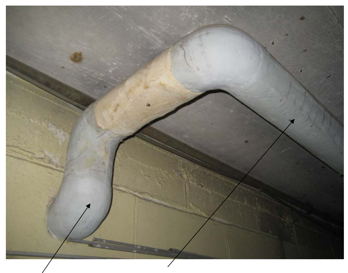
HA #2 – Assumed asbestos containing pipe straight insulation