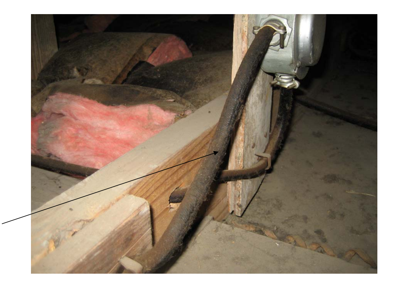
HA #5 – Assumed asbestos containing electrical wire covering