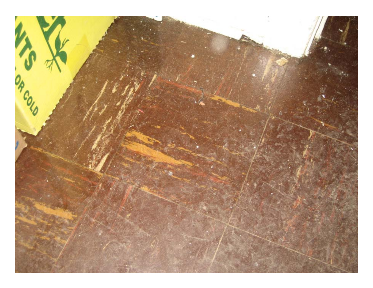
HA #9 – Asbestos containing 9"x 9" Brown floor tile with red and cream streaks