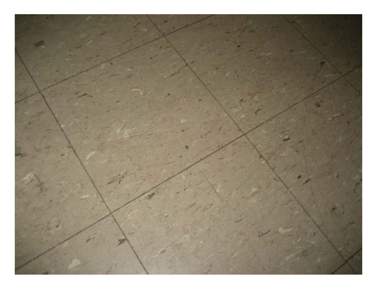
HA #1 – Asbestos containing 9"x 9" Gray floor tile with white and rust streaks and associated mastic