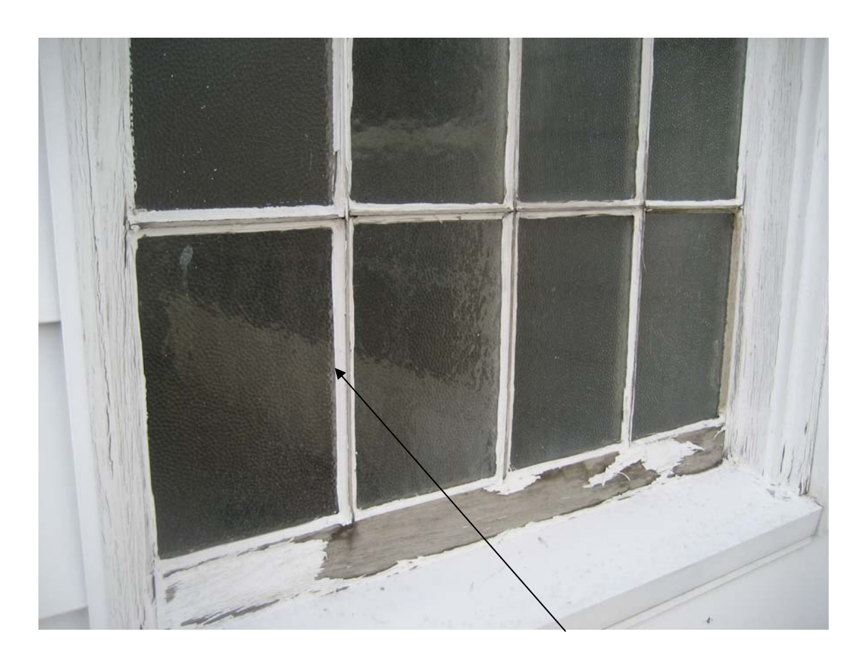
HA #25 – Non-asbestos containing white window glazing