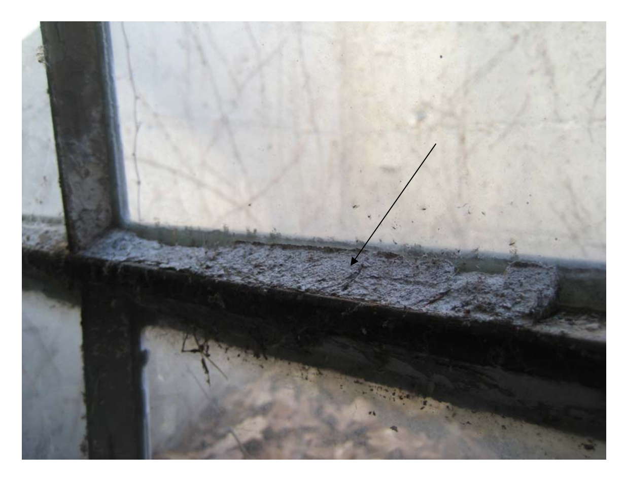
HA #10 – Asbestos containing window glazing on metal window