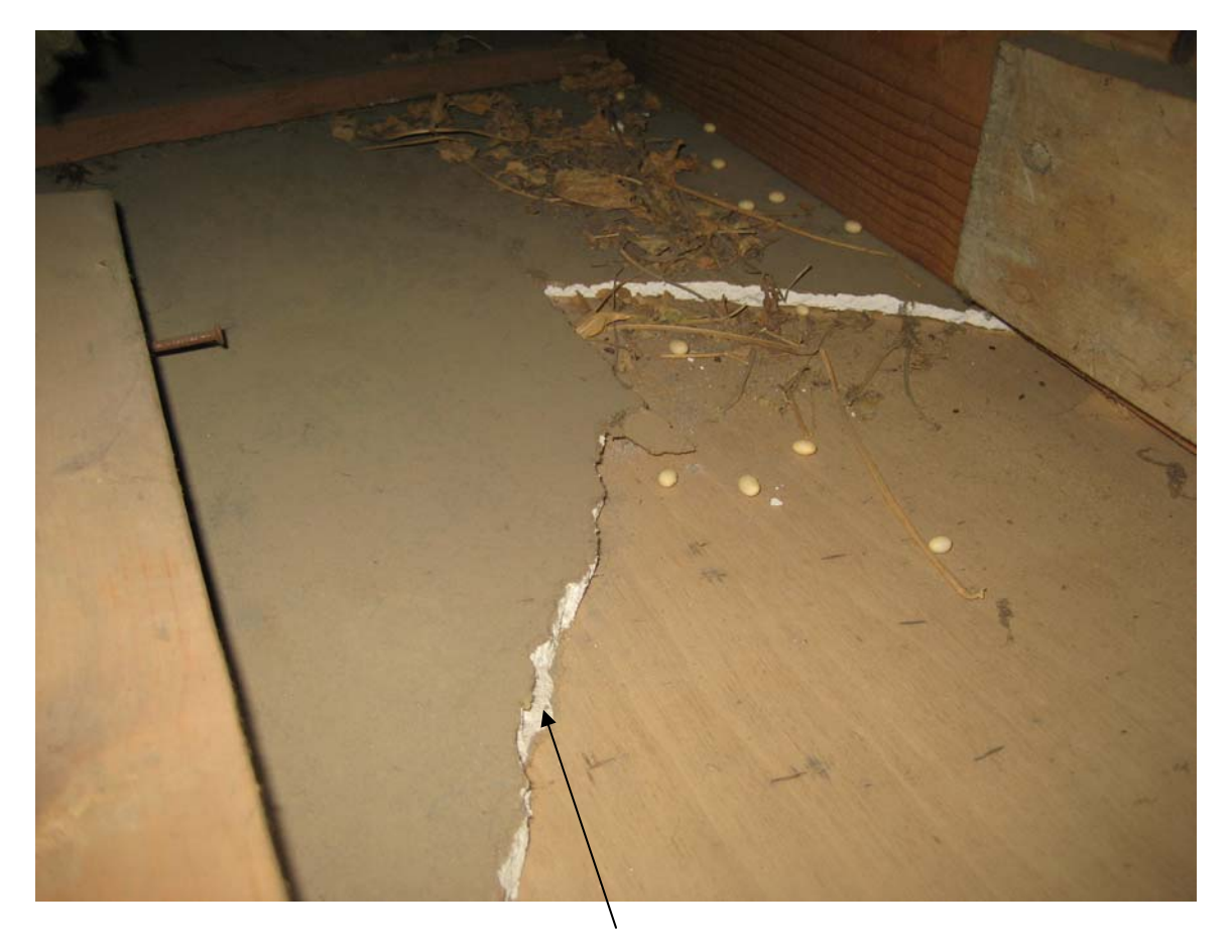
HA #4 – Non asbestos containing unfinished drywall