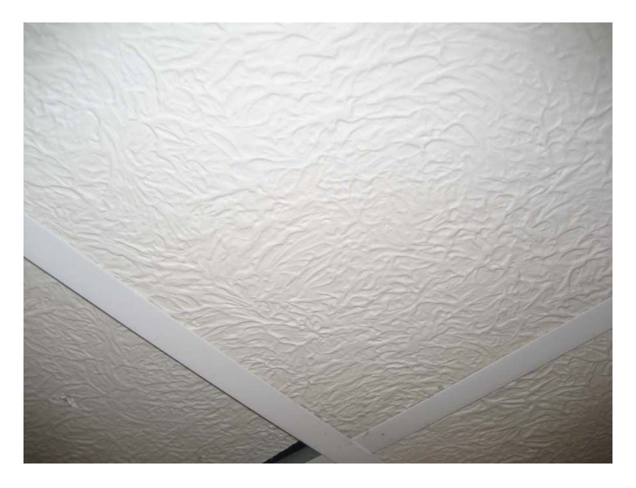
HA #17 – Non-asbestos containing 2'x 4' lay-in ceiling tile with smooth wave pattern