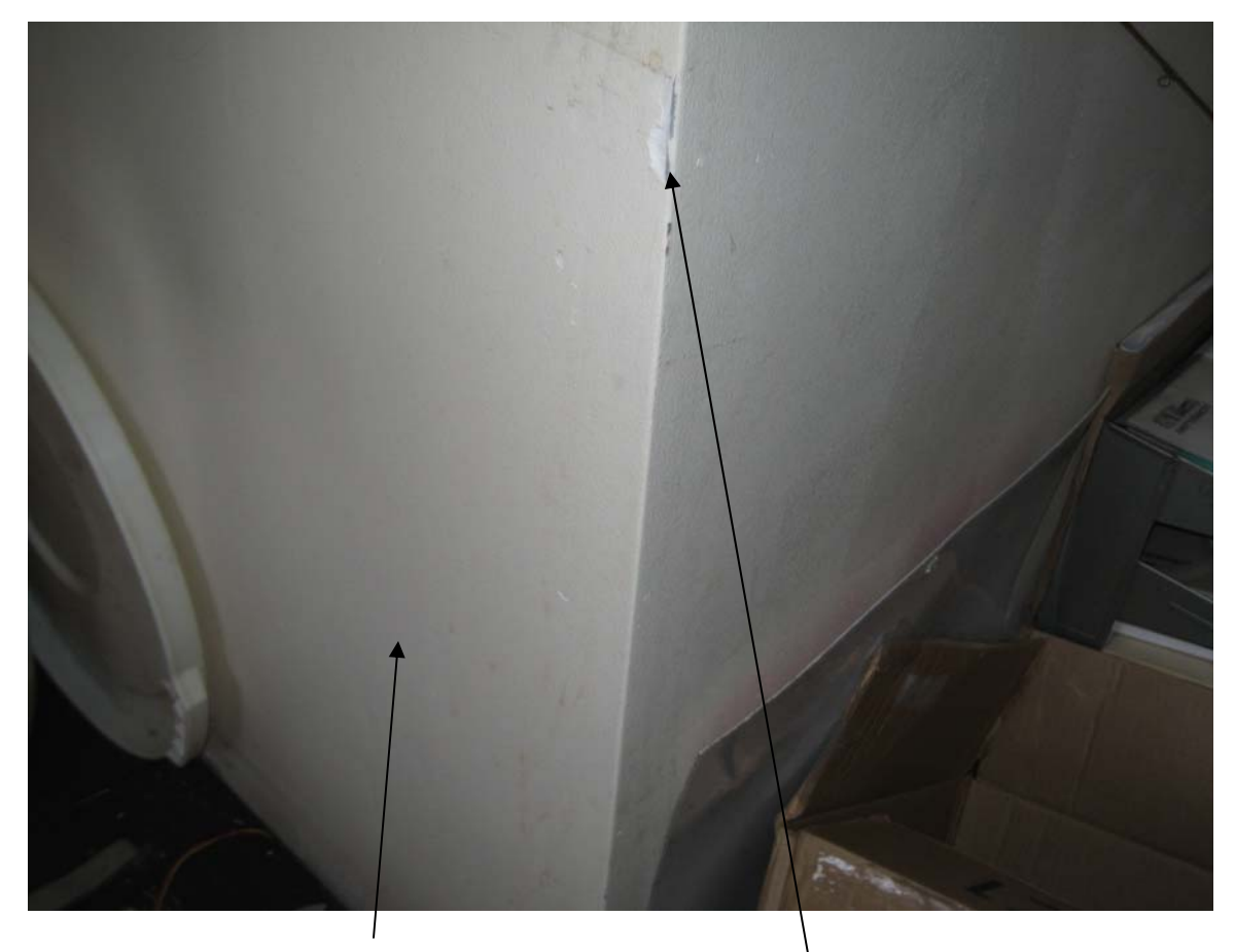
HA #21 – Non-asbestos containing drywall