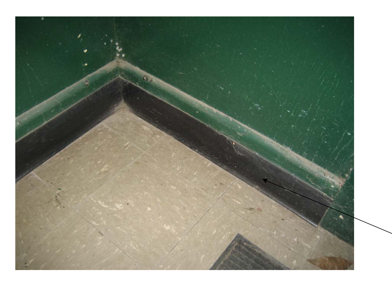
HA #14 – Asbestos containing black cove molding and associated mastic