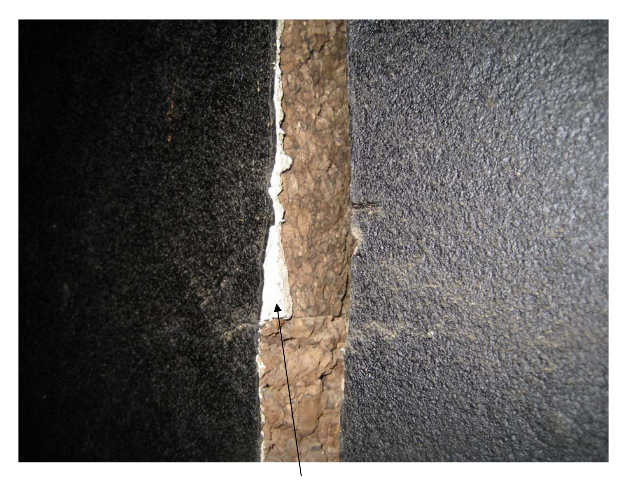
HA #13 – Asbestos containing black wall/ceiling covering on cork