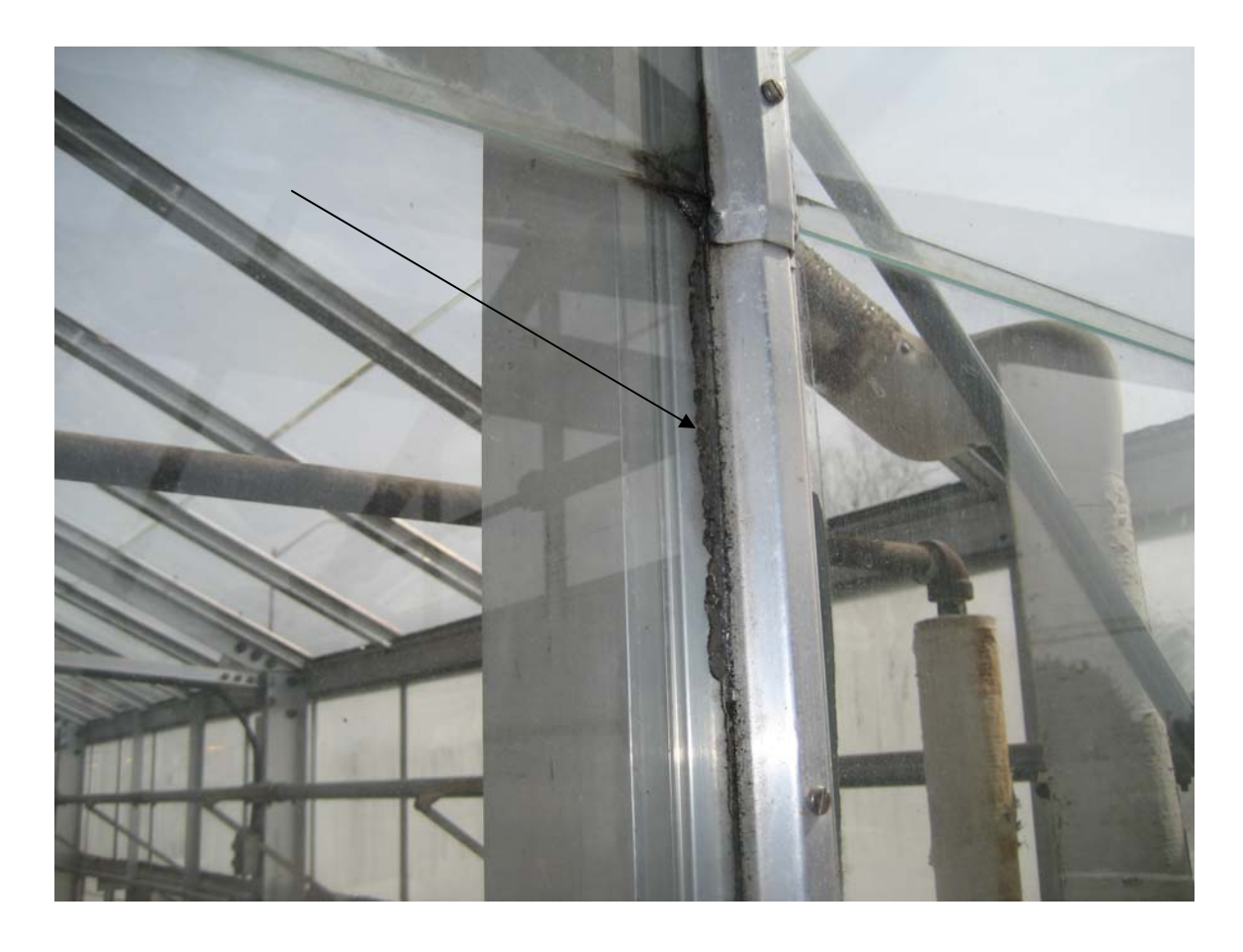
HA #7 – Asbestos containing gray caulk, 1978 addition