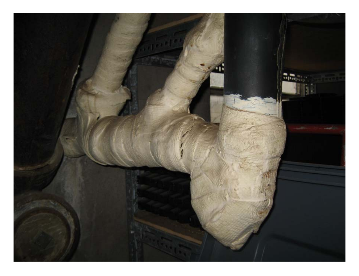
HA #24 – Asbestos containing white pipe coating