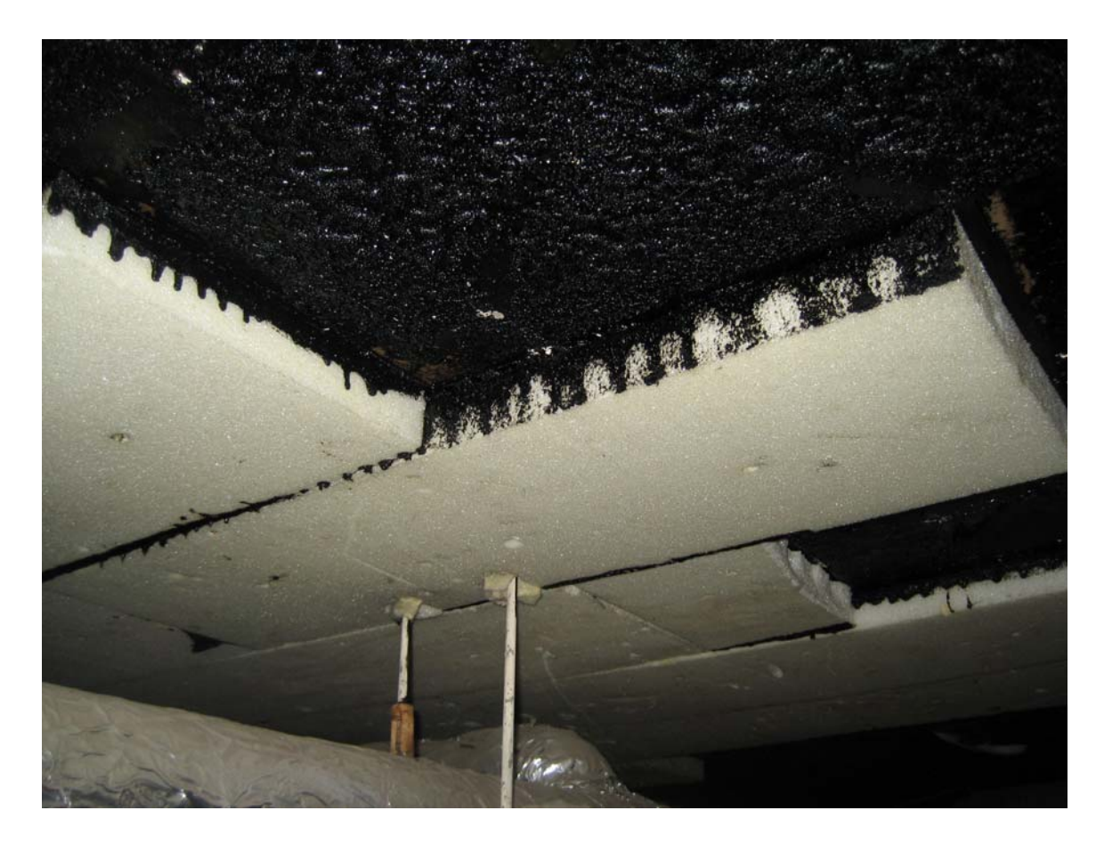
HA #11 – Asbestos containing white Styrofoam insulation and black mastic with associated gluepods