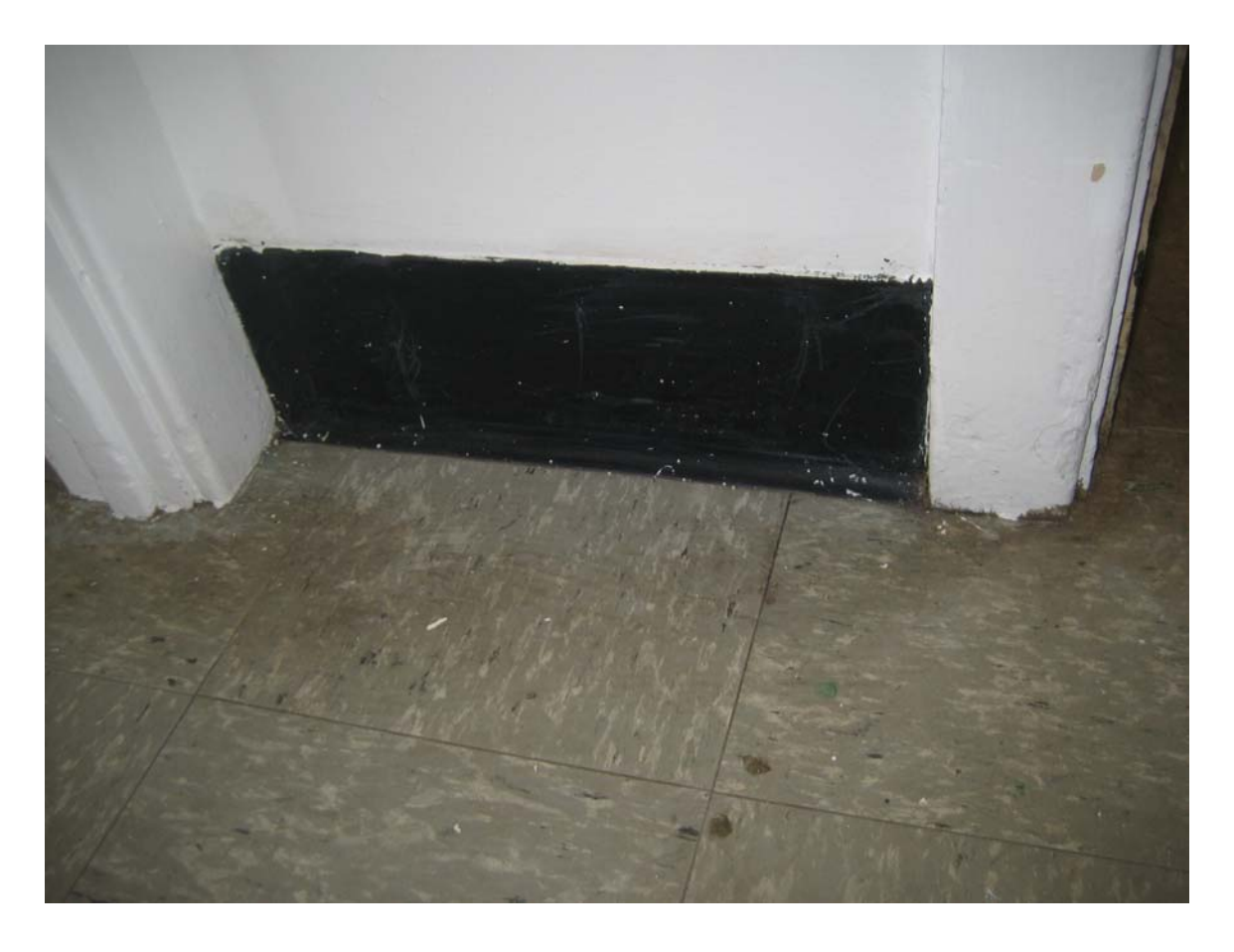
HA #16 – Non asbestos containing 6" black cove molding and associated mastic