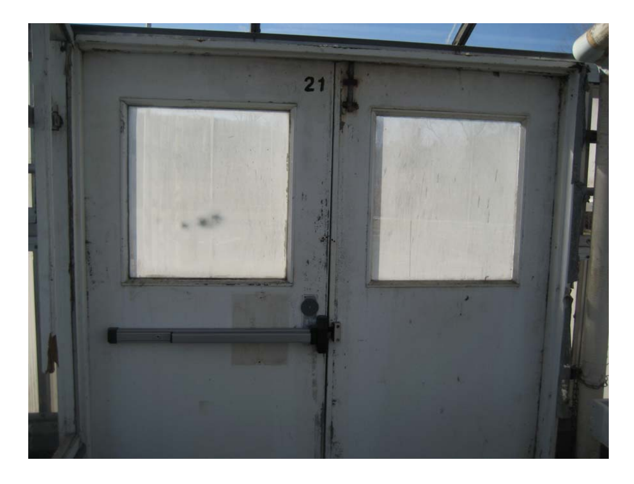
HA #6 – Assumed asbestos containing fire door and frame