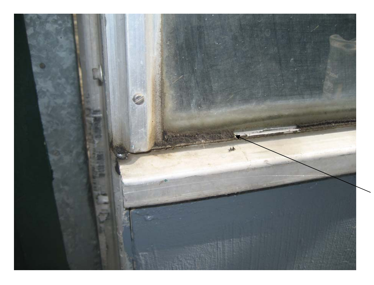
HA #8 – Asbestos containing black caulk and white window glazing layer, 1978 addition