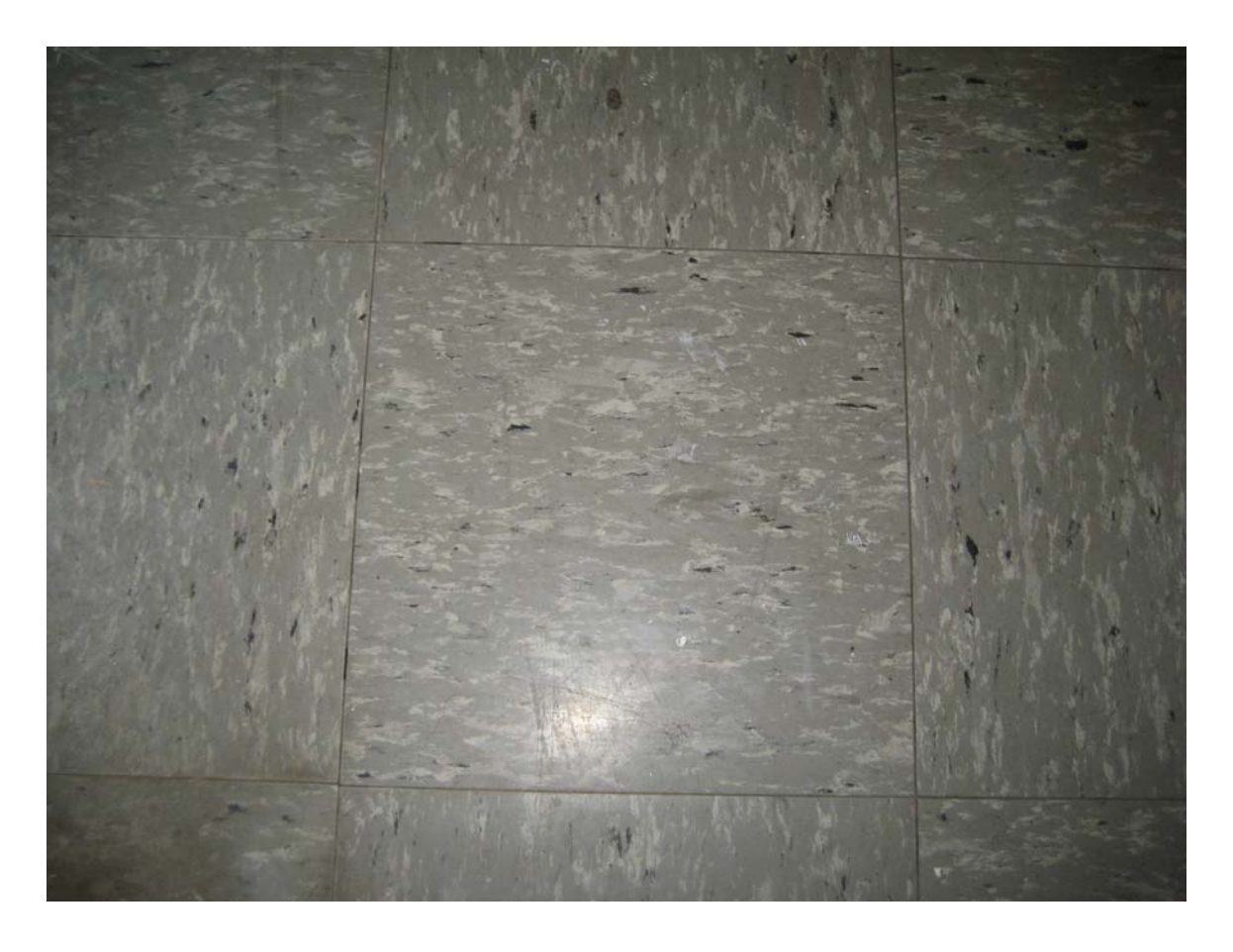
HA #15 – Asbestos containing 12"x 12" gray floor tile with light gray and white streaks and associated mastic