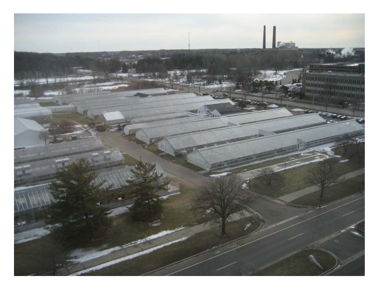
Plant Sciences Greenhouse, West Range (#93)