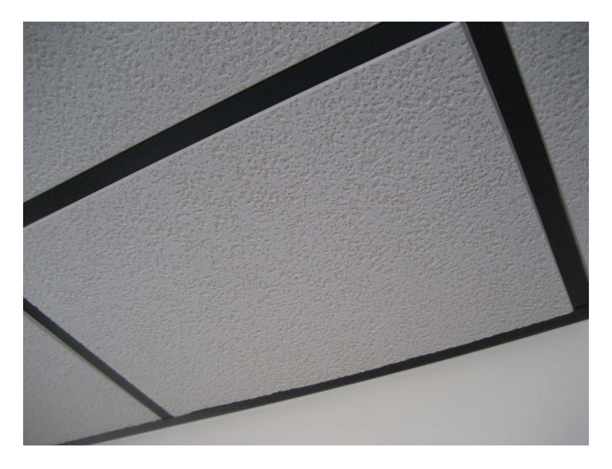
HA #20 – Non asbestos containing 2'x 2' drop-in ceiling tile with pinholes and light fissures