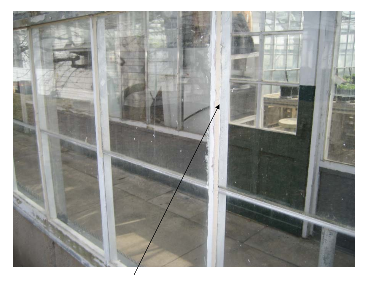
HA #26 – Non-asbestos containing exterior glass wall glazing compound