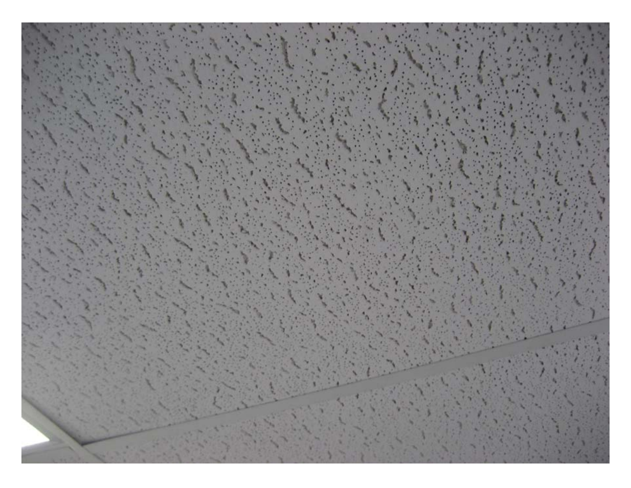
HA #18 – Non-asbestos containing 2'x 4' white lay-in ceiling tile with pinholes and fissures