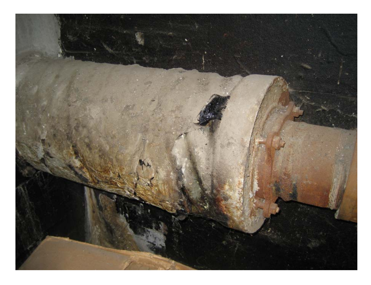
HA #12 – Asbestos containing black covering on metal