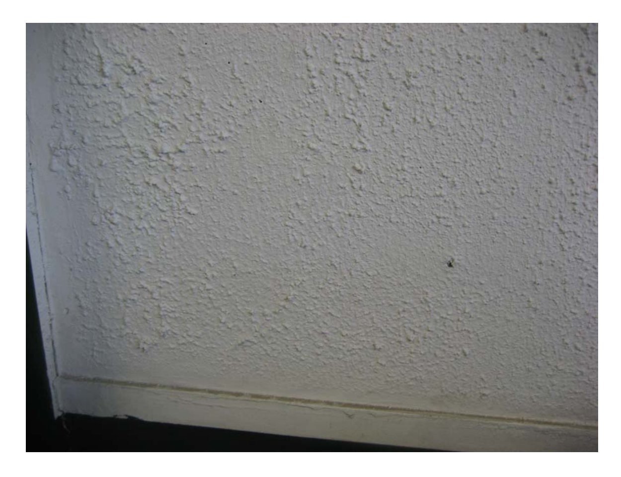
HA #19 – Non-asbestos containing heavy texture plaster skim coat