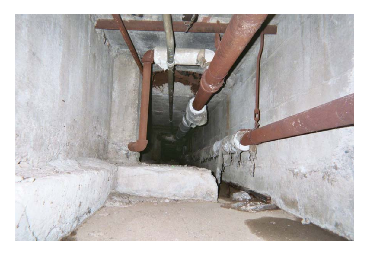
Asbestos-containing steam/condensate pipe straight insulation