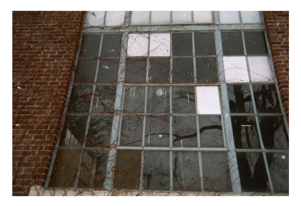
Assumed asbestos-containing window glazing compound