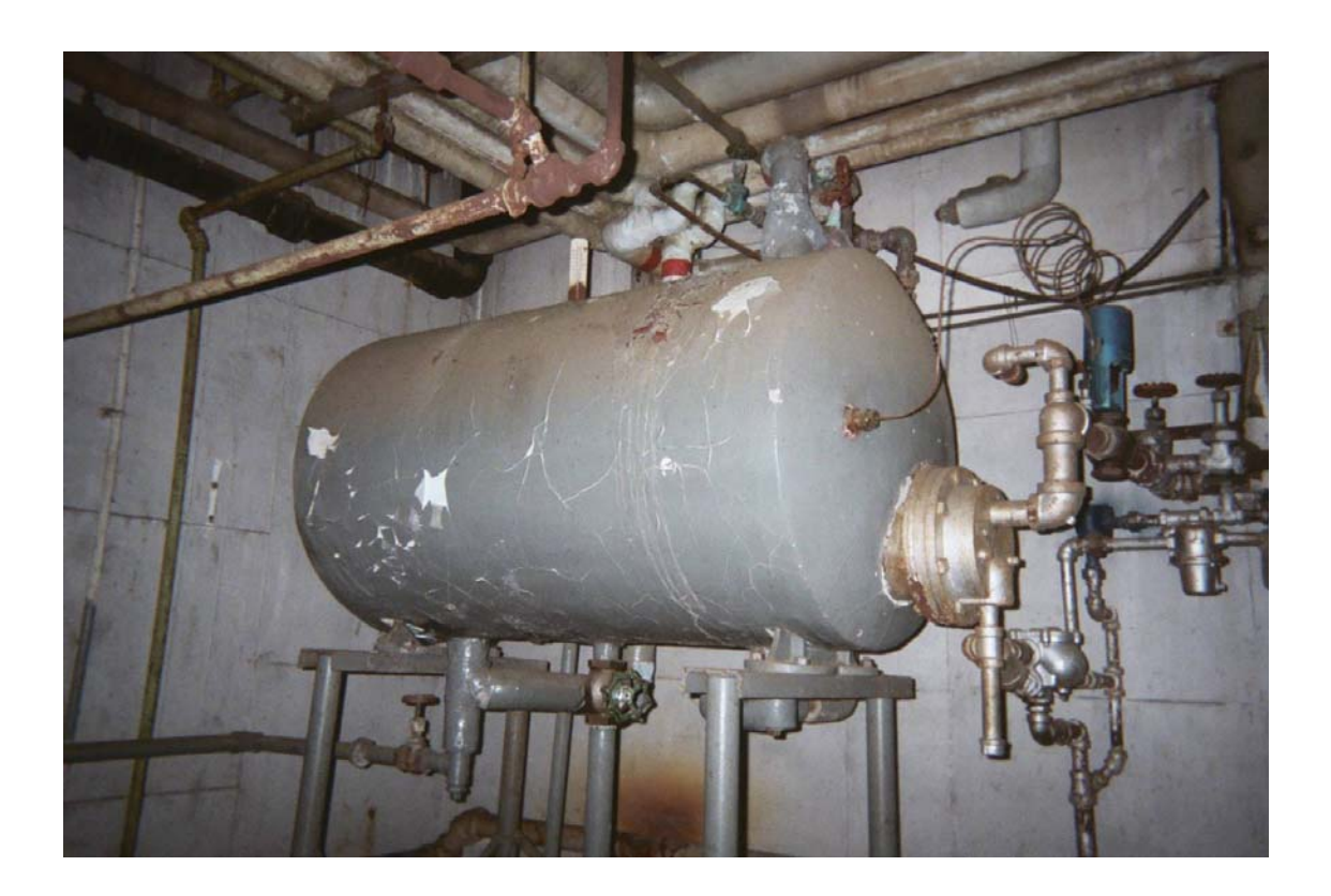
Asbestos-containing hot water holding tank insulation