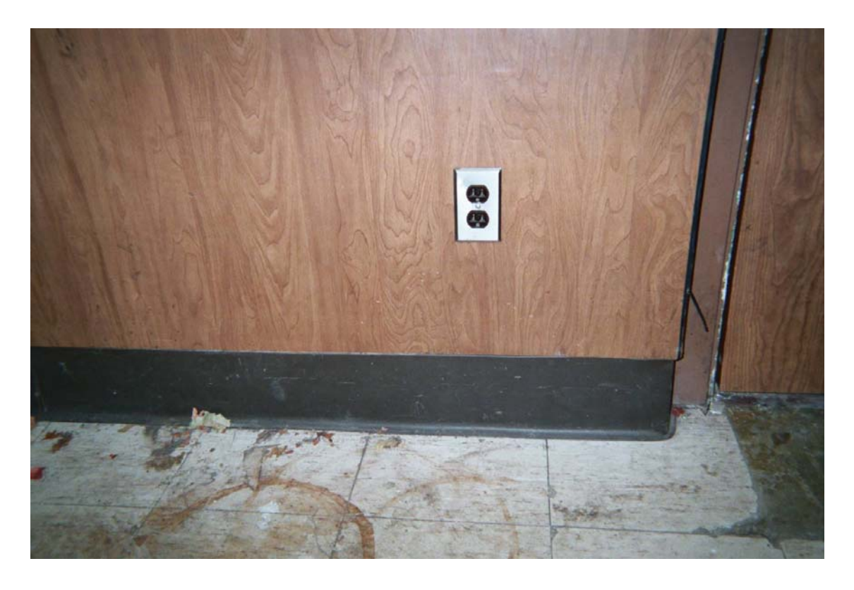
Non-asbestos containing 6" brown cove molding and associated mastic