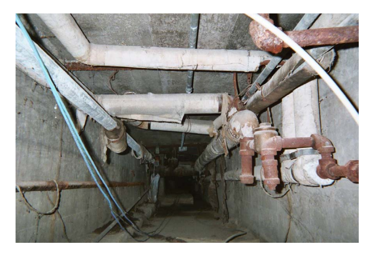
Asbestos-containing steam/condensate pipe straight insulation