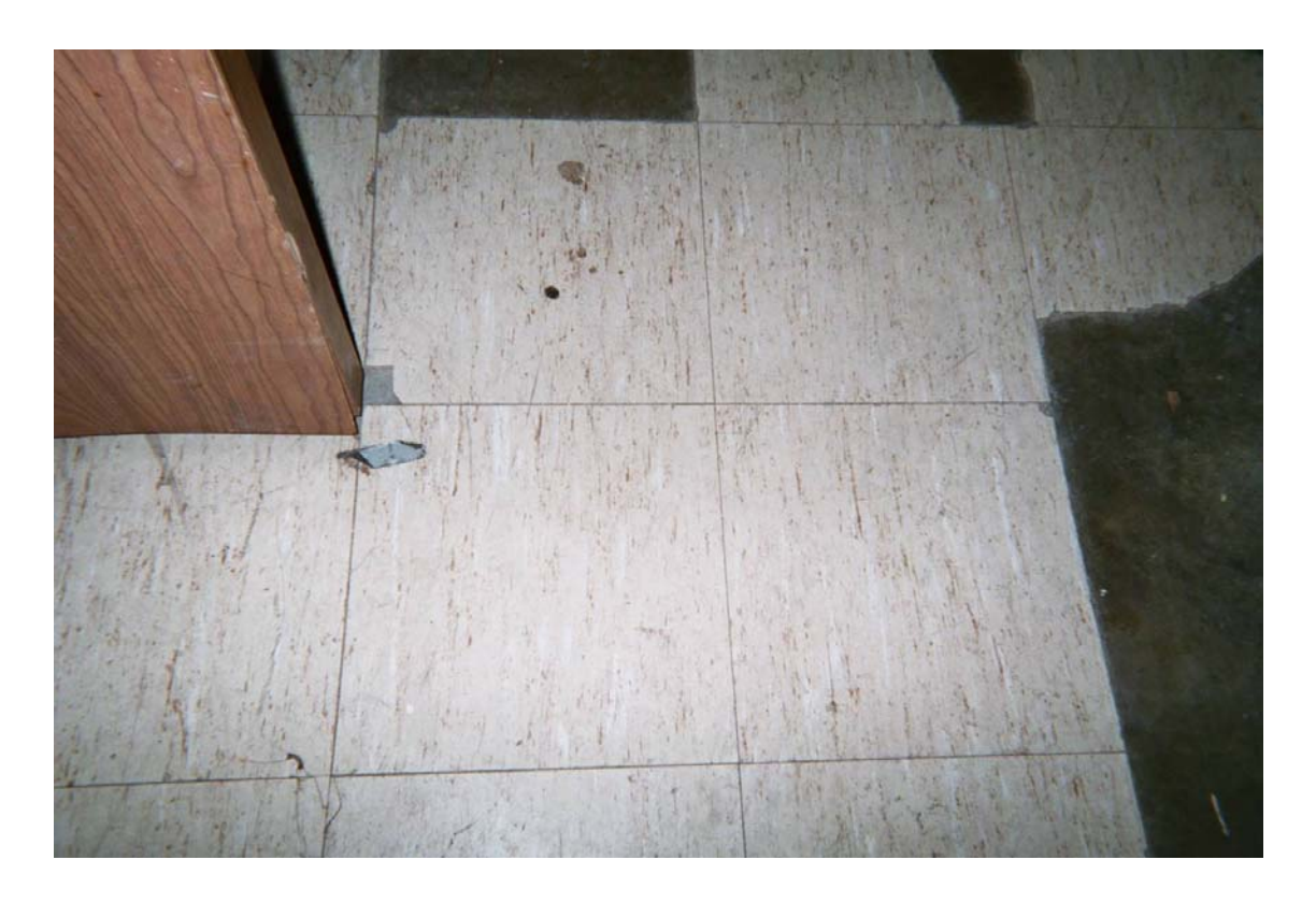
Asbestos-containing 9" x 9" wood grain pattern floor tile