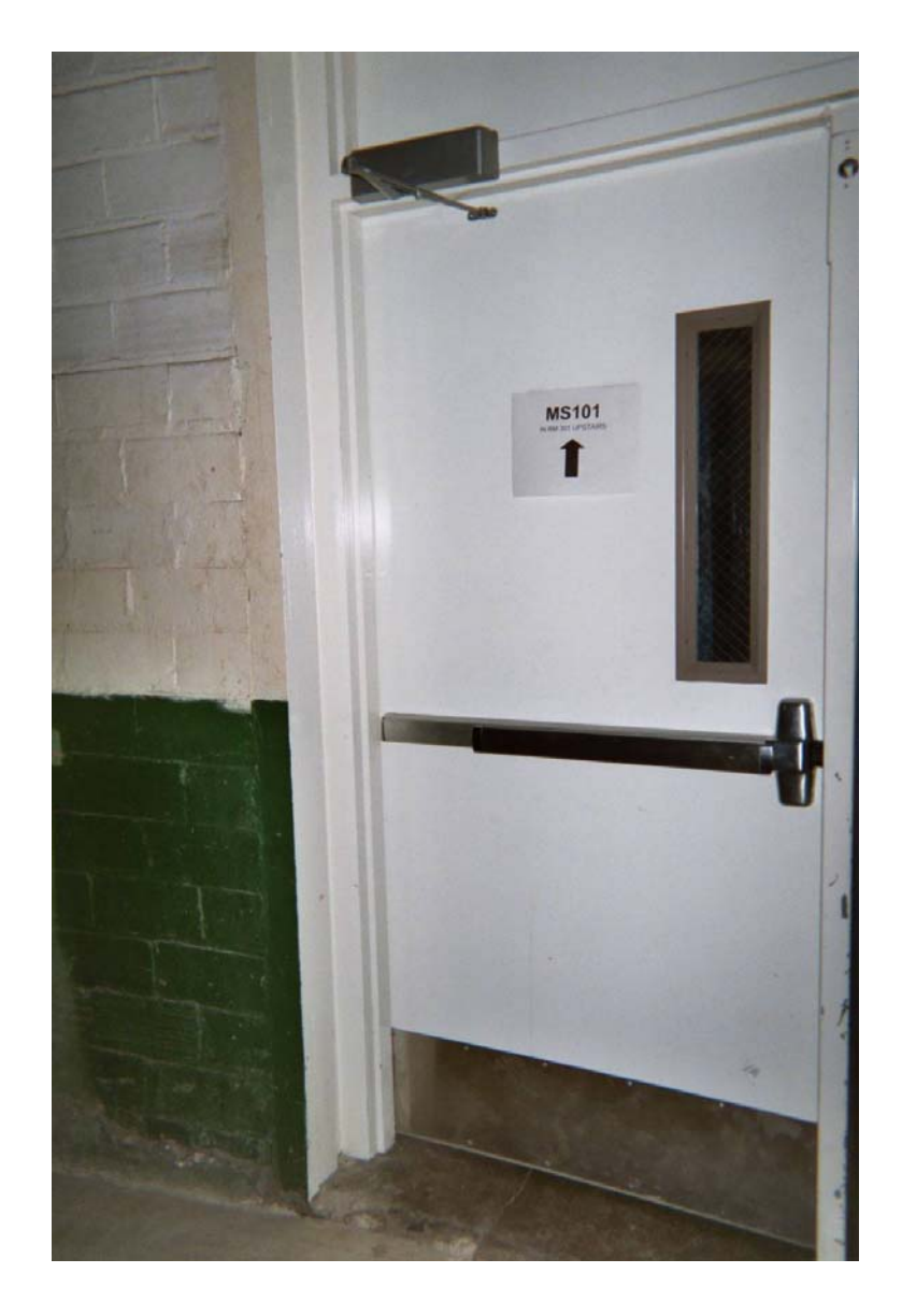
Assumed asbestos-containing fire door and frame