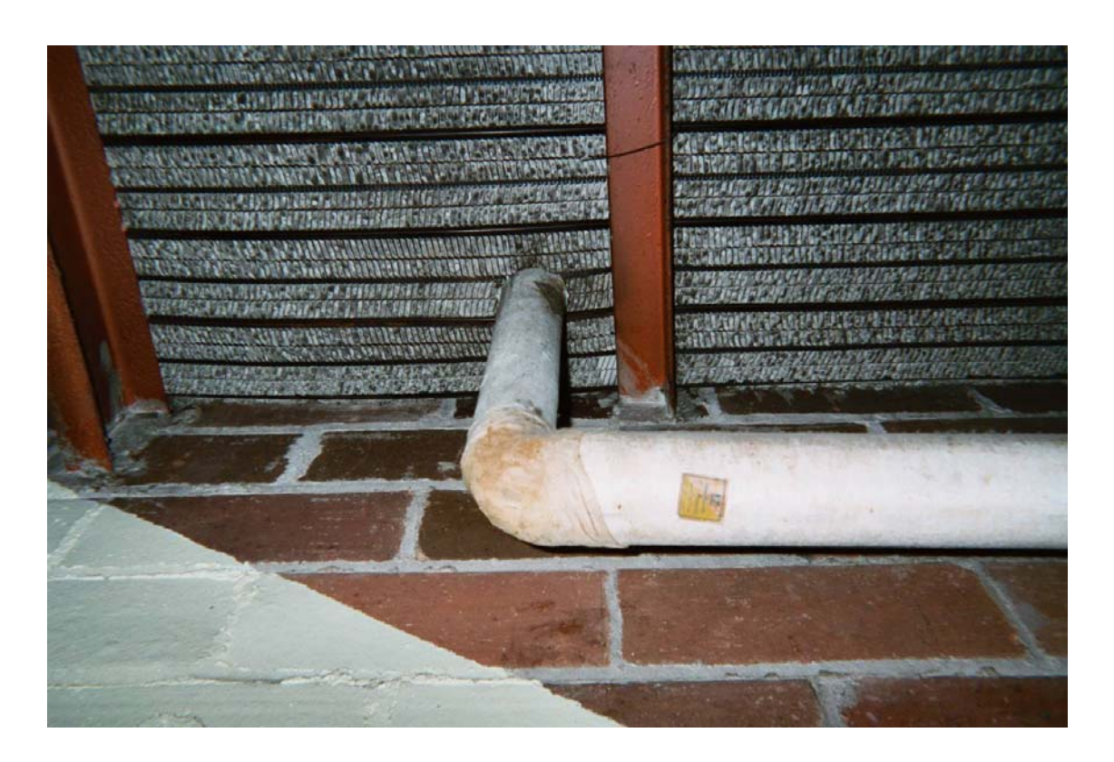
Asbestos-containing steam/condensate pipe straight insulation