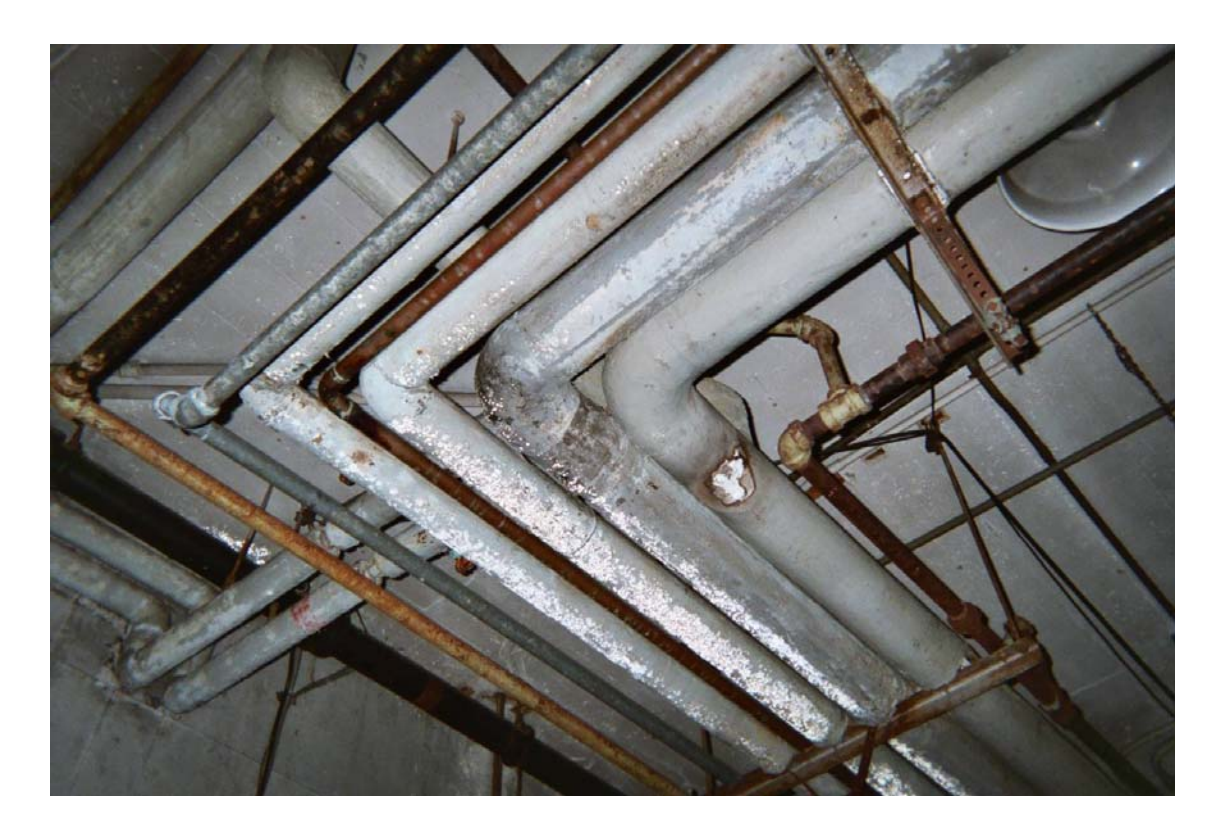
Asbestos-containing domestic water pipe joint and hanger insulation