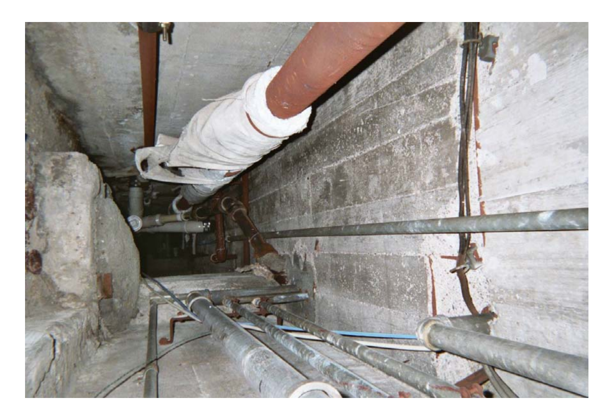
Asbestos-containing steam/condensate pipe straight insulation