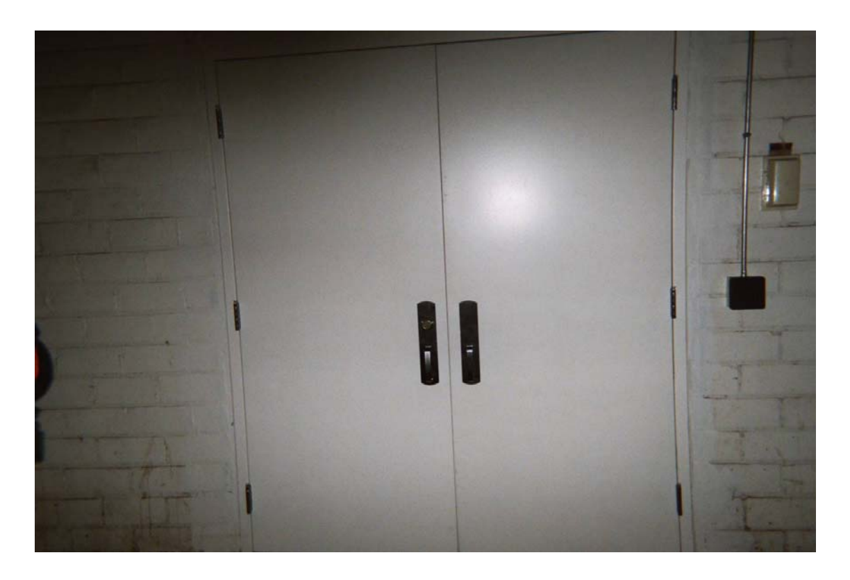
Assumed asbestos-containing fire door and frame