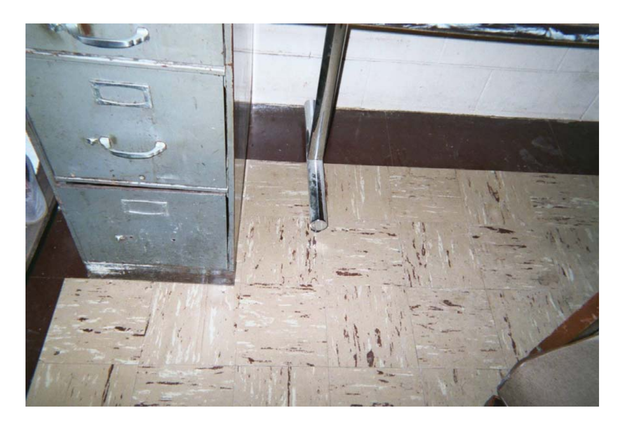
Asbestos-containing 9" x 9" tan floor tile with cream and rust streaks