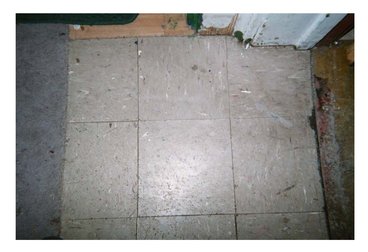
Asbestos-containing 9" x 9" gray floor tile with cream and pink streaks