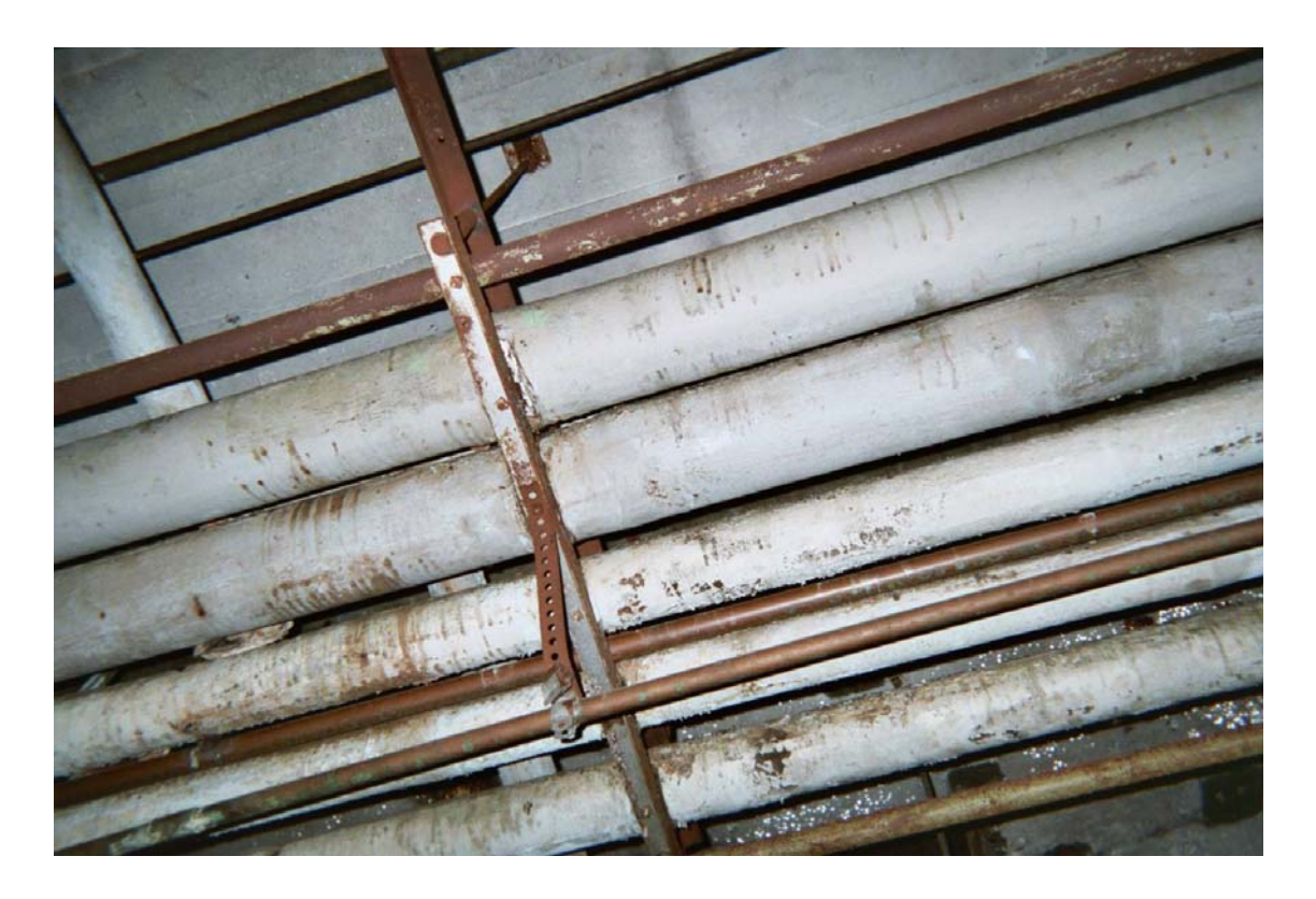
Asbestos-containing domestic water pipe straight insulation