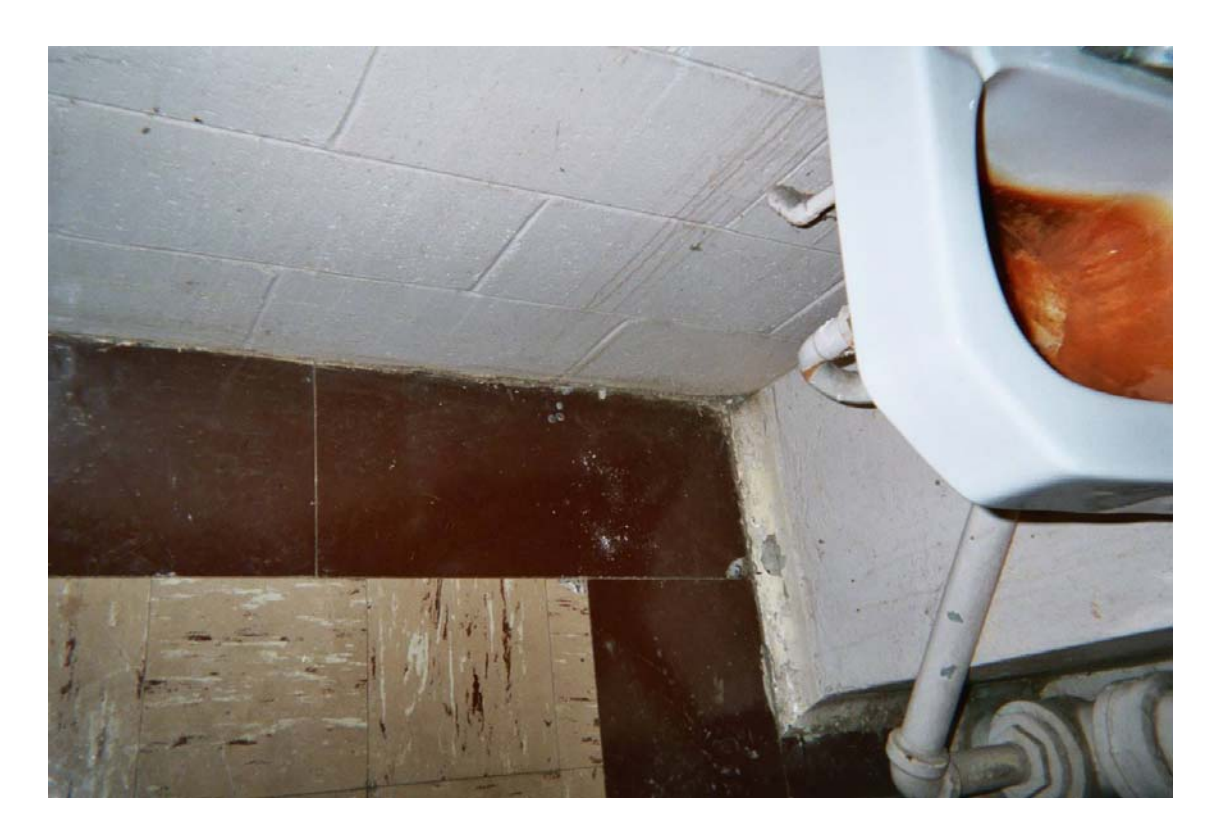
Asbestos-containing 1' x 2' brown floor tile