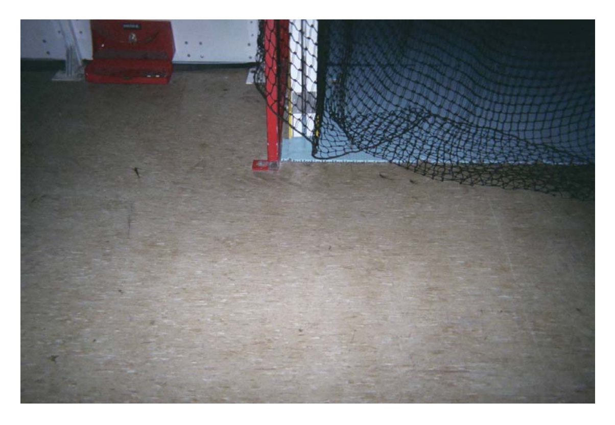
Non-asbestos containing tan linoleum with cream and brown streaks