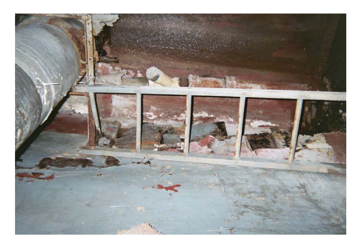
Asbestos-containing boiler thermal system insulation