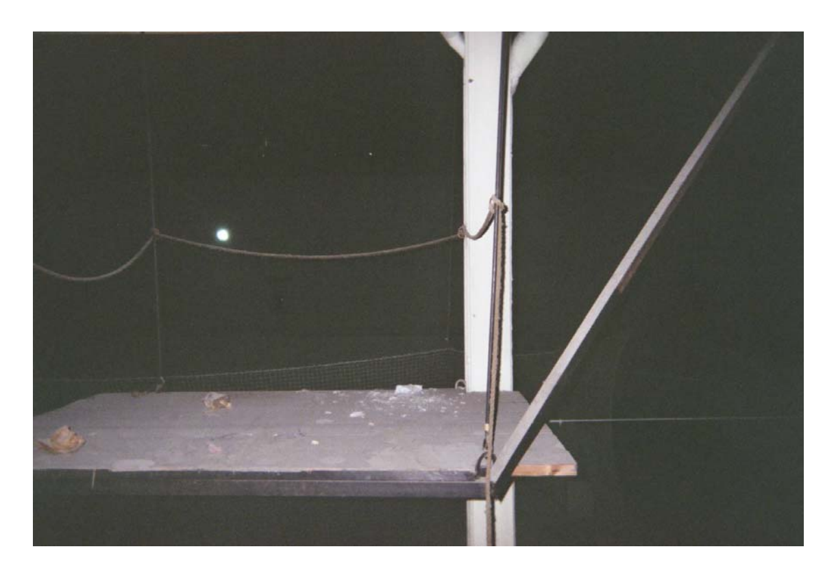
Asbestos-containing raised platform ACM debris