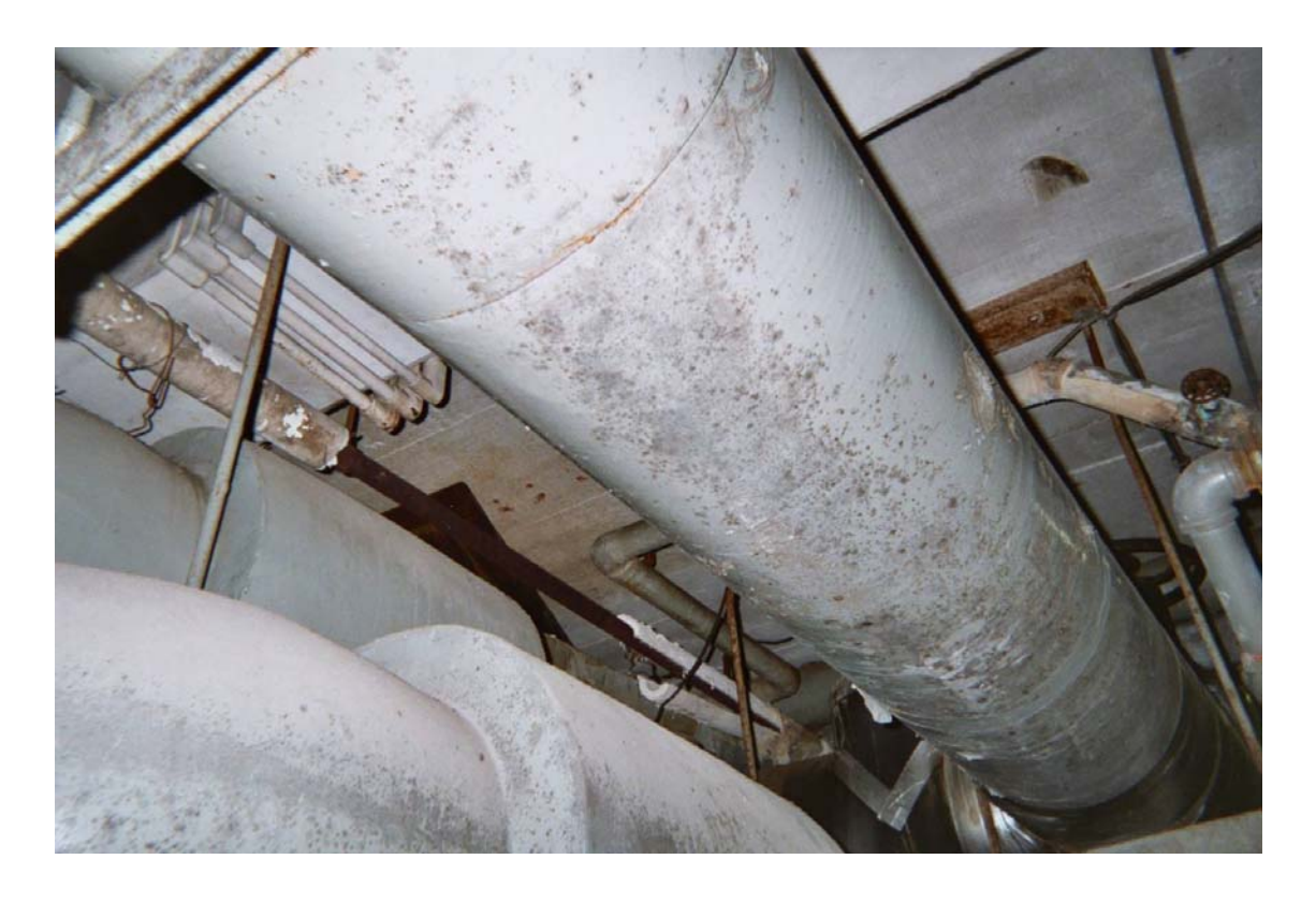
Asbestos-containing Steam/condensate pipe straight insulation