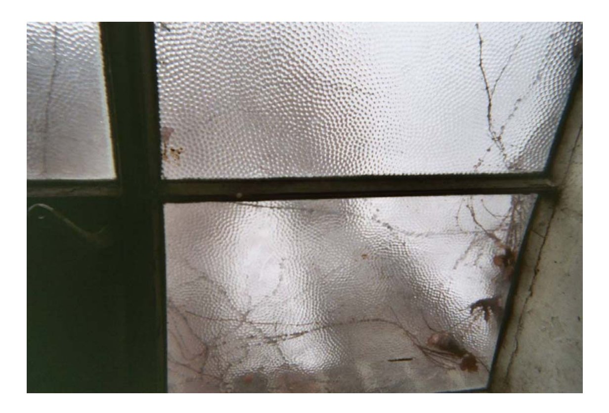
Assumed asbestos-containing window and door frame caulk compound