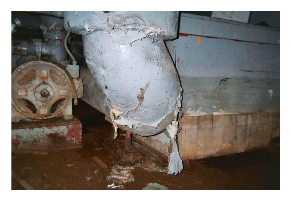
Asbestos-containing steam/condensate pipe joint and hanger insulation