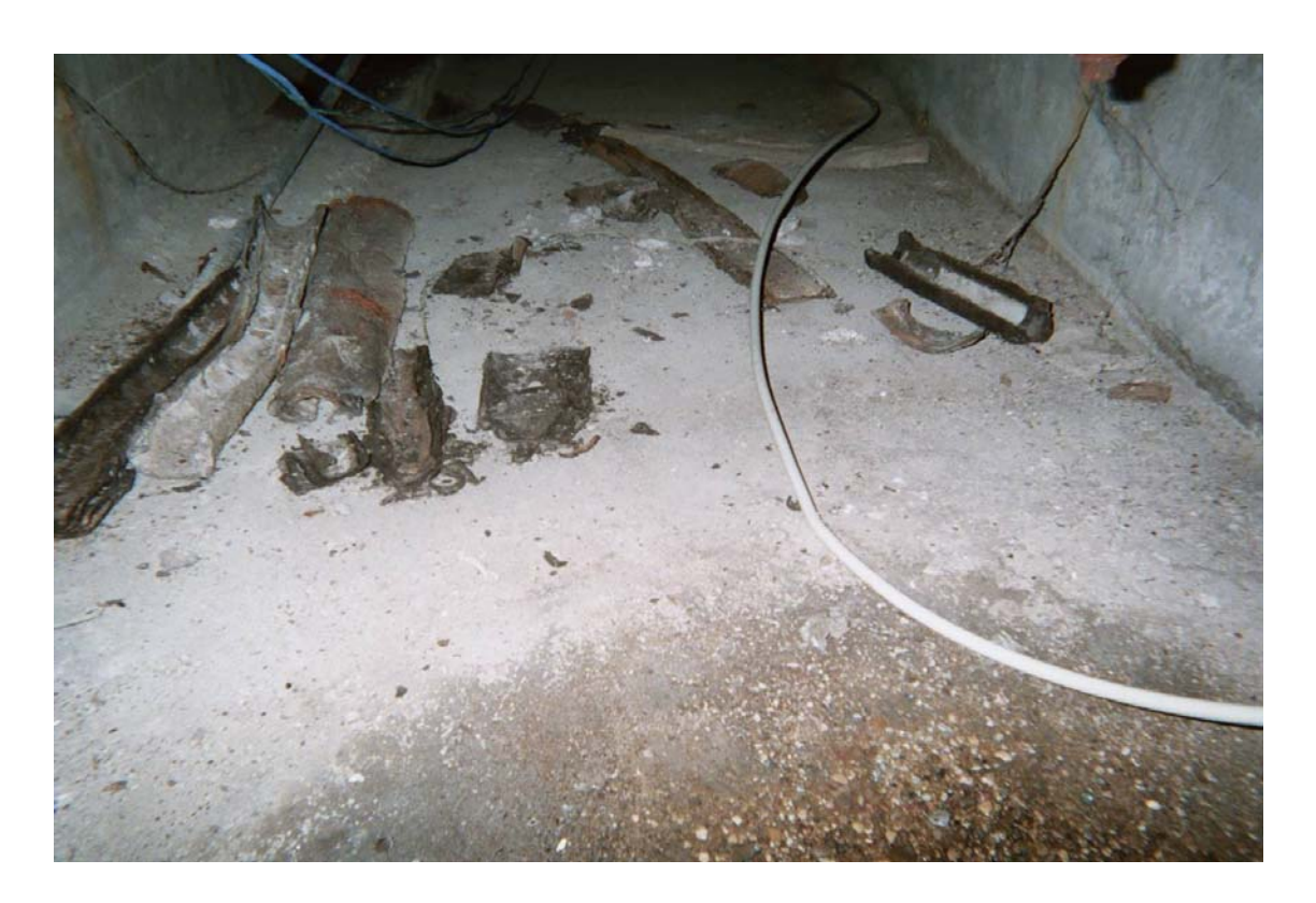
Asbestos-containing steam pipe straight insulation ACM debris on floor of tunnel area