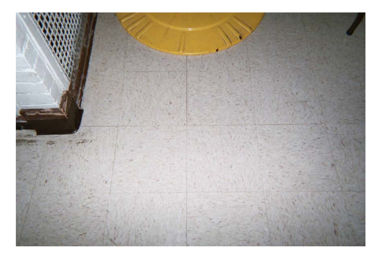
Non-asbestos containing tan linoleum with cream and brown streaks