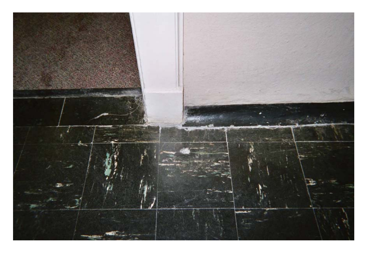
Asbestos-containing 9" x 9" black floor tile with cream and green streaks