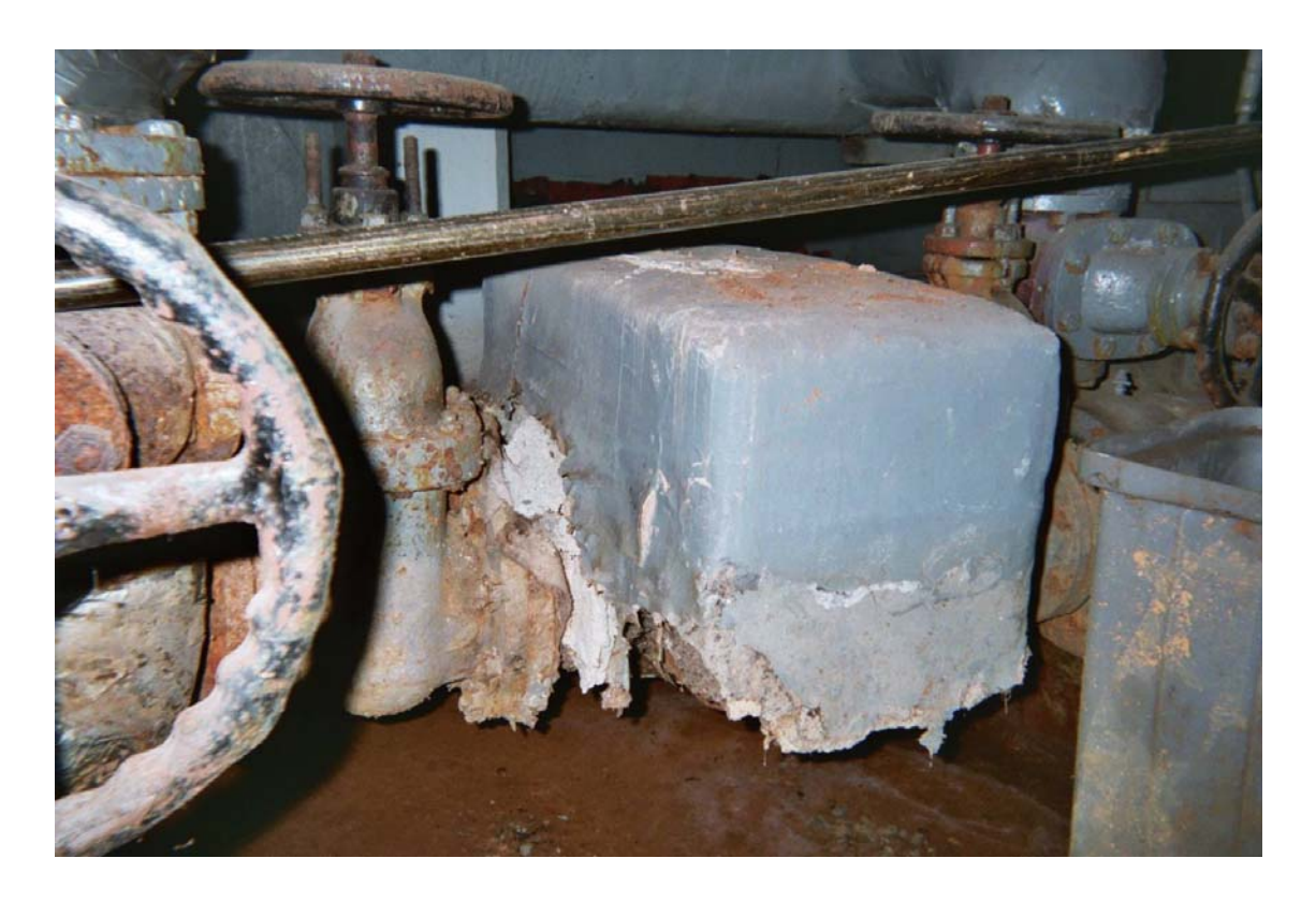
Damaged thermal system insulation, Boiler Room