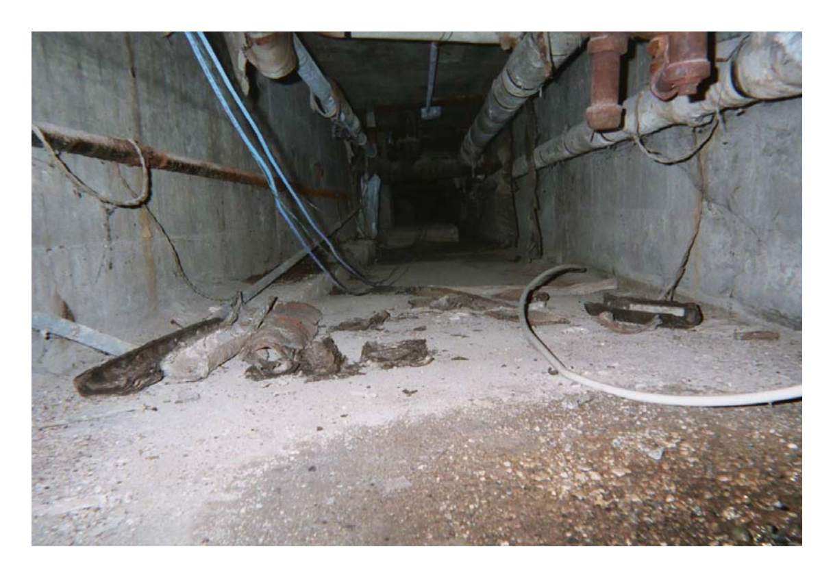
Asbestos-containing steam pipe straight insulation ACM debris on floor of tunnel area