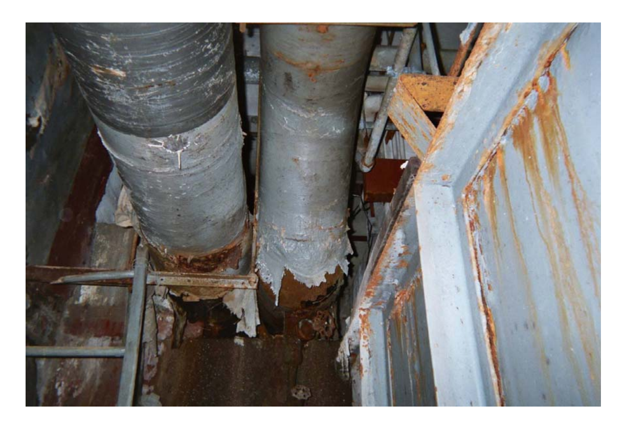
Asbestos-containing steam/condensate pipe straight insulation