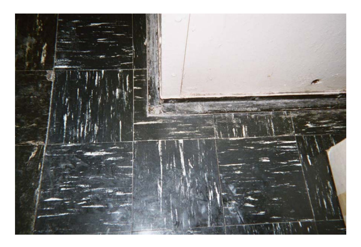
Asbestos-containing 9" x 9" black floor tile with cream streaks