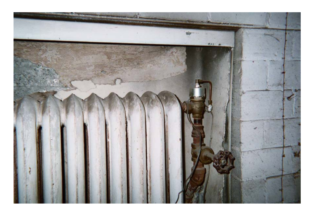
Asbestos-containing radiator backing paper