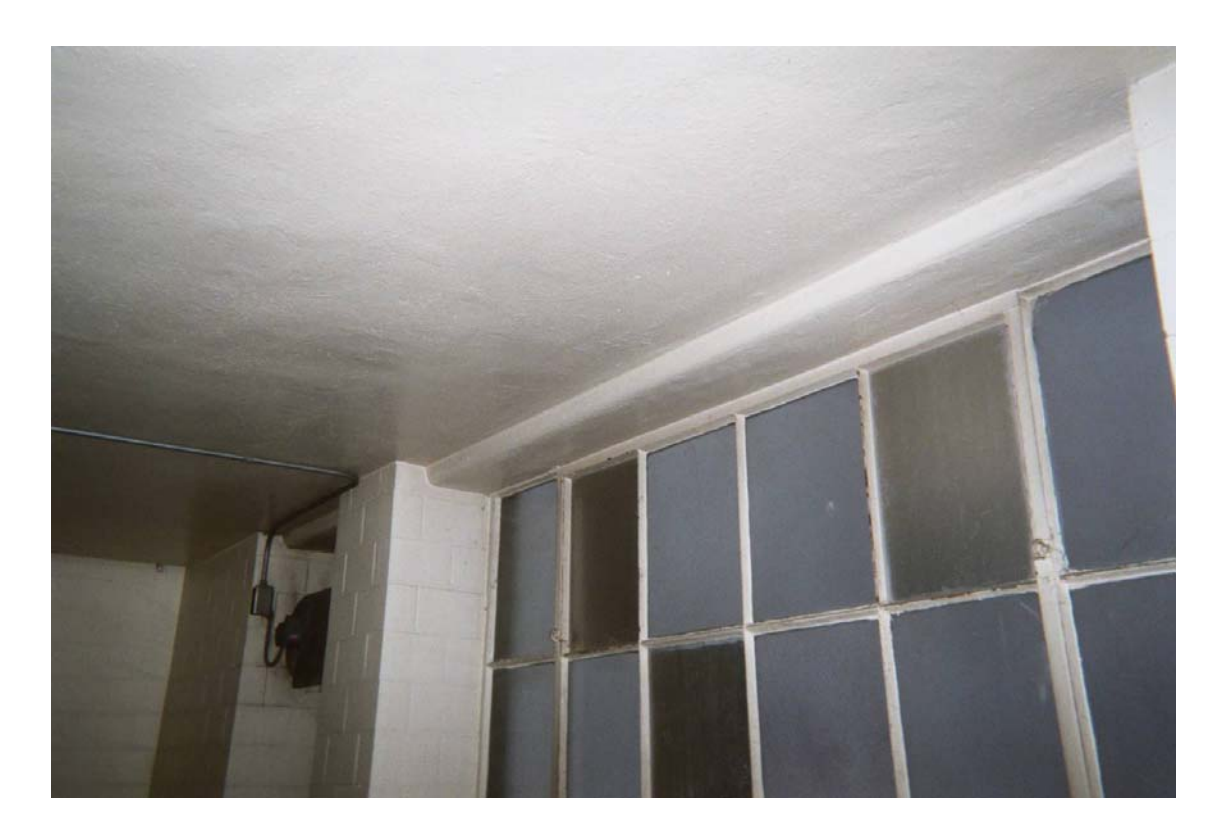
Assumed asbestos-containing window glazing compound