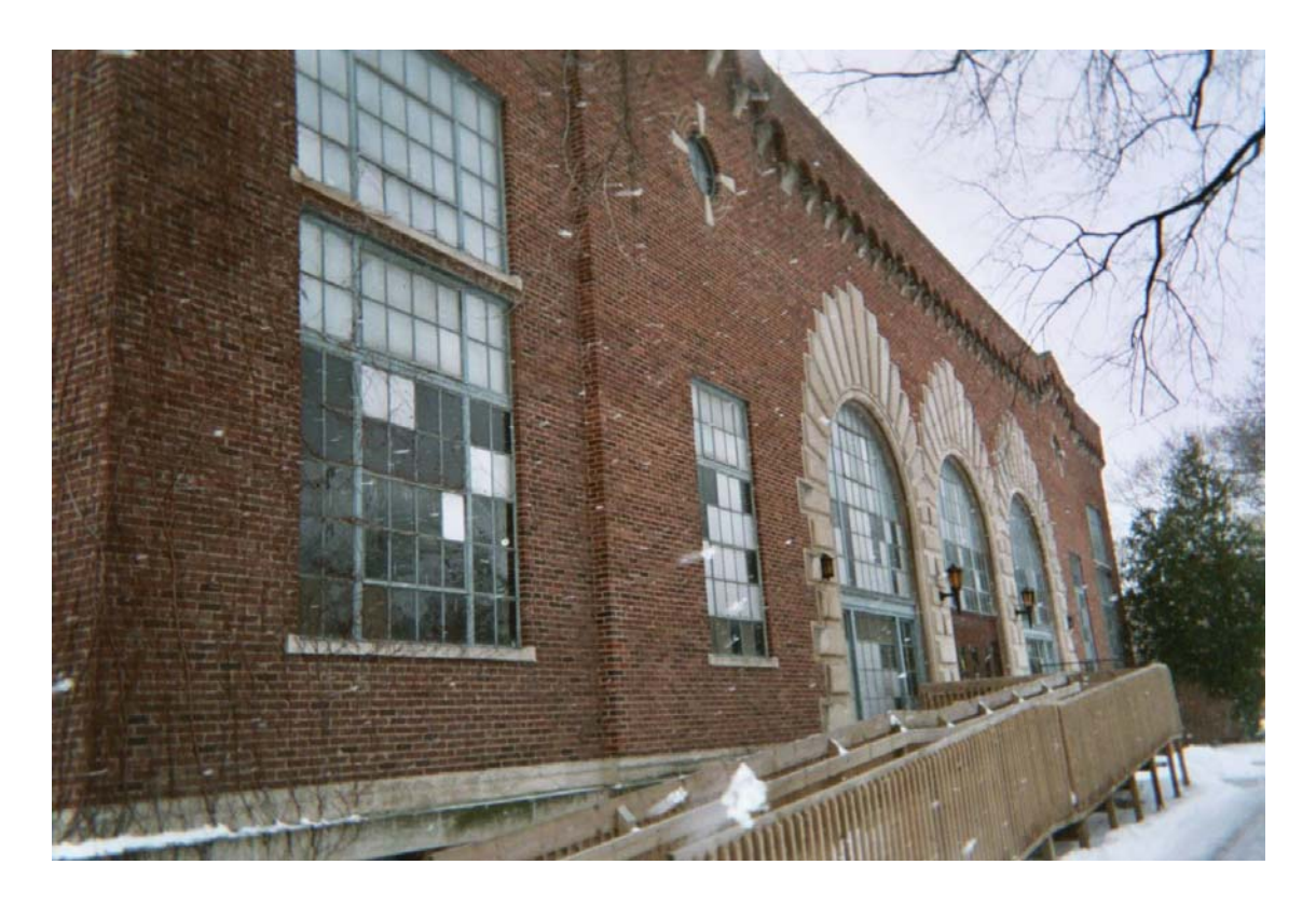
Outside of building, Demonstration Hall