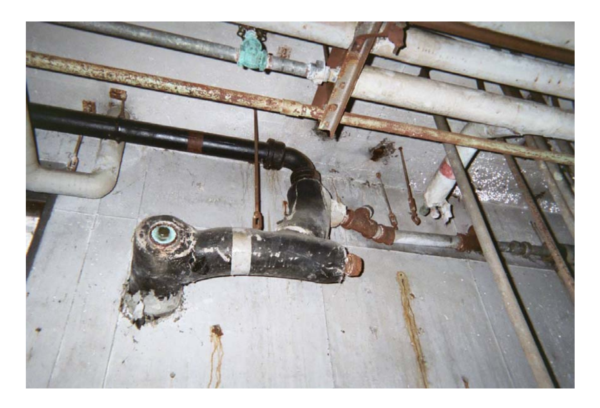
Asbestos-containing sewer drain pipe straight insulation and asbestos-containing sewer drain pipe joint and hanger insulation