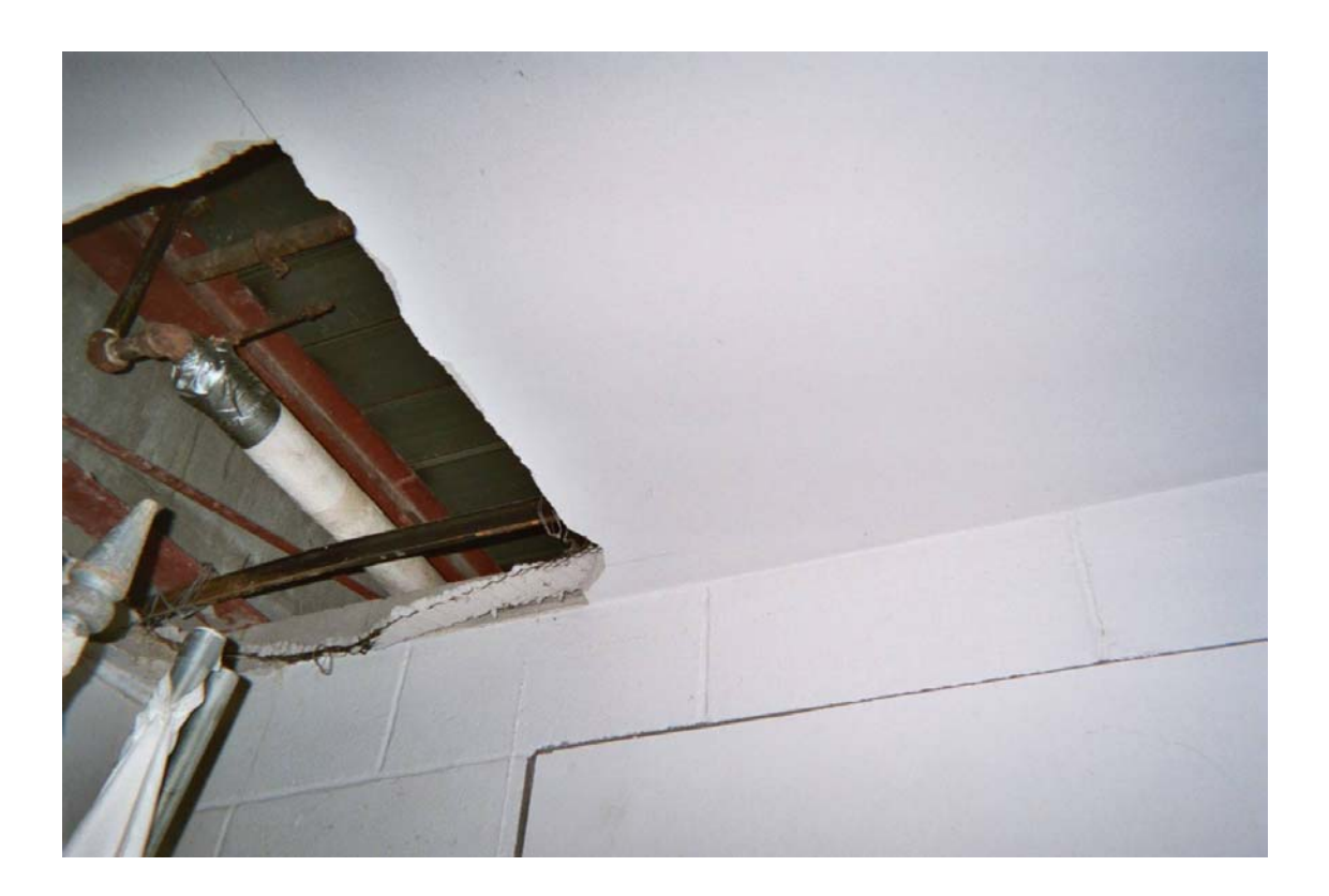
Non-asbestos containing plaster