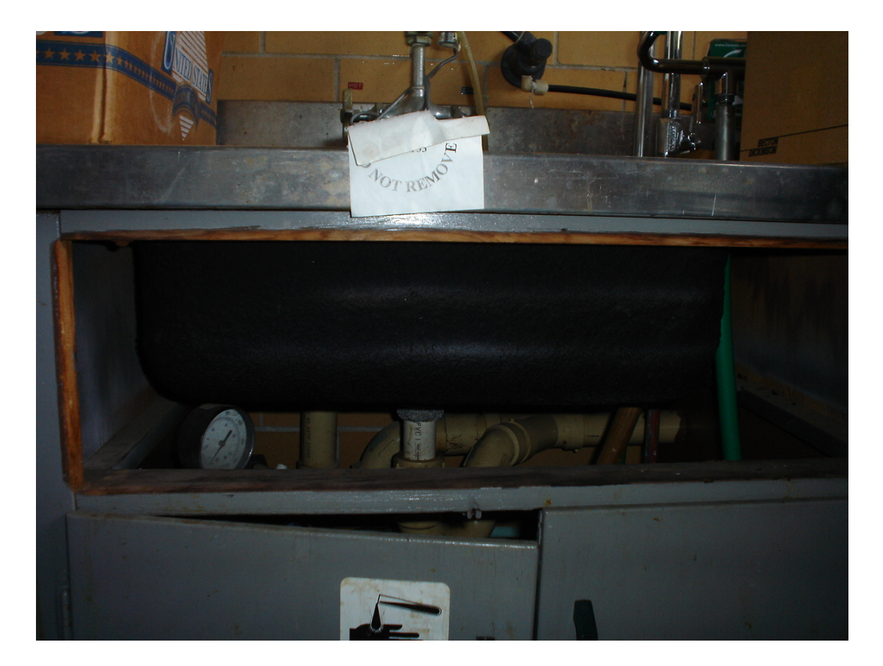
HA #12 – Asbestos-containing black sink undercoating