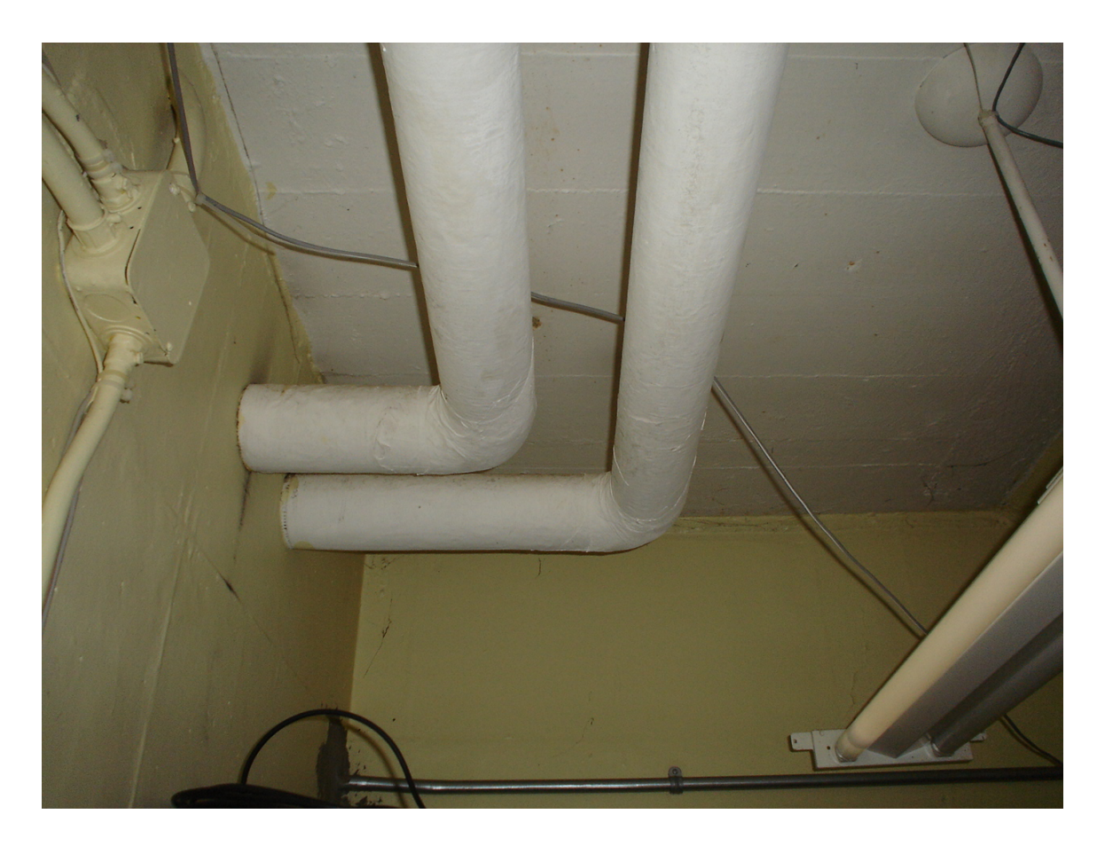
HA #8 – Asbestos-containing steam/condensate supply and return pipe joint insulation (on fiberglass line)