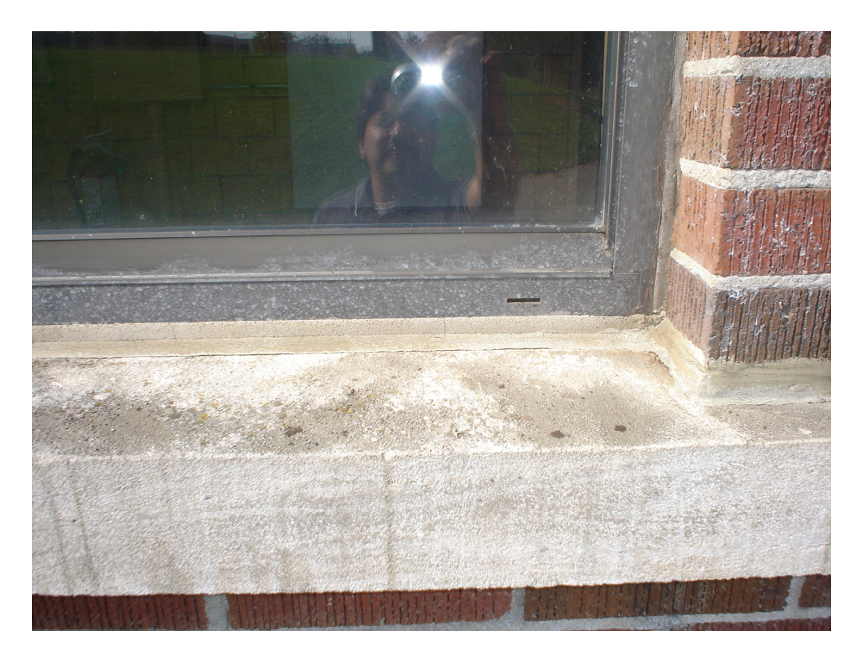
HA #9 – Non asbestos-containing exterior window and door frame caulk compound