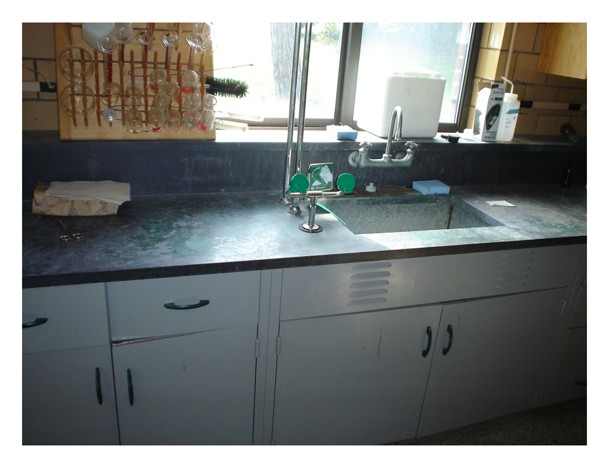
HA #11 – Assumed asbestos-containing laboratory sinks, table tops and ledges