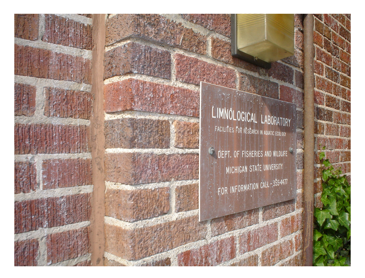
HA #13 - Asbestos-containing building caulk compound