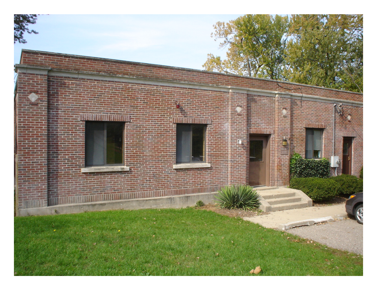
Exterior of the River Water Research Building