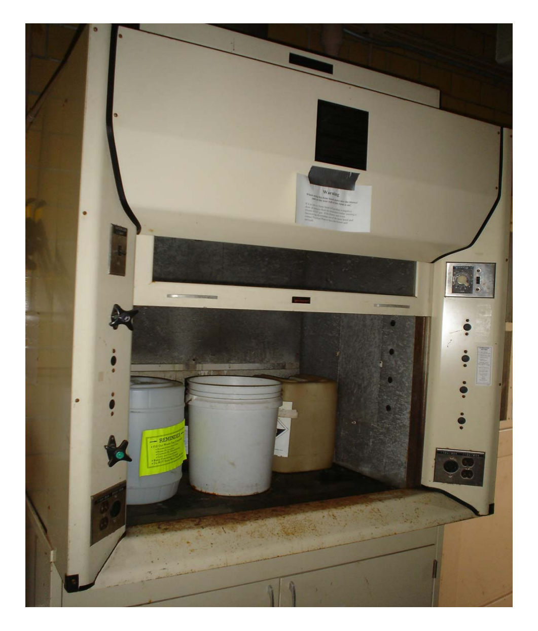
HA #10 - Assumed asbestos-containing laboratory fume hood