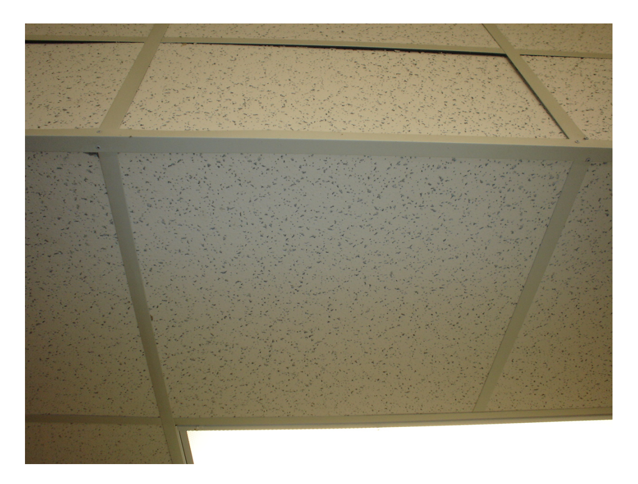
HA #3 – Non asbestos-containing 2' x 2' white lay-in ceiling tile with pin holes and fissures