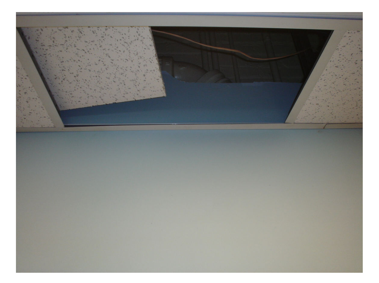
HA #1 - Non asbestos-containing drywall