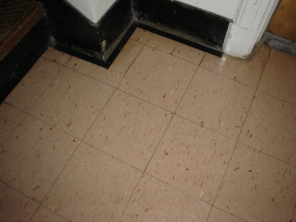
HA #37 – Asbestos-containing 9" x 9" pink floor tile with cream and red streaks and associated mastic

For more information contact MSU Environmental Health and Safety – (517) 353-8956