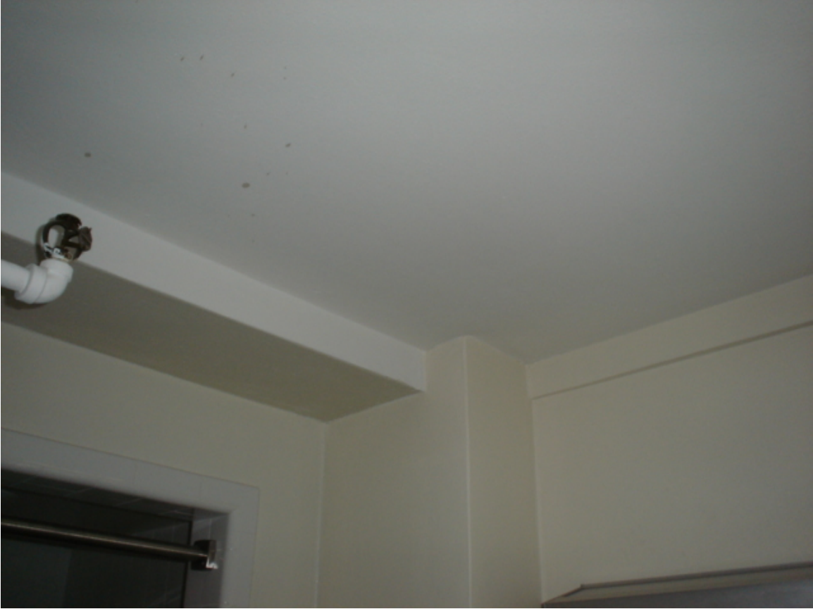
HA #1 – Non asbestos-containing plaster

For more information contact MSU Environmental Health and Safety – (517) 353-8956