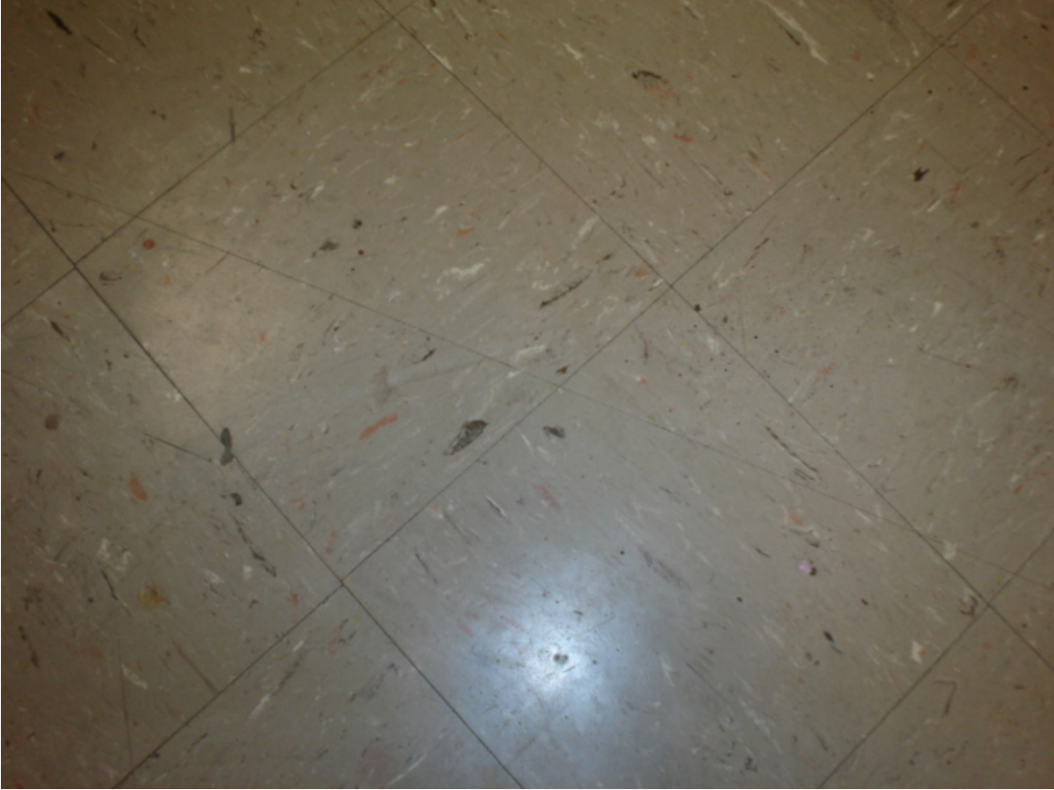
HA #40 – Asbestos-containing 9" x 9" tan floor tile with cream, pink and black streaks and associated non asbestos-containing mastic

For more information contact MSU Environmental Health and Safety – (517) 353-8956