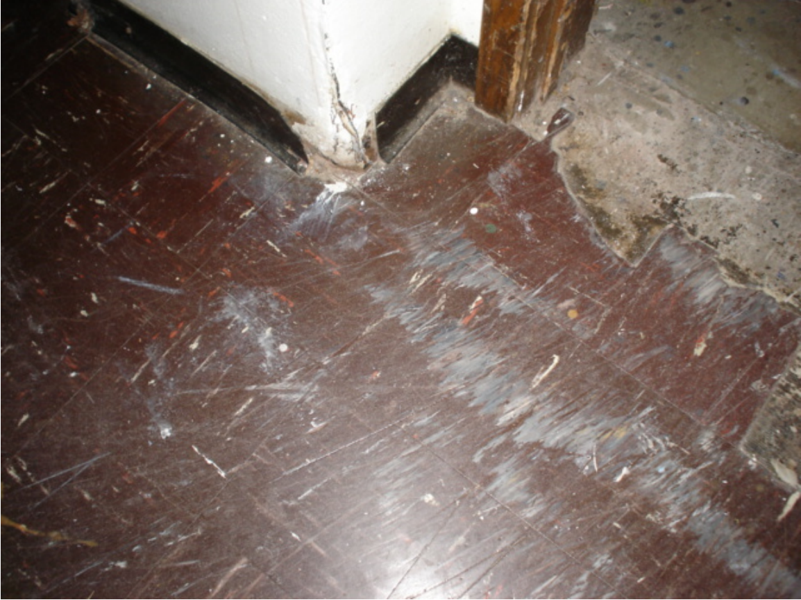
HA #33 – Asbestos-containing 9" x 9" brown floor tile with cream and red streaks and associated mastic

For more information contact MSU Environmental Health and Safety – (517) 353-8956