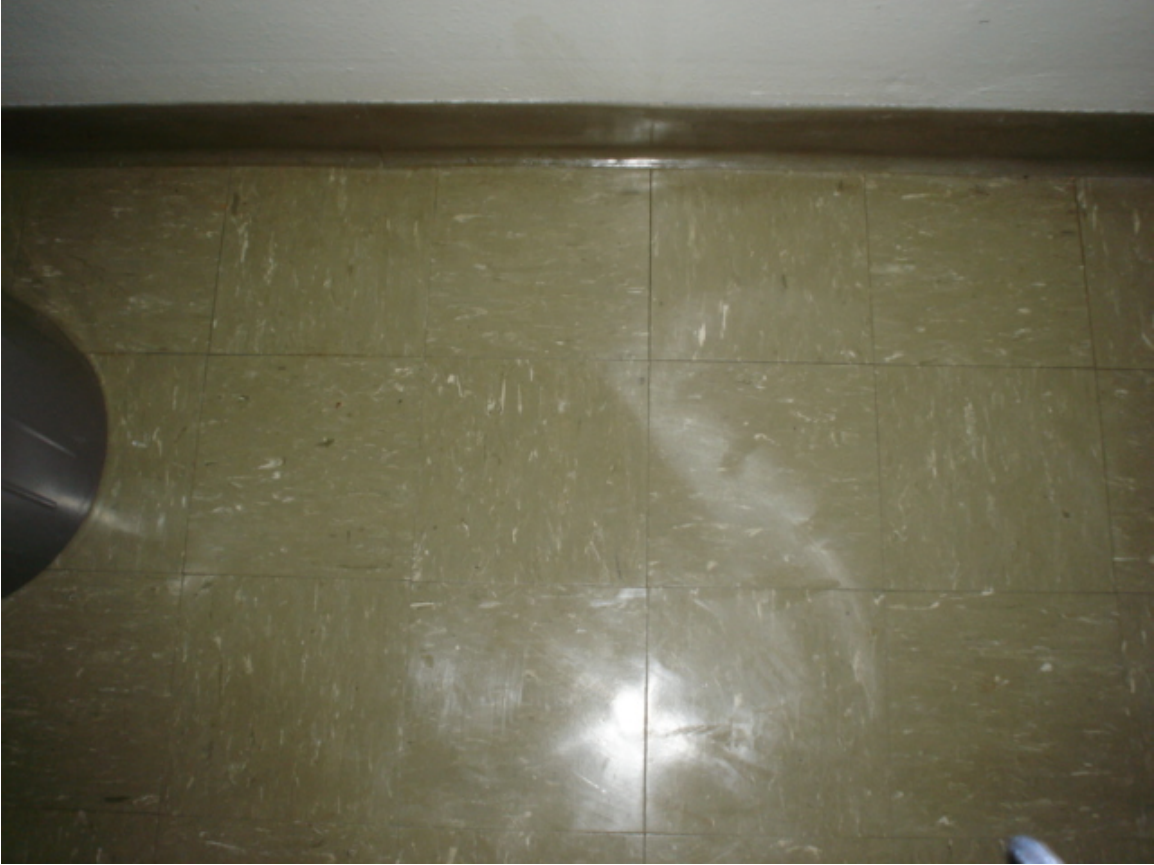
HA #4 – Asbestos-containing 9" x 9" light green floor tile with cream and gray streaks and associated non asbestos-containing mastic

For more information contact MSU Environmental Health and Safety – (517) 353-8956