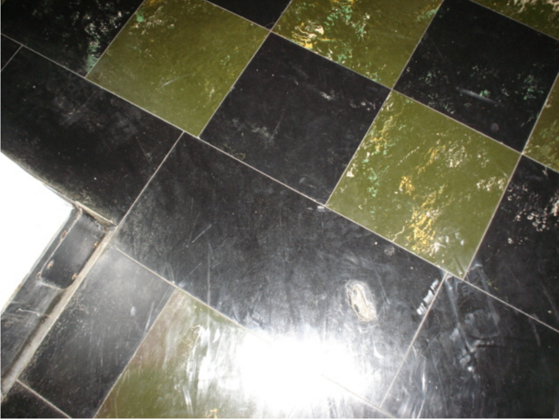
HA #13 – Asbestos-containing 1' x 2' black border floor tile and associated mastic

For more information contact MSU Environmental Health and Safety – (517) 353-8956