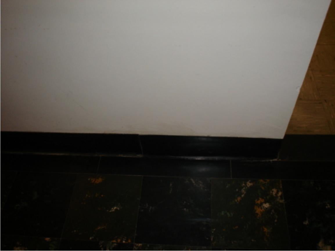
HA #9 – Non asbestos-containing 6" black cove molding and associated mastic

For more information contact MSU Environmental Health and Safety – (517) 353-8956