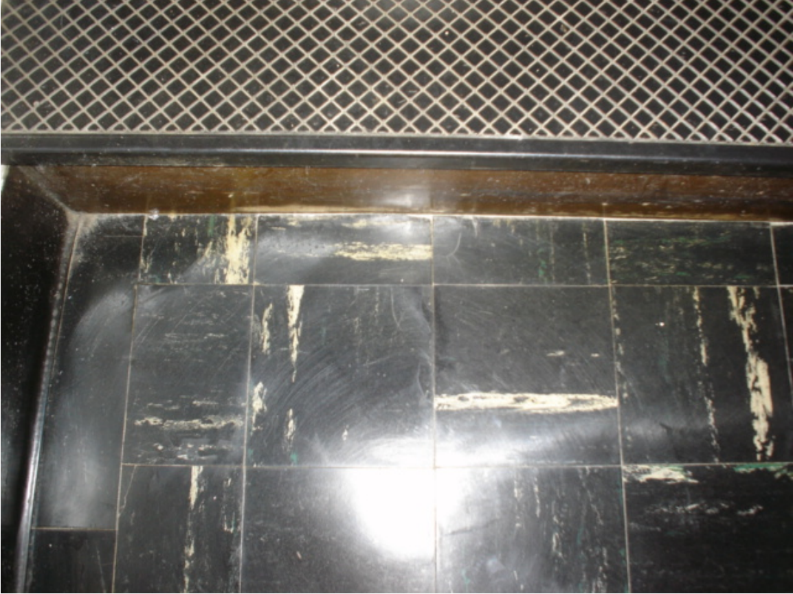
HA #6 – Asbestos-containing 9" x 9" black floor tile with cream and green streaks and associated non asbestos-containing mastic

For more information contact MSU Environmental Health and Safety – (517) 353-8956