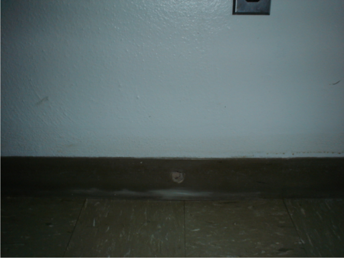
HA #10 – Non asbestos-containing 4" olive cove molding and associated mastic

For more information contact MSU Environmental Health and Safety – (517) 353-8956