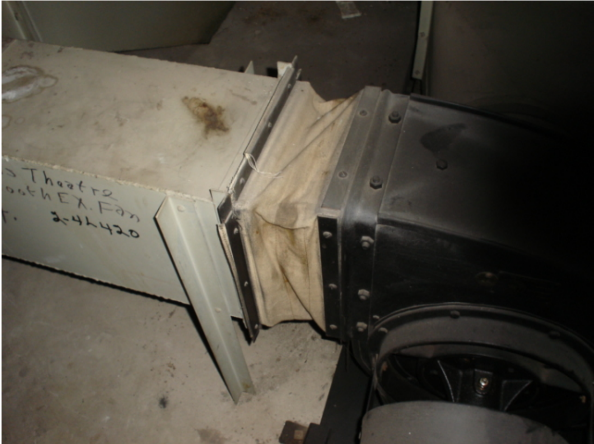
HA #57 – Non asbestos-containing ventilation duct expansion cloth

For more information contact MSU Environmental Health and Safety – (517) 353-8956