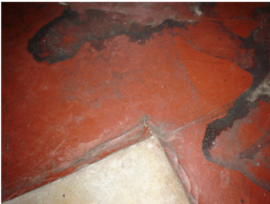
HA #15 – Non asbestos-containing red linoleum flooring and associated backing

For more information contact MSU Environmental Health and Safety – (517) 353-8956