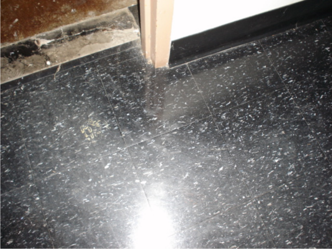
HA #32 – Non asbestos-containing 12" x 12" black floor tile with white specks and associated asbestos-containing mastic

For more information contact MSU Environmental Health and Safety – (517) 353-8956