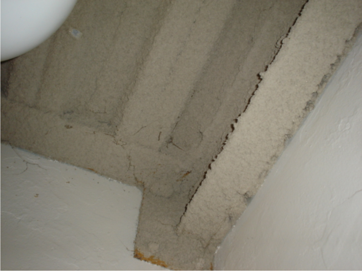
HA #31 – Non asbestos-containing spray-on fireproofing

For more information contact MSU Environmental Health and Safety – (517) 353-8956