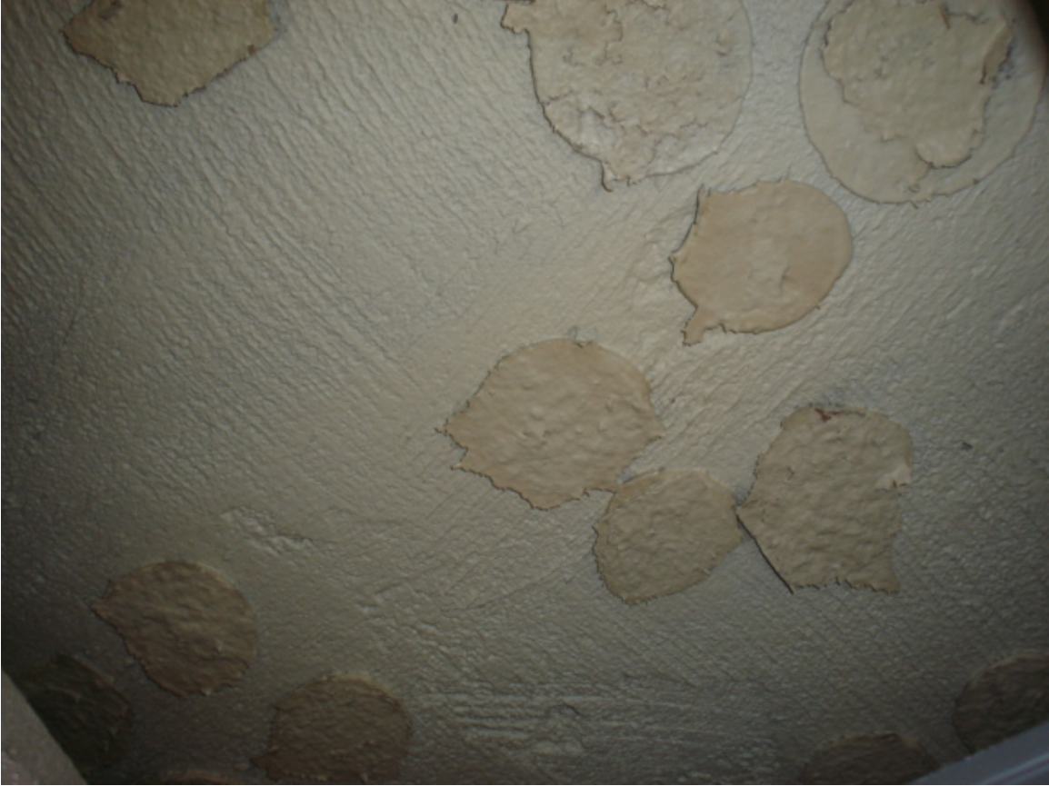
HA #17 – Asbestos-containing brown glue pods

For more information contact MSU Environmental Health and Safety – (517) 353-8956