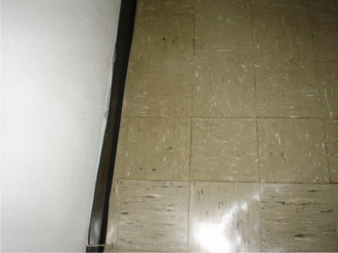
HA #5 – Asbestos-containing 9" x 9" light green floor tile with cream and black streaks and associated mastic

For more information contact MSU Environmental Health and Safety – (517) 353-8956