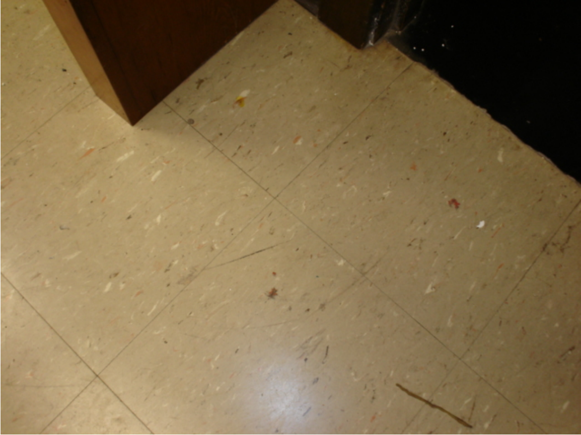
HA #47 – Asbestos-containing 12" x 12" tan floor tile with cream, pink and black streaks and associated non asbestos-containing mastic

For more information contact MSU Environmental Health and Safety – (517) 353-8956