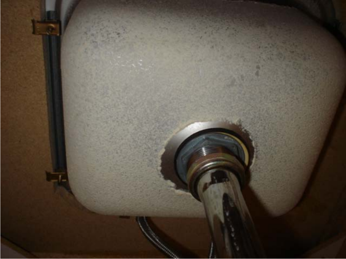
HA #25 – Non asbestos-containing white sink undercoating

For more information contact MSU Environmental Health and Safety – (517) 353-8956