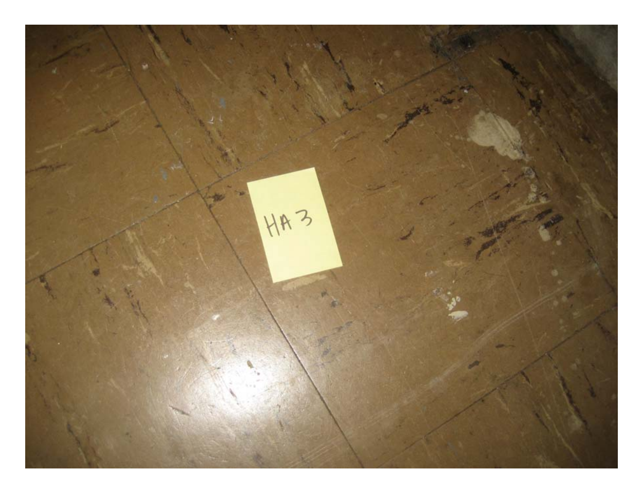
HA #3 – Asbestos containing 9"x 9" Light brown floor tile with white and black streaks (mastic negative)