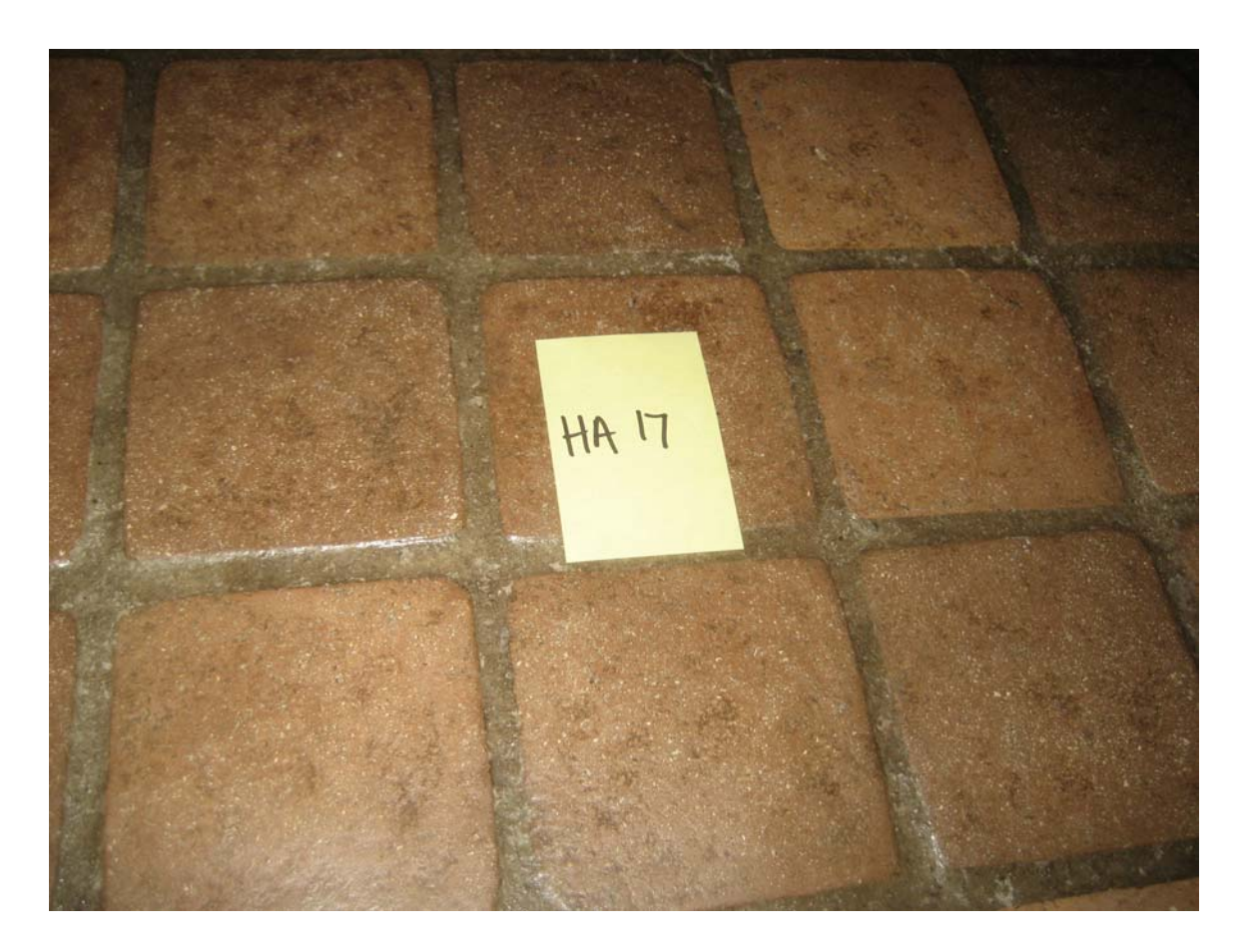
HA #17 – Assumed asbestos containing 2"x 2" Brown ceramic tile and bedding compound