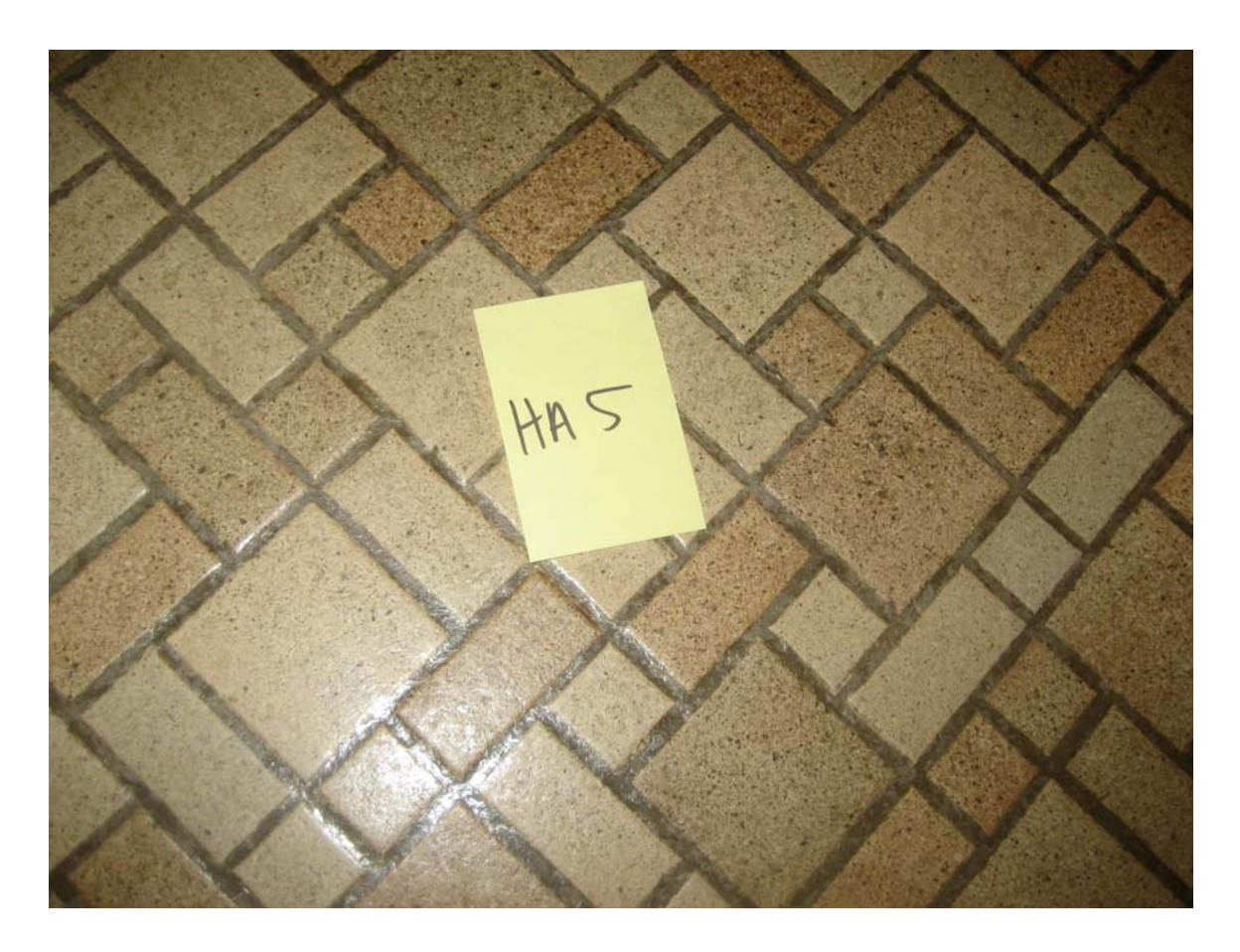
HA #5 – Assumed asbestos containing Multi shade and size brown ceramic tile and bedding compound