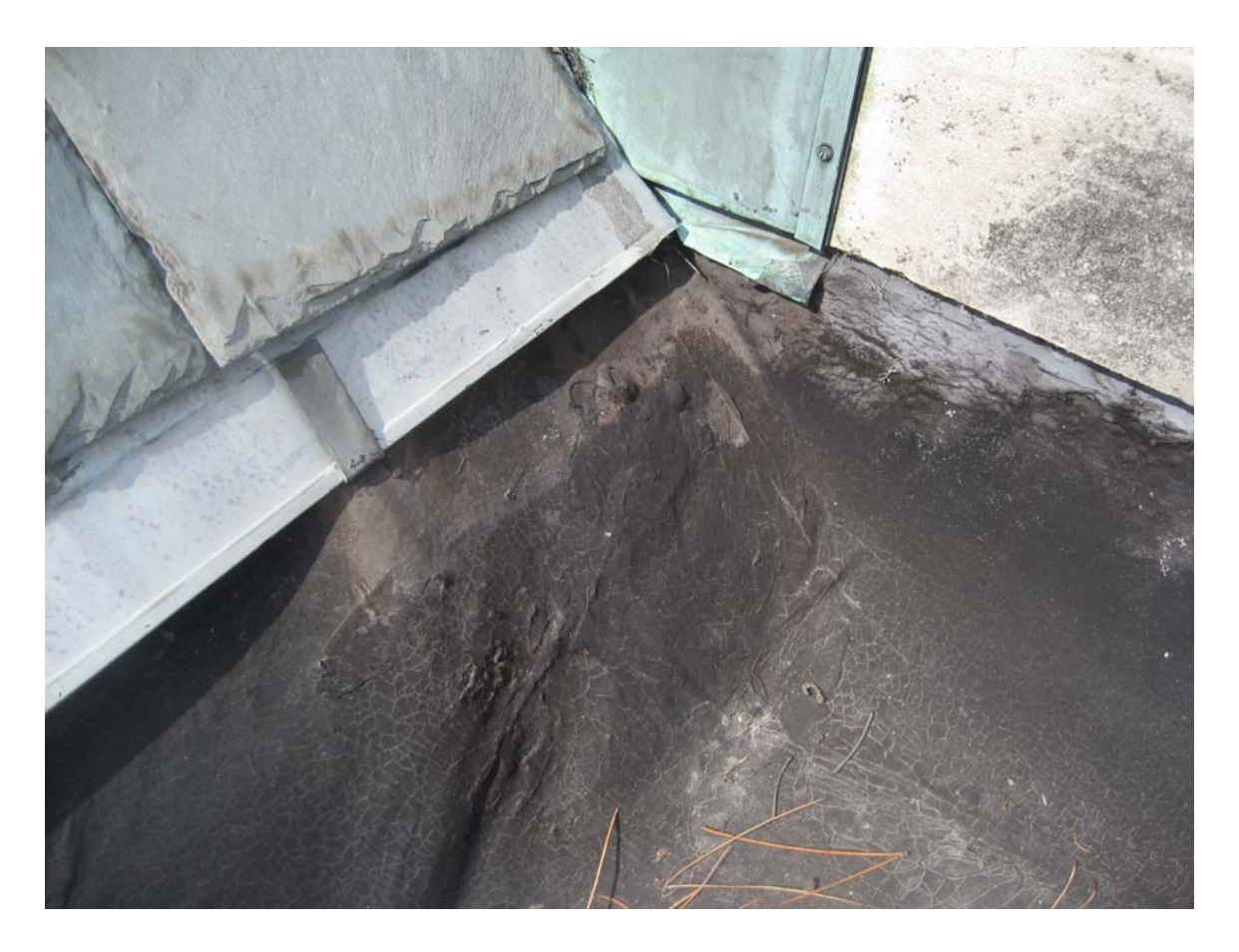
HA #21 – Assumed asbestos containing Roofing materials and products