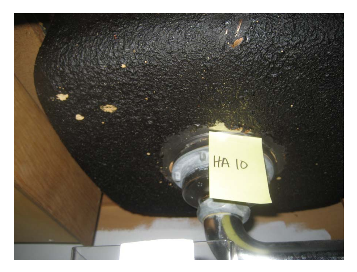
HA #10 –Asbestos containing Black sink undercoating