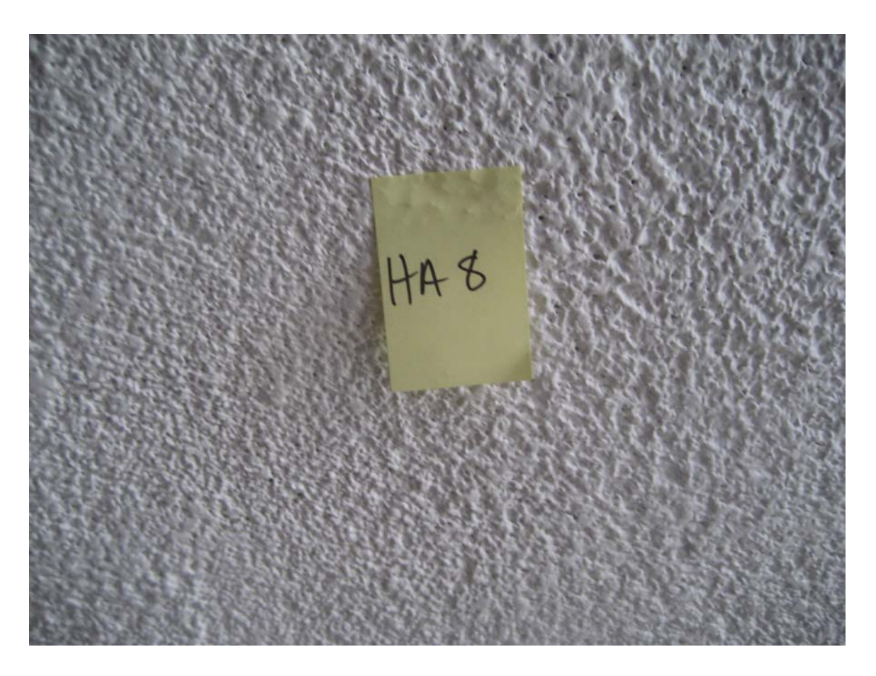
HA #8 – Asbestos Containing Medium textured plaster