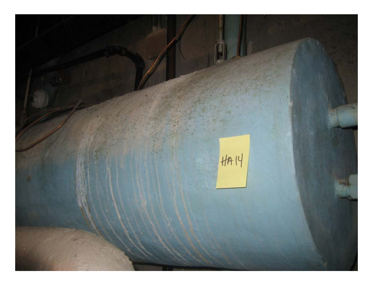
HA #14 – Asbestos containing Mag tank insulation