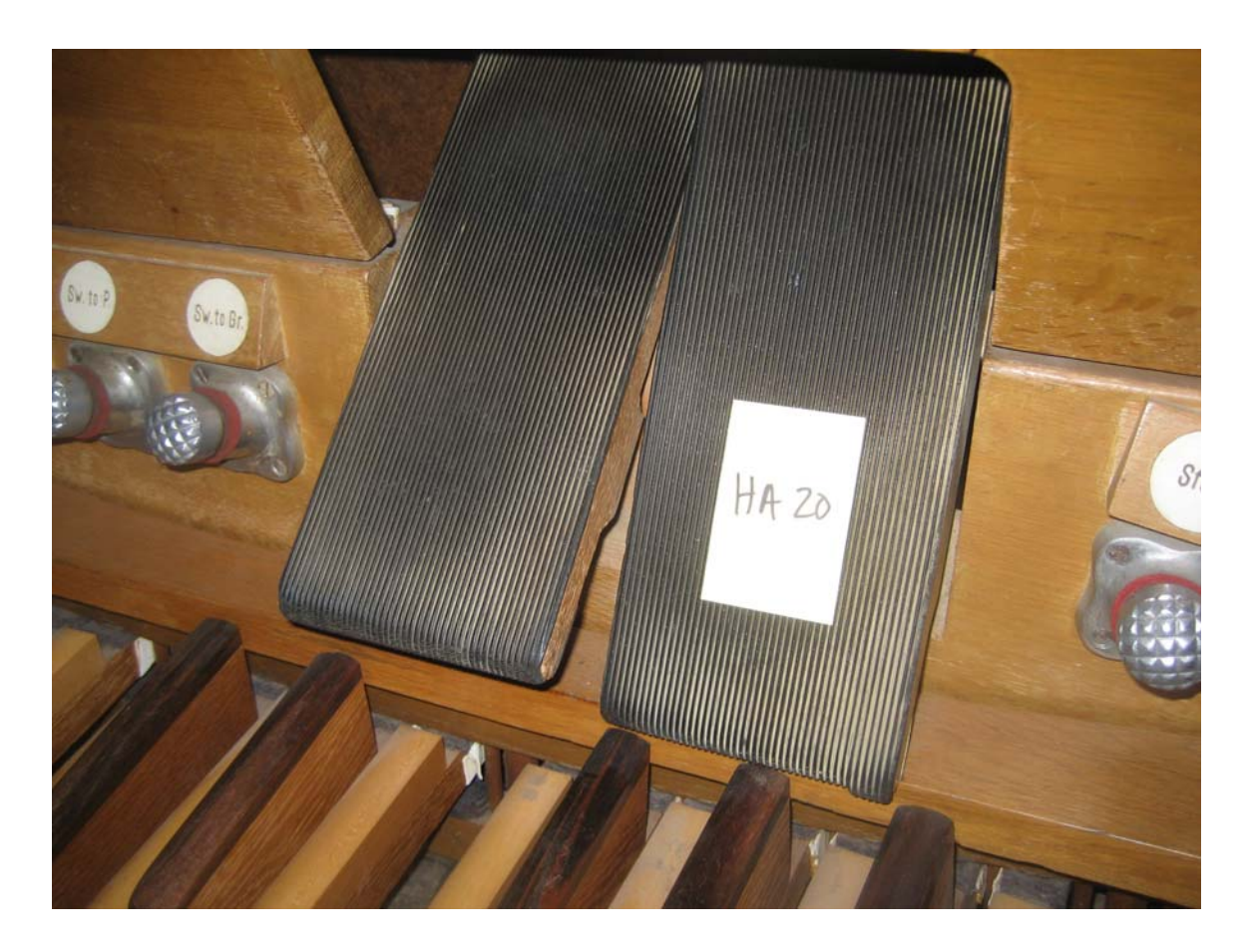
HA #20 – Assumed asbestos containing Black vinyl pedal tread and associated mastic