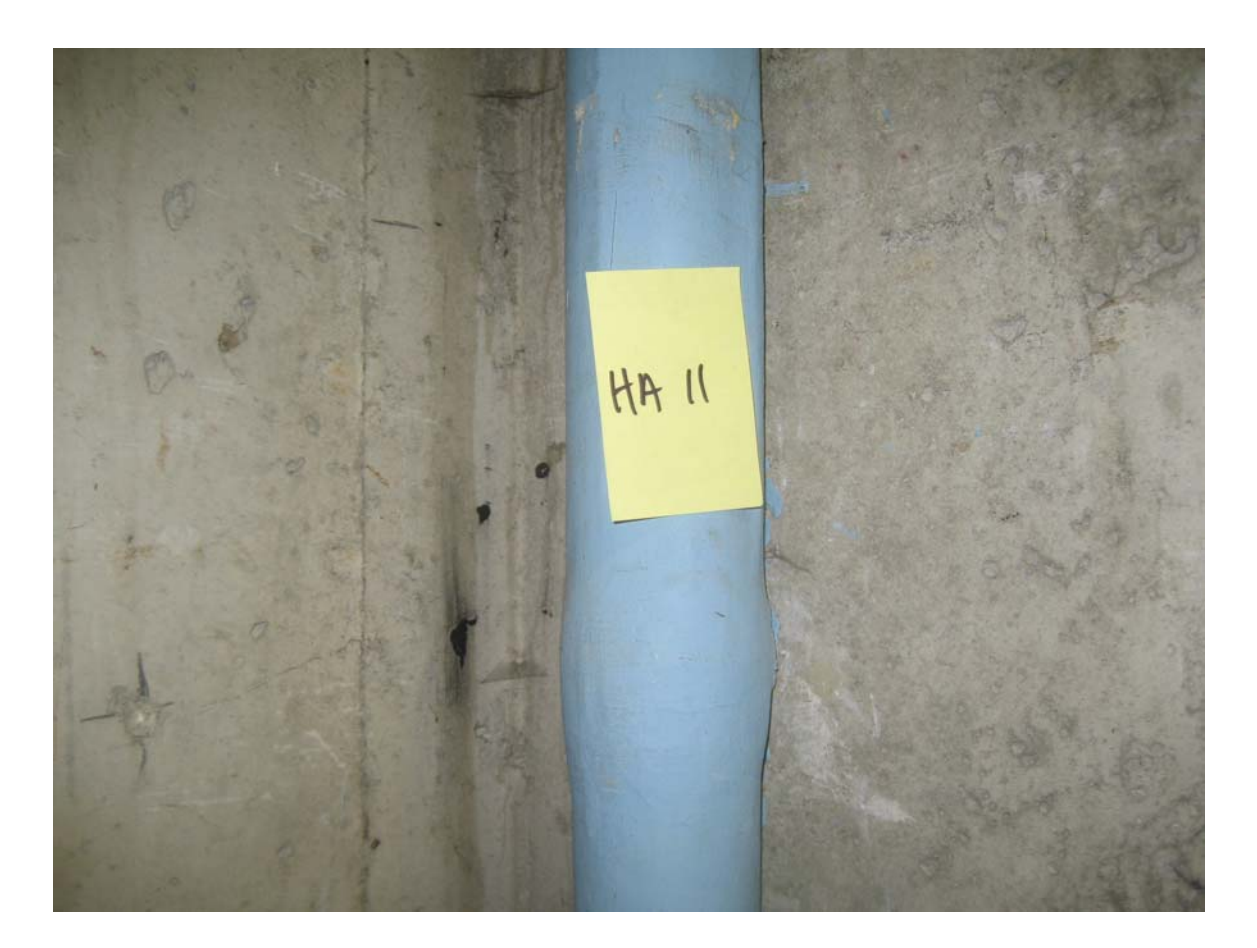
HA #11 – Asbestos containing Straight pipe insulation