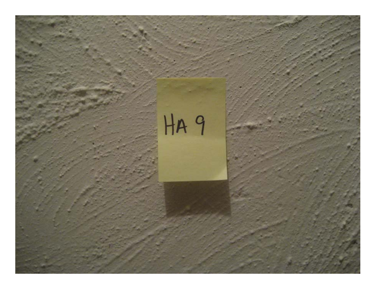
HA #9 – Non asbestos containing light texture skim coat plaster