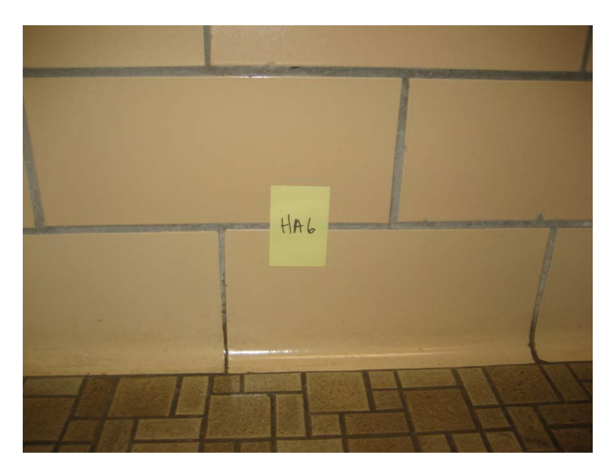
HA #6 – Assumed asbestos containing Tan ceramic wall tile and associated bedding compound