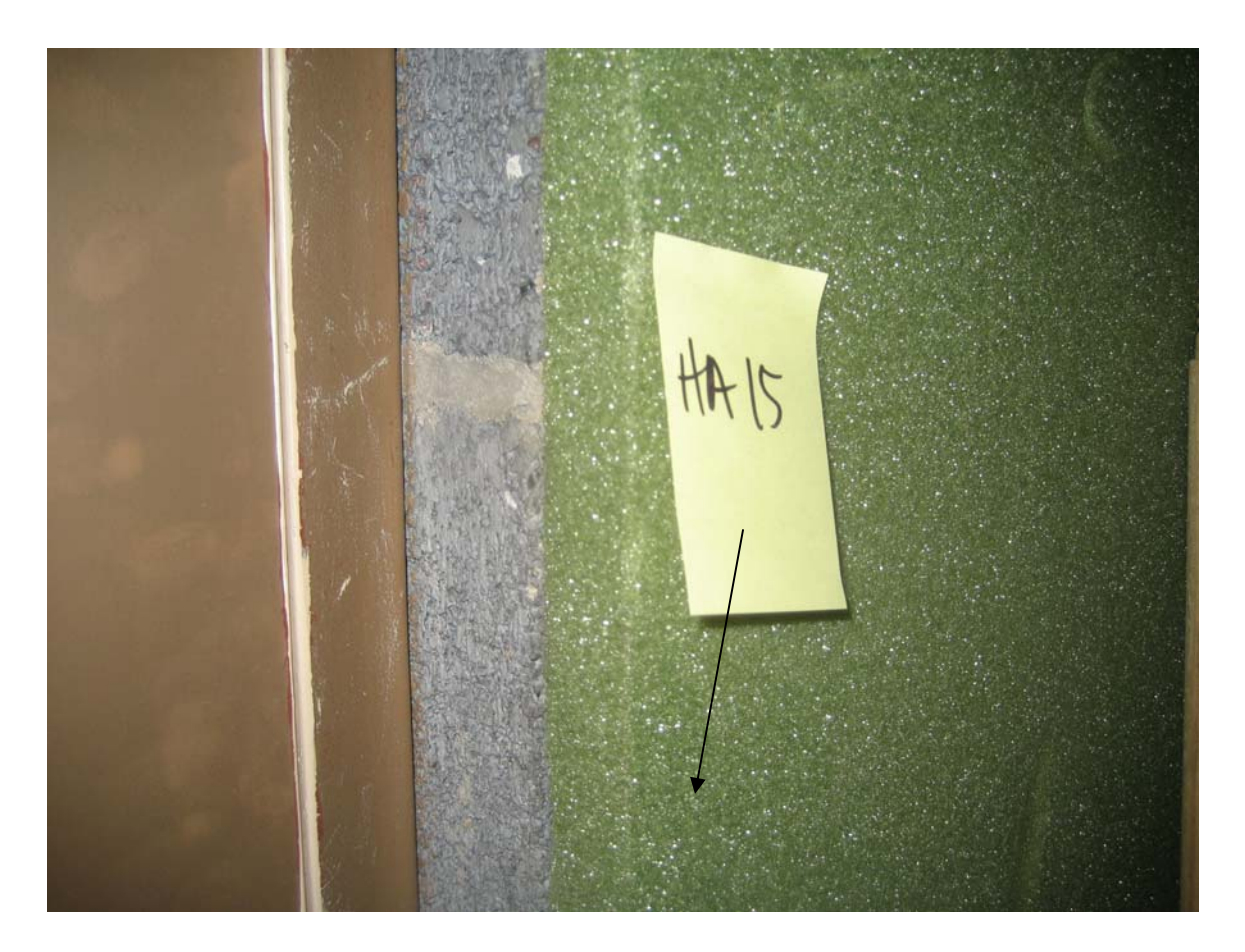
HA #15 –asbestos containing black gluepods on Green soundproofing (Green soundproofing NON-ACM)