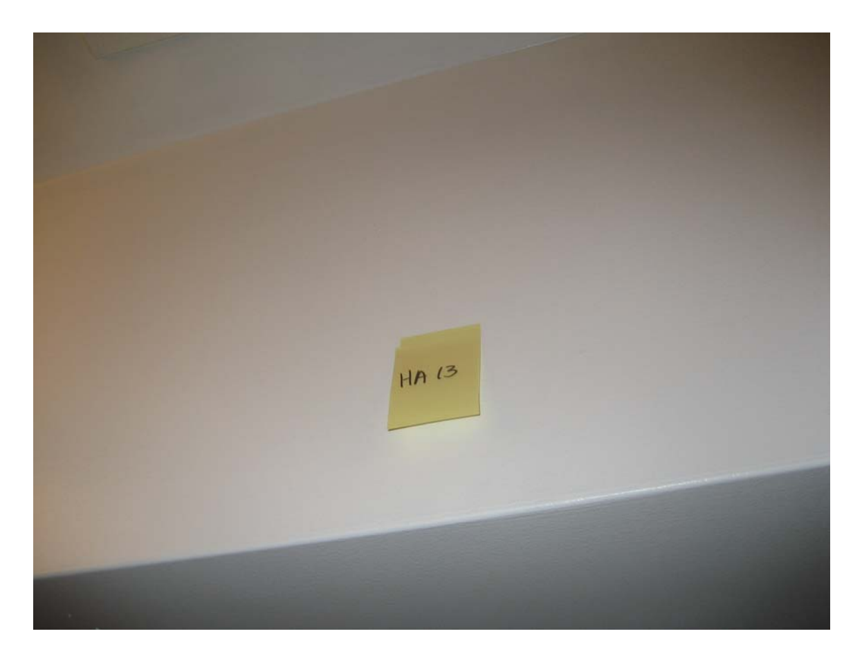
HA #13 – Non asbestos containing Smooth white plaster