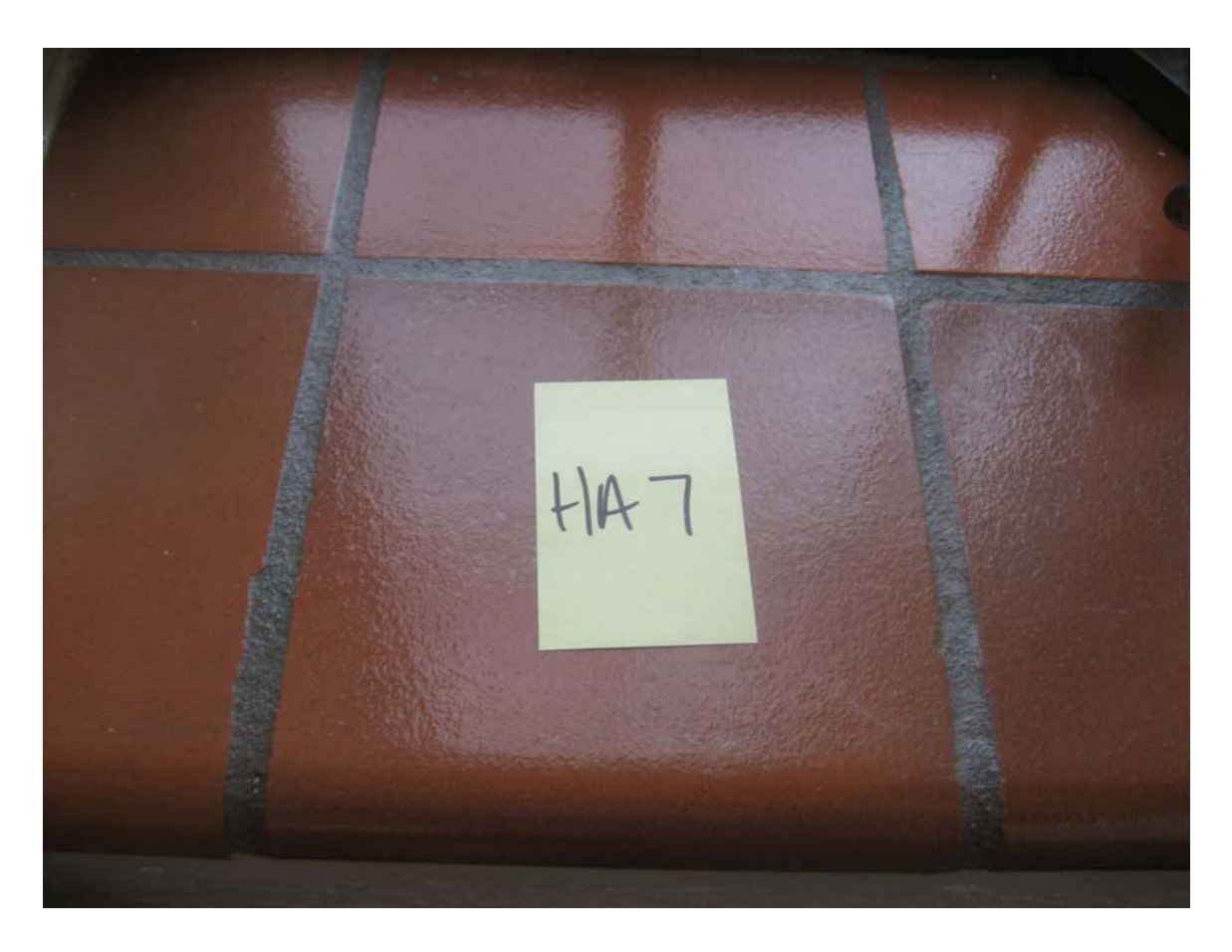
HA #7 – Assumed asbestos containing Orange ceramic tile and associated bedding compound