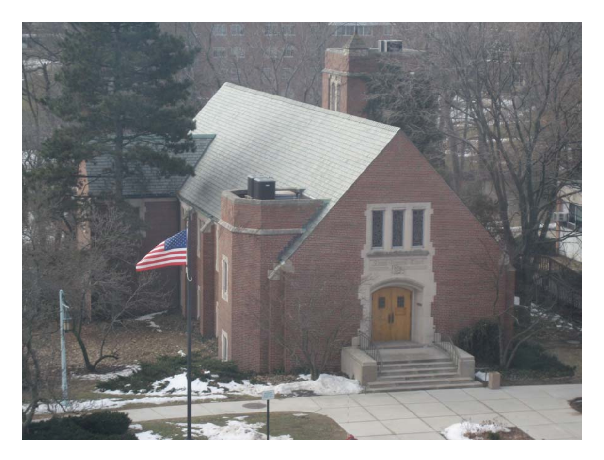
MSU Alumni Chapel (#30)