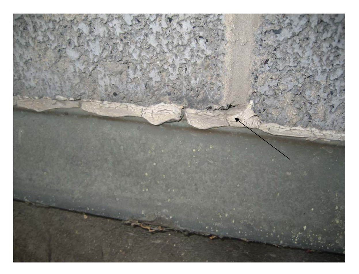
HA #23 – Asbestos containing White bell tower building caulk