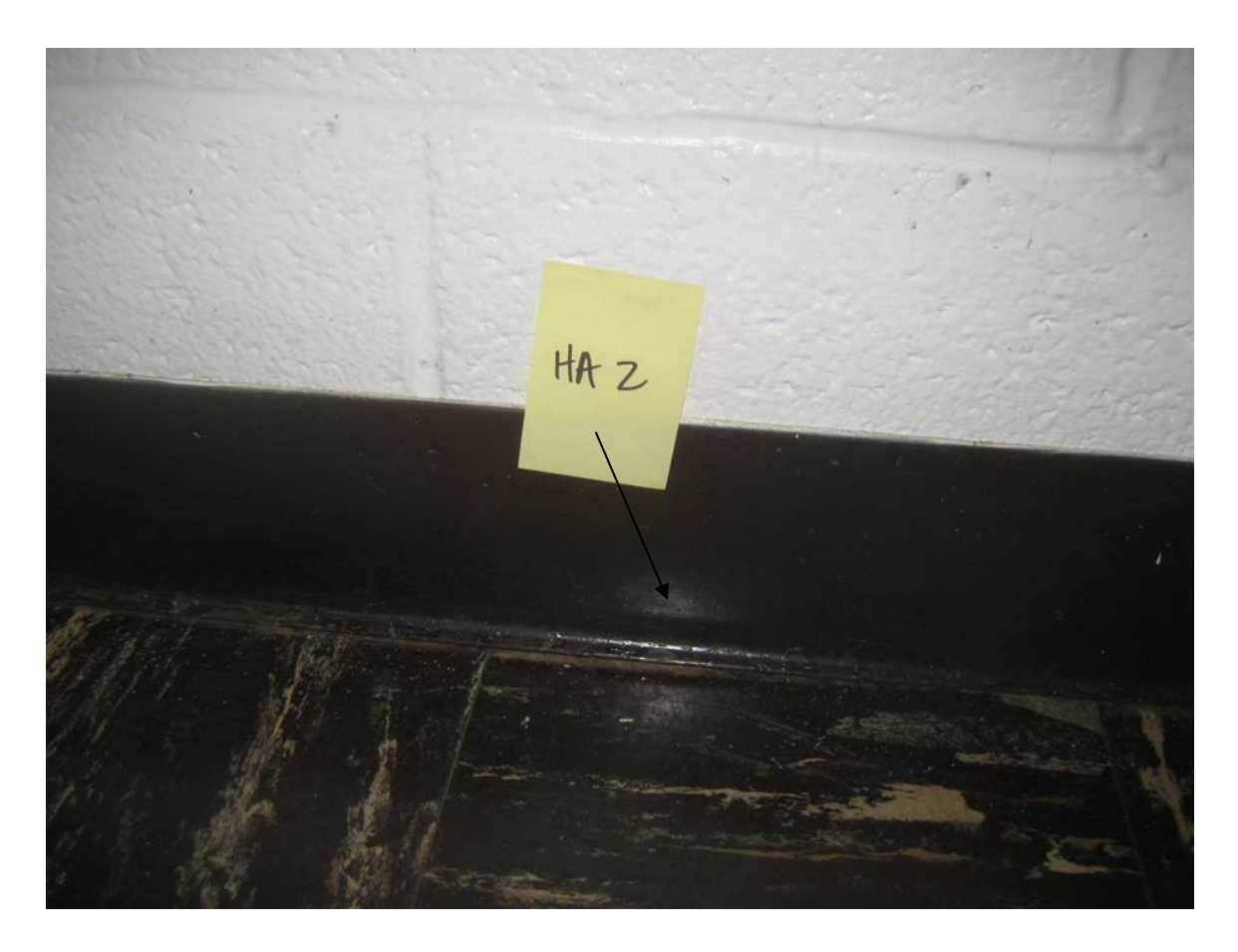
HA #2 – Non asbestos containing 4" Brown cove molding and associated mastic