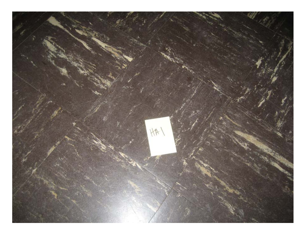
HA #1 –Asbestos containing 9"x 9" Dark brown floor tile with white and cream streaks (mastic negative)