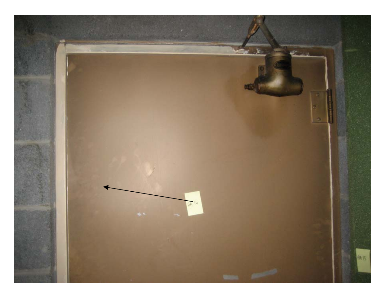
HA #16 – Assumed asbestos containing Fire door and frames