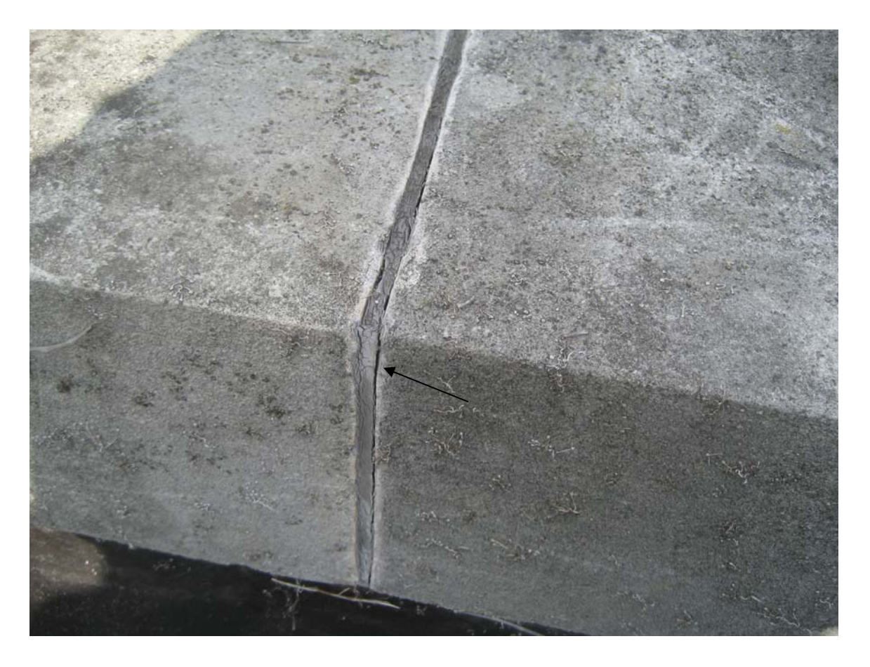
HA #22 – Assumed asbestos containing Light gray masonry caulk