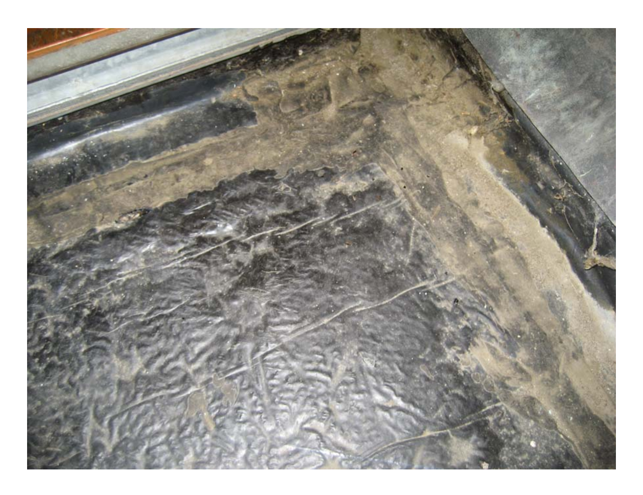
HA #4 – Non asbestos containing black vinyl waterproof material