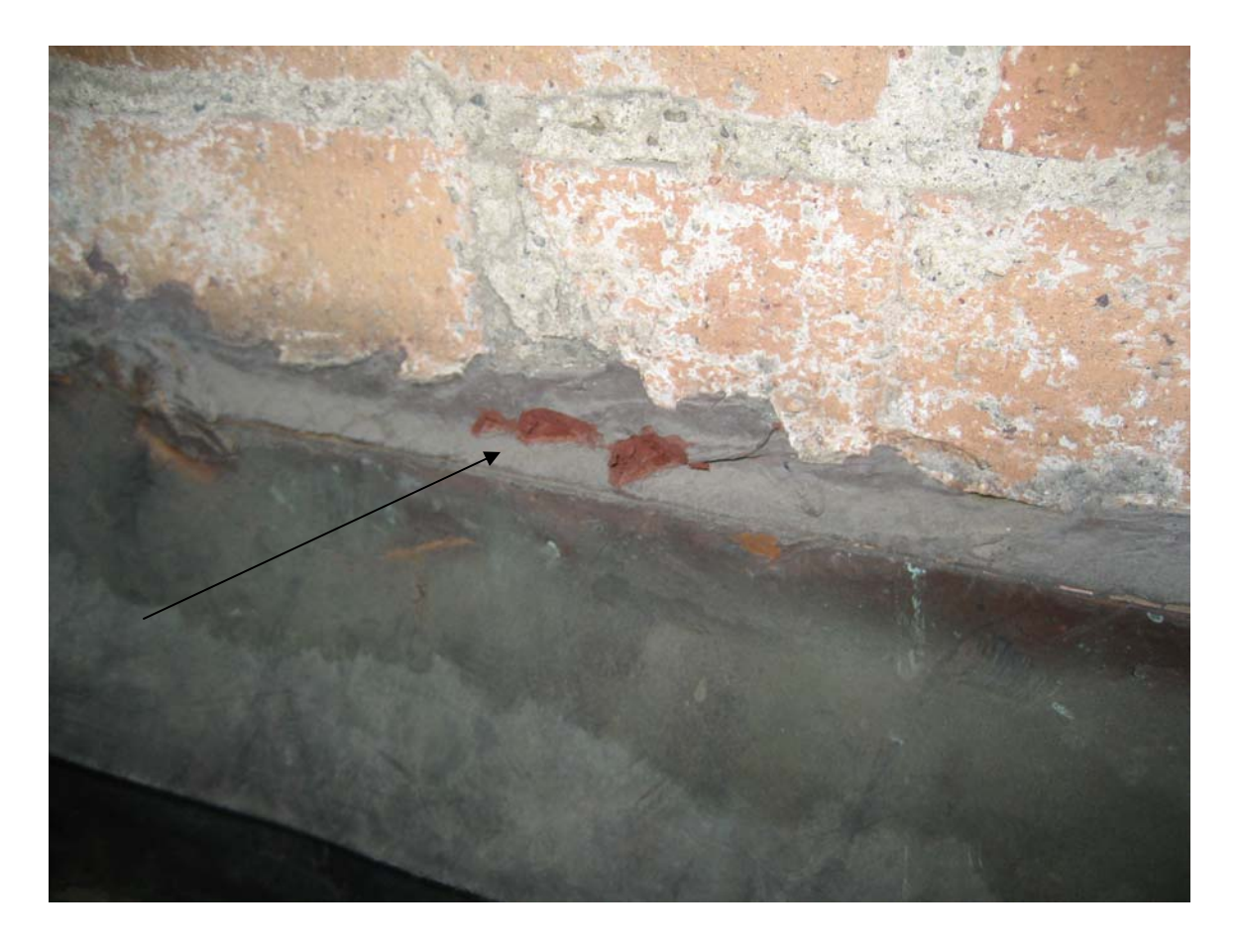
HA #3 – Asbestos containing black and brown building caulk