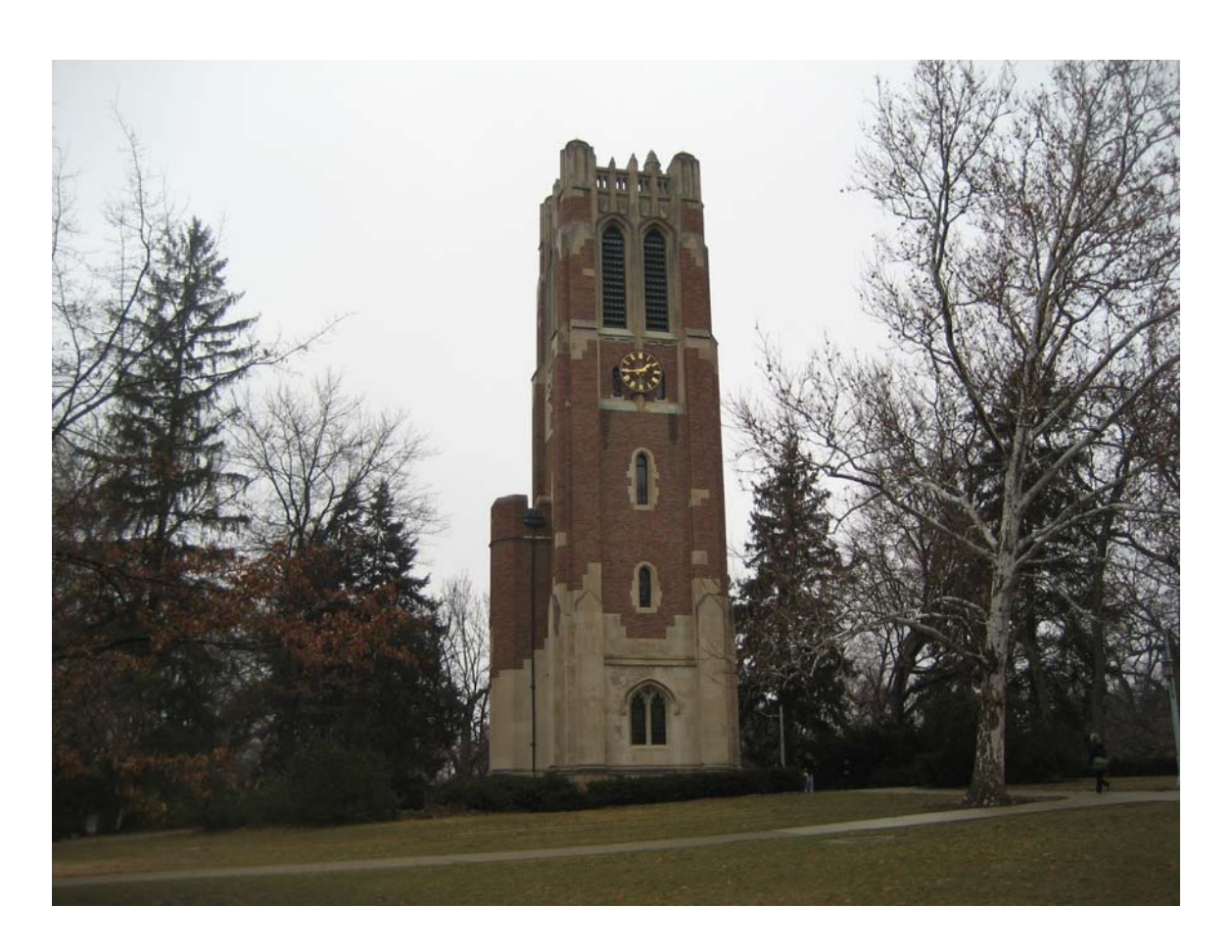
Beaumont Tower (#12)