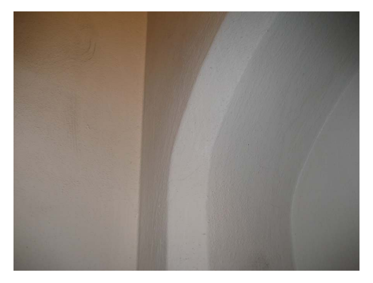
HA #1 – Non asbestos containing plaster with light texture