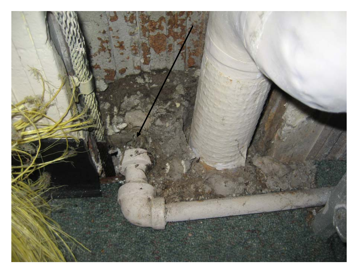
HA #6 – Asbestos containing pipe insulation between floors