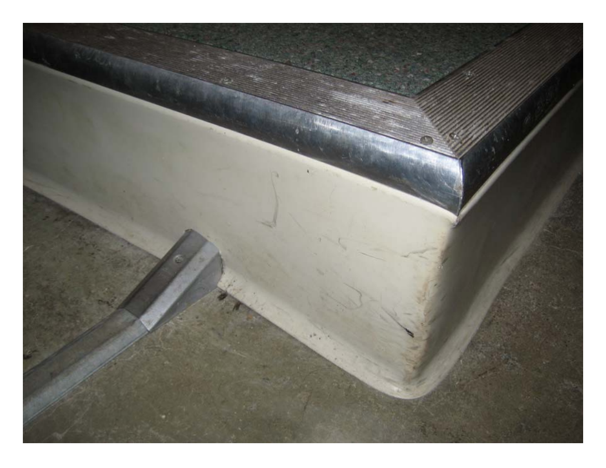
HA #5 – Assumed asbestos containing 6" khaki cove molding and associated mastic