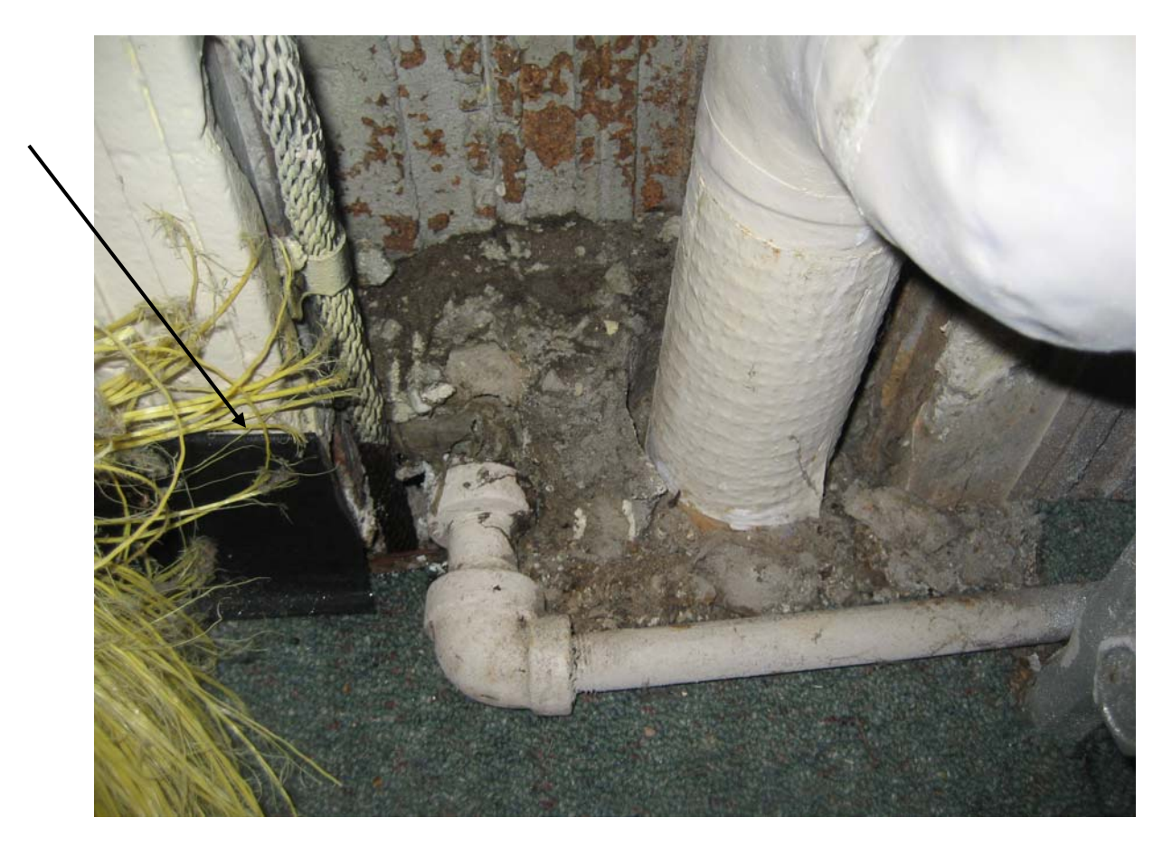
HA #2 – Non asbestos containing 4" black cove molding and associated mastic