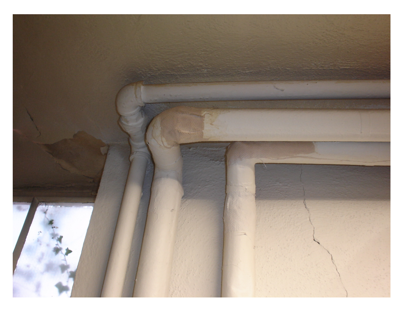
HA #10 – Asbestos-containing domestic water supply pipe joint and hanger insulation