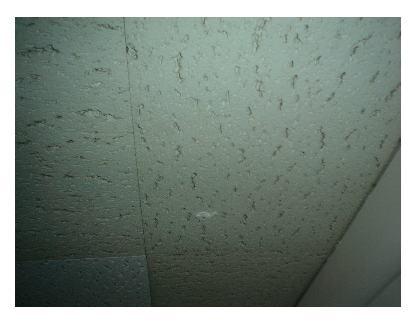
HA #16 – Non asbestos-containing 12" x 12" white ceiling tile with fissures and associated glue pods