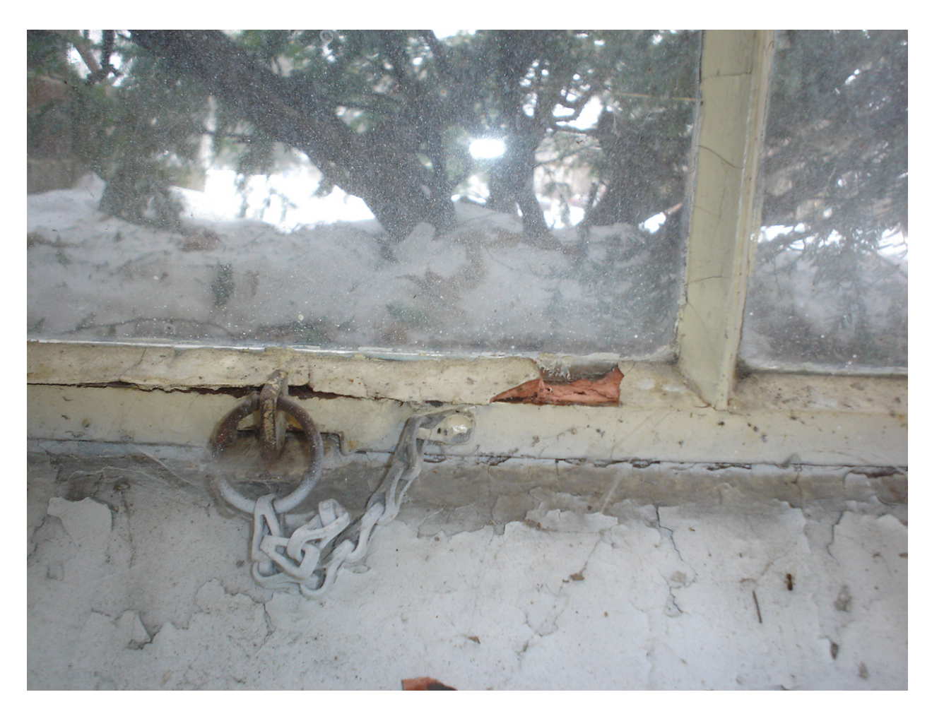
HA #5 – Non asbestos-containing window glazing caulk compound