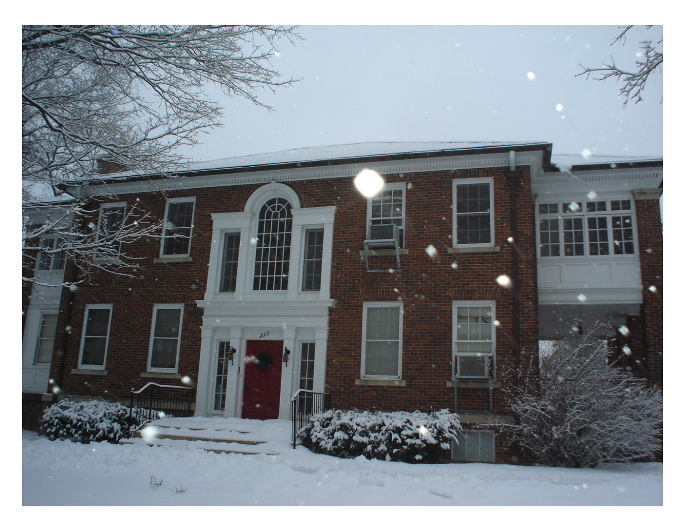
MSU Wills House