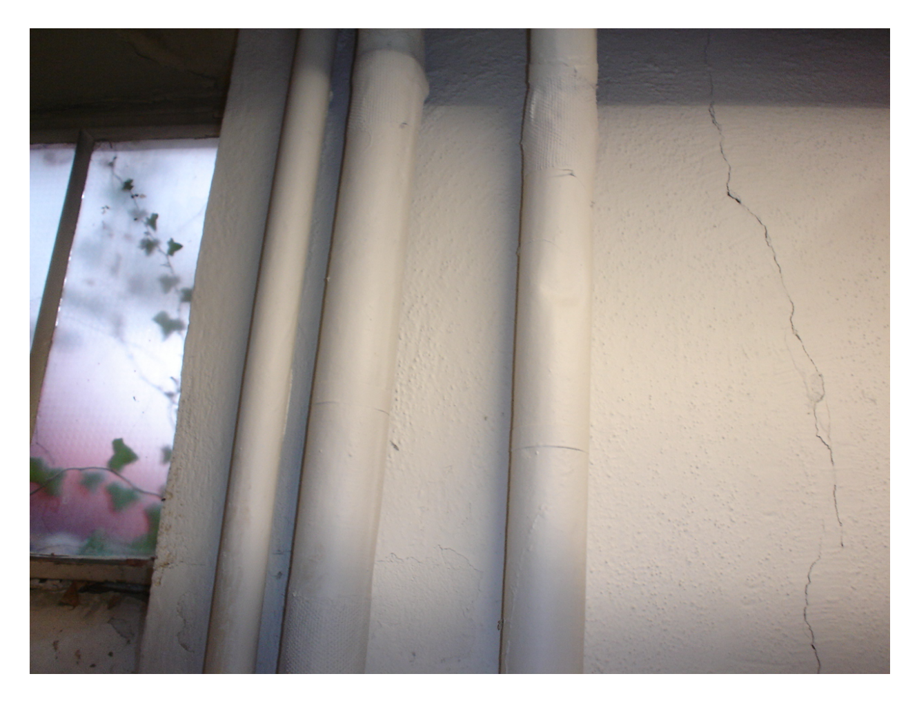
HA #9 – Asbestos-containing domestic water supply pipe straight insulation