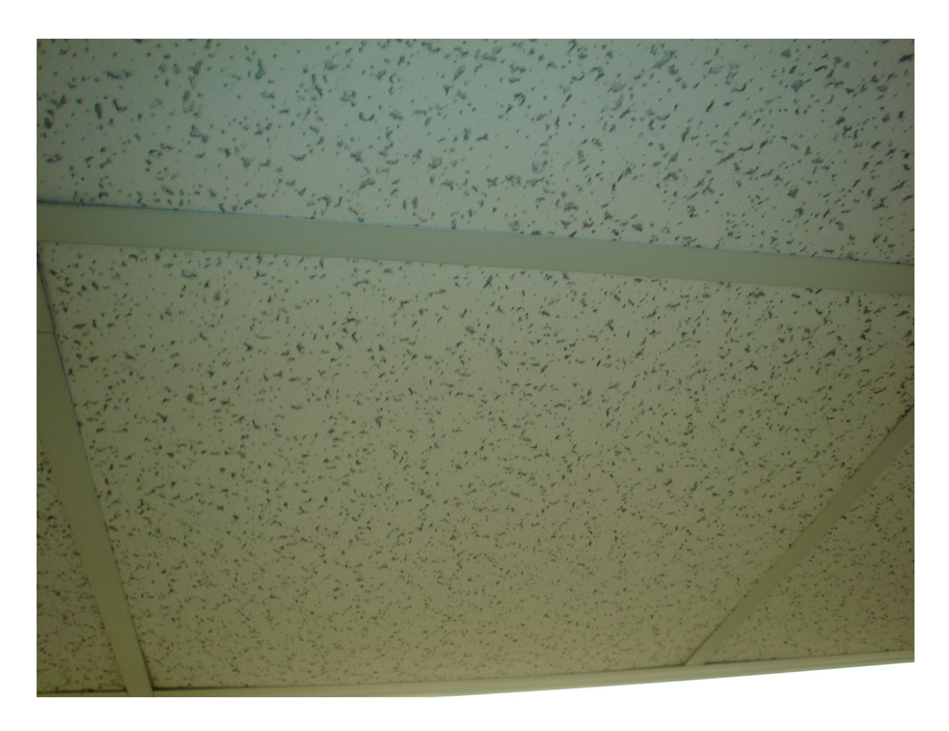
HA #12 – Non asbestos-containing 2' x 2' white lay-in ceiling tile with pin holes and fissures