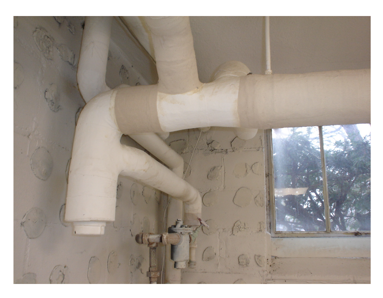
HA #2 – Asbestos-containing steam and condensate supply and return pipe joint and hanger insulation