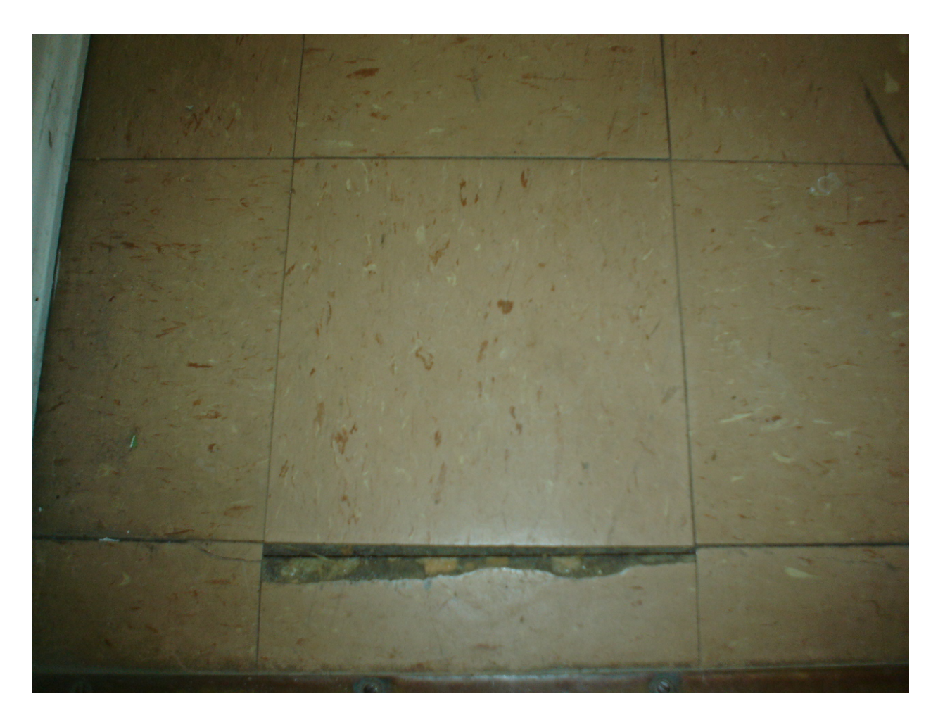
HA #6 – Asbestos-containing 9" x 9" tan floor tile with cream and tan streaks and associated non asbestos-containing mastic