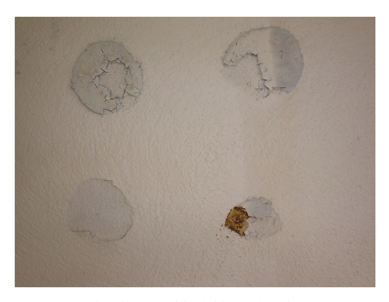
HA #4 – Asbestos-containing dark brown glue pods