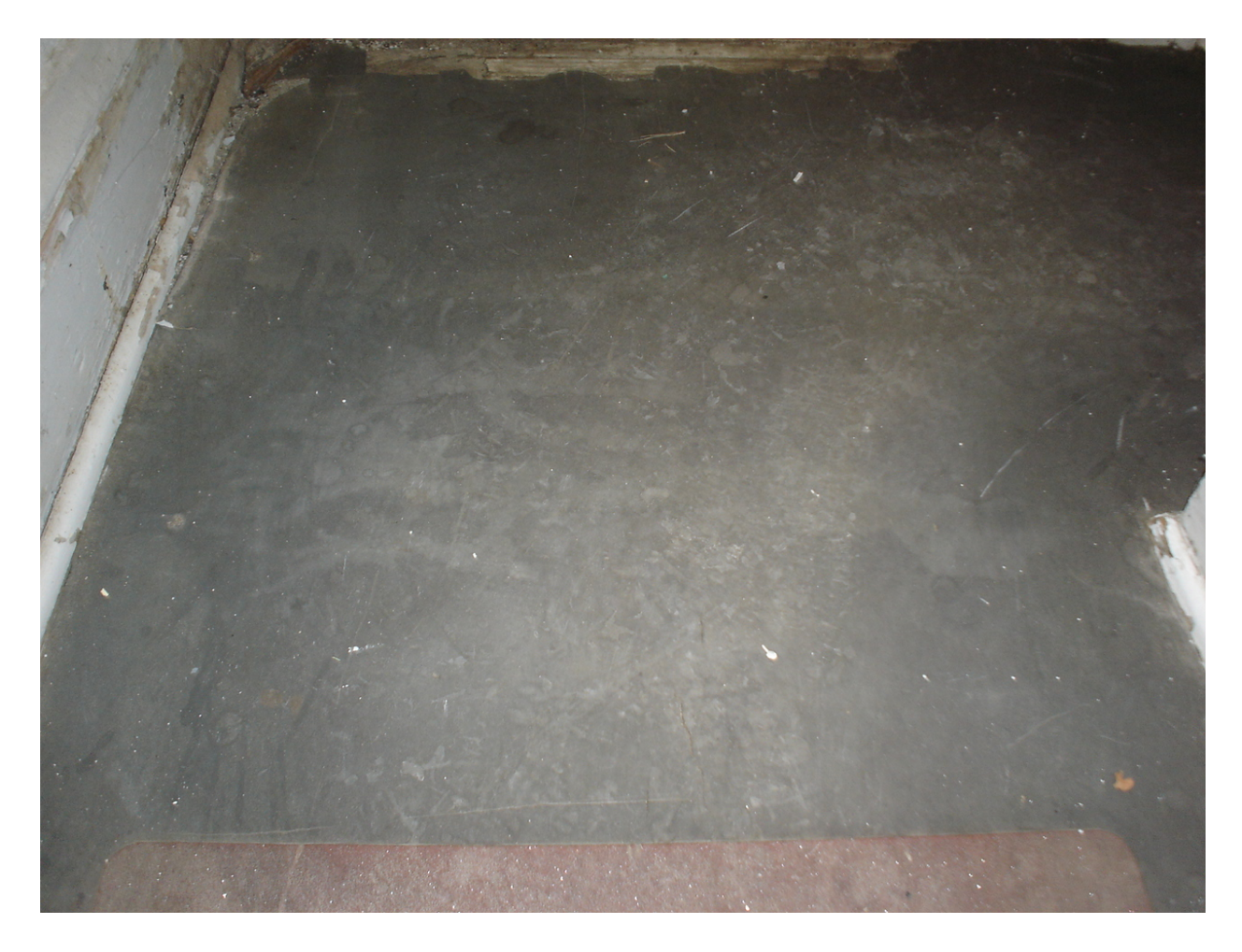
HA #8 - Non asbestos-containing dark green linoleum and associated mastic