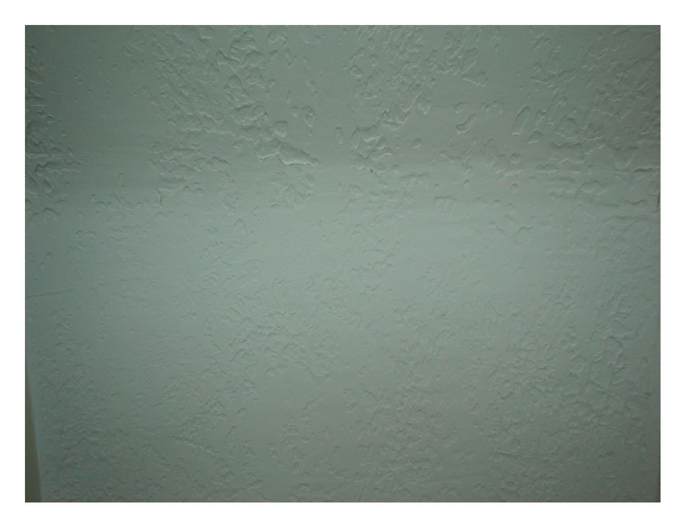
HA #11-Non as bestos-containing white textured ceiling plaster