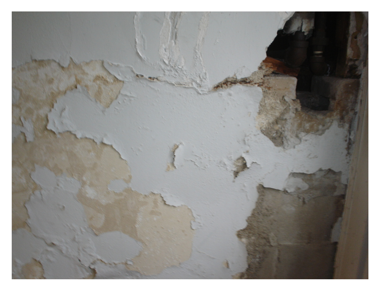
HA #3 – Asbestos-containing smooth wall and ceiling plaster