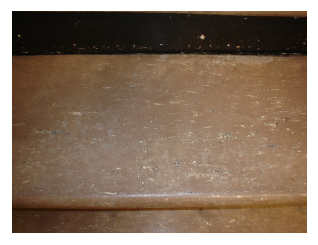
HA #7 – Asbestos-containing brown linoleum with cream and black streaks and associated non asbestos containing mastic