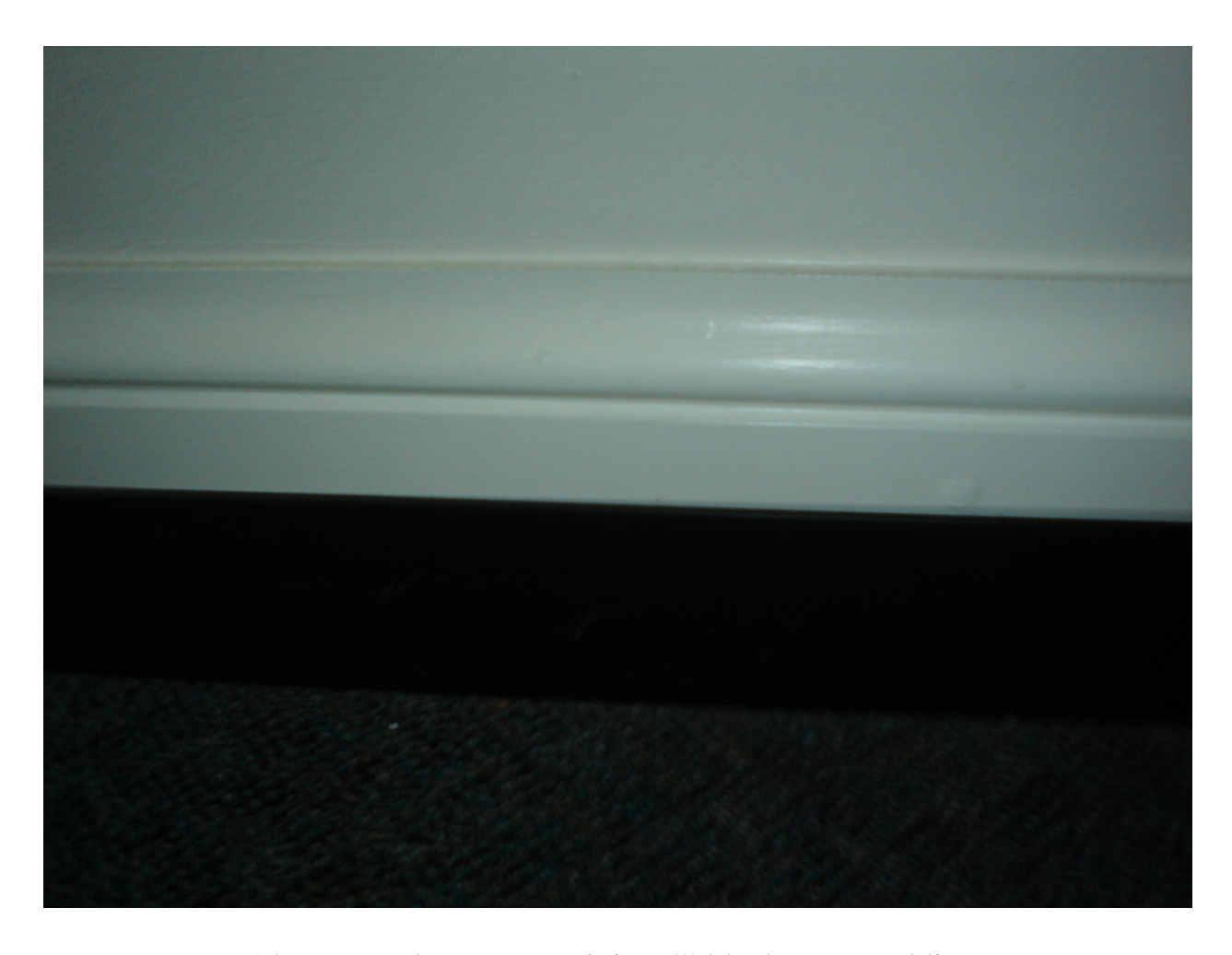
HA #14 – Non asbestos-containing 4" black cove molding and associated mastic