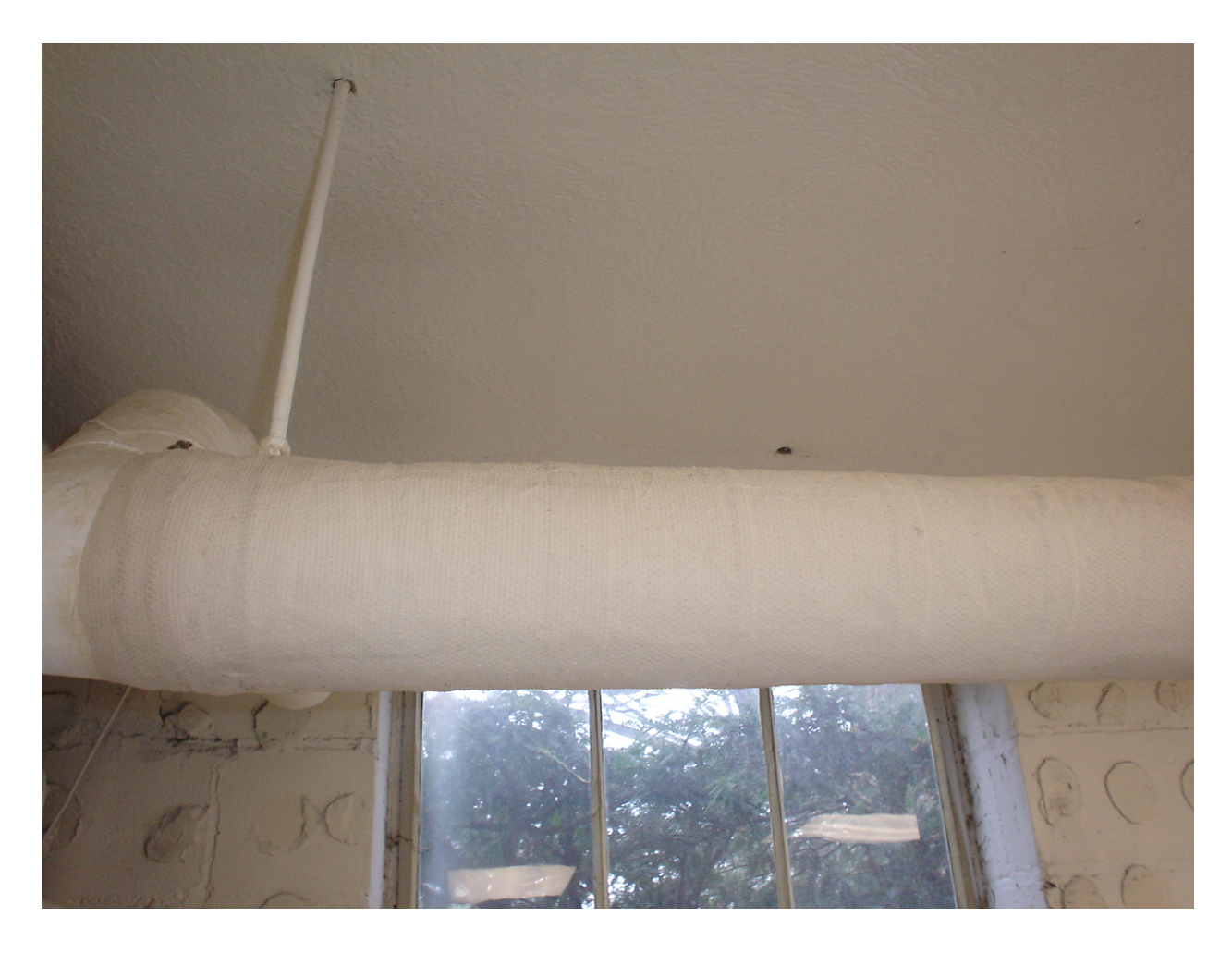
HA #1 – Asbestos-containing steam and condensate supply and return pipe straight insulation